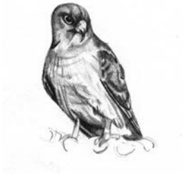
Red footed Falcon

Coming from Pafos, leave the motorway at the exit signposted Mandria/Anarita (the fourth exit out of Pafos). Join the old Lemesos road and take the turning to Mandria opposite a petrol station. Drive through the village taking a right and then left turn past the church and into the agricultural area. The ploughed fields/stubble – depending on the time of year – are excellent during migration for Red-throated Anthus cervinus and Water Pipit Anthus spinoletta , and the Black-headed, Blue-headed Motacilla flava flava and Grey-headed Motacilla flava thunbergi sub-species of the Yellow Wagtail. Red footed Falcon are common here on passage and harrier species such as Pallid Circus macrourus and Montagu Circus pygargus as well as rare migrating birds of prey, such as the Egyptian vulture Neophron percnopterus may be spotted during peak bird of prey migration periods. In the winter large flocks of Spanish Sparrow Passer hispaniolensis and wintering Starlings use the fields as do Stone Curlew Burhinus oedicanus . In 2004 a Black-bellied Sandgrouse Pterocles orientalis was recorded here – only the second record since 1992.