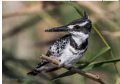
Pied Kingfisher, Zakaki, 15 th January.