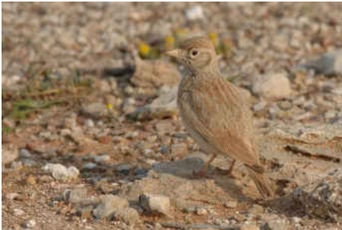
Above: Dunn's Lark seen at Agia Napa in April 2007. Below: Bar-tailed Lark at Cape Drepanum in March 2006.

http://www.iucnredlist.org/details/22717438/0