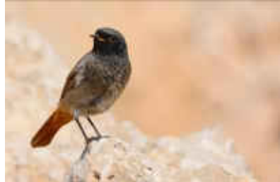
Western Black Redstart. Cape Greco, 6 th January.