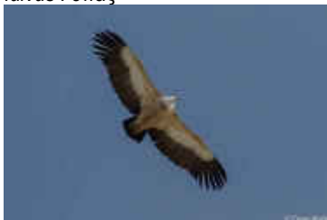
Eurasian Griffon Vulture, Kensington Cliffs, 8 th January.