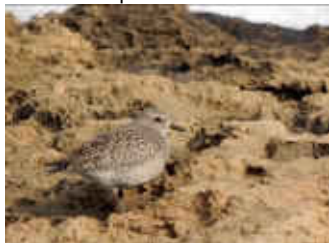
Grey Plover, Agia Trias, 4 th January.