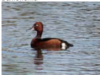
Ferruginous Duck, Bishop's Pool, 7 th January.