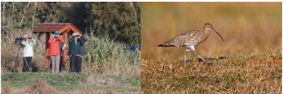
Photographs of the birders and a Eurasian Curlew at Phassouri on 1 st February

Five intrepid bird watchers went onto enjoy a late lunch at Kensington Cliffs and were rewarded for their dedication by a Peregrine Falcon and 3 Eurasian Griffon Vultures which took the day's total of species seen to 42.