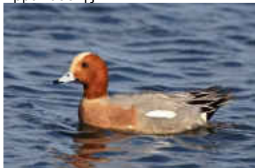
Eurasian Wigeon, Larnaca Sewage Works, 11 th January.