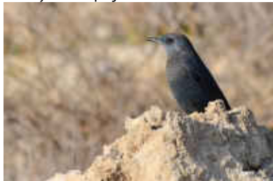
Blue Rock Thrush, Cape Greco, 6 th January.

Agia Varvara 1 22-Jan TJ Anarita Park 1 Male 26-Jan ME/DJW Asprokremmos Dam 1 male 5 & 25-Jan MSS/ME/CR Avgas Gorge 1 22-Jan TJ Agios Sozomenos 2 1-Jan JS Agios Sozomenos 1 Female 18-Jan JS Agios Sozomenos 1 25-Jan FGe Cape Drepanum 1 male 21-Jan DJW Cape Greco Army Camp 1 Male Singing 2-Jan ME Cape Greco 3 Two male and one female 4-Jan JS Cape Greco 1 6-Jan AgL Cape Greco 2 Male 29-Jan JS Cape Greco Rubbish Tip 3 2 Males / 1 Fem 30-Jan ME Davlos 1 14-Jan JG Germasogeia Dam 1 7 & 15-Jan CR/WAS/ADT Kamares (Tala), Paphos 1 male 1, 2, 19, 21, 22, 23 & 30-Jan DJW