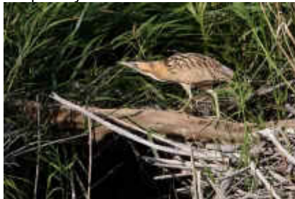
Eurasian Bittern, Finikaria, 7 th January.