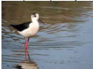
Black-winged Stilt, Athalassa Dam, 1 st January.

Athalassa Dam 2 1-Jan JS Larnaca Sewage Works 2 1-Jan ME Larnaca Sewage Works 4 2-Jan JS Larnaca Sewage Works 3 12, 18, 30 & 31-Jan CR/ME/JN/KH/ADT Larnaca Sewage Works 1 15-Jan JS Larnaca Sewage Works 1 1 CY 26-Jan ME