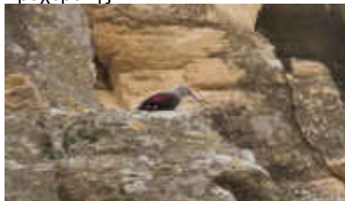
Wallcreeper, Avagas Gorge, 21 st January.