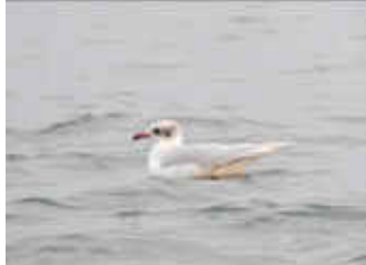
Mediterranean Gull, Oroklini, 4 th January.

Dolphin Rocks Larnaca Sea Front 1 2w 1-Jan ME Lady's Mile 1 3-Jan MKo Lady's Mile Marshes 1 juvenile 5-Jan SC with F Georgiades & M Konis Larnaca Airport Pool South 2 1 1w / 1 2w 3-Jan ME Larnaca Airport Pool South 1 2 w 21-Jan ME Larnaca Salt Lake North 8 7 Adults / 1 2w 3-Jan ME Larnaca Salt Lake 2 Adults 9-Jan ME Larnaca Salt Lake 1 Adult 11-Jan ME Larnaca Sewage Works 1 First winter 2- Jan JS Larnaca Sewage Works 1 Adult 9-Jan ME Oroklini Beach 1 4-Jan JS Oroklini Beach 4 non-breeding plumage 7-Jan CR/WAS