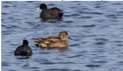
Gadwall, Larnaca Sewage Works, 6 th January.