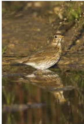
Song Thrush, Engomi, 30 th January.

Largest counts : Agia Napa Sewage Works 9 30-Jan ME Akhna Dam 10 31-Jan JS Armou Hills 6 4, 10 & 20-Jan CR Avagas Gorge 25 probably more 21-Jan DJW Cape Greco Rubbish Tip 5 30-Jan ME Drouseia 9 26-Jan JS Finikaria 6 26-Jan ME Marathounta 5 31-Jan CR Odoú 7 30-Jan JN Souni 12 28-Jan JN