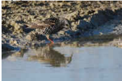
Common Starling, Lakatameia, 18 th January.