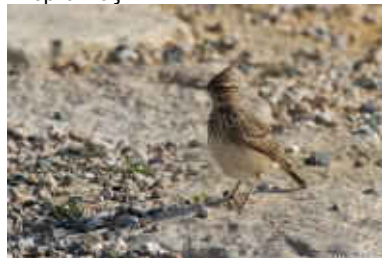
Crested Lark, Paphos Headland, 17 th January.