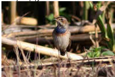
Bluethroat, Phassouri Reed Beds, 7 th January.