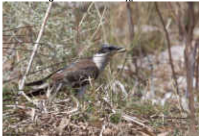
Great Spotted Cuckoo, Anarita Park, 13 th June.

Seen in ones and twos throughout June (mainly juveniles). Largest counts and all July records: Akrotiri Gravel Pits 1 21 & 23-Jul TRe Anarita Park 3 1 adult, 2 juv 13-Jun DJW Kato Kivides to Alassa 10 km Atlas square 7 all juveniles 19-Jun JN Kiti Dam 3 2 juvenile 15-Jun FGe Pytargou Woodland: Ezousas 1 12-Jul MSS Souni 7 all juveniles, mainly with Magpie parent 13-Jun JN Souni 1 heard calling close to Magpies 14-Jul JN Souni 1 seen in pines 25-Jul JN Tala, Paphos 3 Juv's being fed by Magpie 3-Jun DJW Vasa-Agios Amvrosios-Pachna-Malia10x10km square 4 3 juveniles seen and 1 heard calling 24-Jun JN