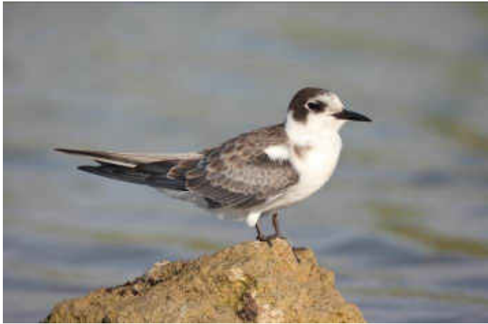
Juvenile Black Tern by Stavros Christodoulides