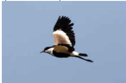
Spur-winged Lapwing, Paphos Sewage Plant, 31 st July.

Max count per location each month and interesting records: Akhna Dam 30 incl. chicks 6, 7, 8, 9, 11, 12, 13, 16, 20, 25, 26 & 27-Jun AKe Akhna Dam 20 inc some juveniles 2, 15, 18, 26 & 31-Jul JS/SC/FGe/AKe Aradippou Slurry Pits 2 7-Jun SC Fresh Water Lake South 1 2-Jun ME Fresh Water Lakes c25 19-Jul JS Larnaca Salt Lake 4 1 & 17-Jun ME/JS Larnaca Salt Lake 1 15-Jul JS Larnaca Sewage Works 9 inc one incubating 17-Jun JS Larnaca Sewage Works c12 26-Jul SC with L Sergides