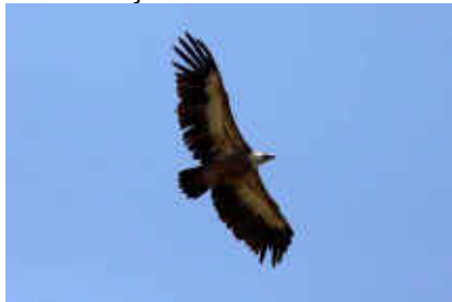
Eurasian Griffon Vulture, Mousere, 28 th July.