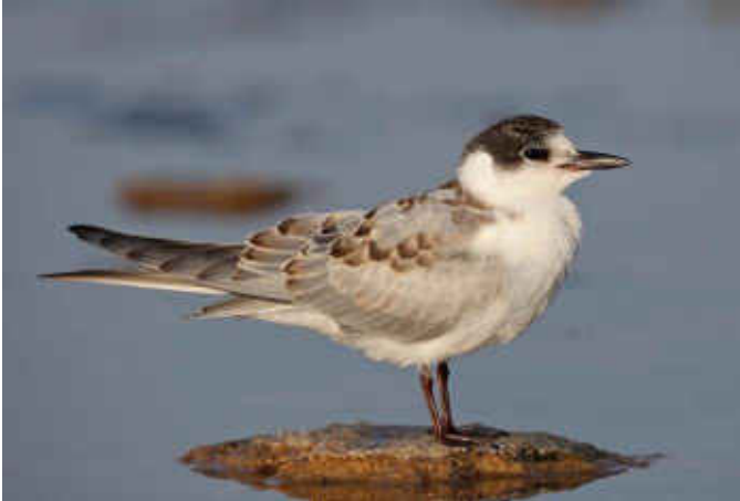
Above: Juvenile Whiskered Tern

These birds can be found over most of Cyprus' natural and artificial wetlands during September and October. Try Akhna Dam, Oroklini Marsh, Larnaca Sewage Works, Zakaki Marsh, Akrotiri Salt Lake, Asprokremmos Dam and Evretou Dam.