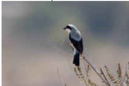
Lesser Grey Shrike, Mamonía, 27 th July.