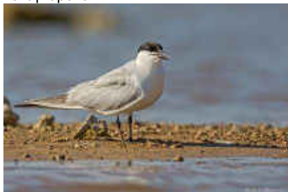
Gull-billed Tern, Akhna Dam, 18 th July.