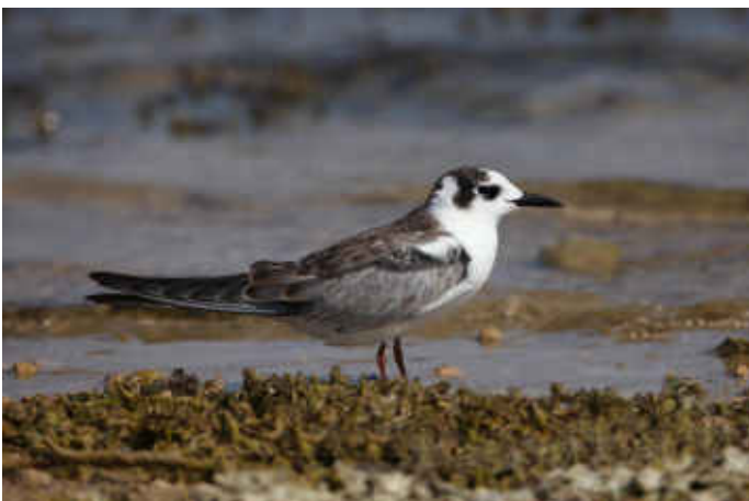
Below: Juvenile White-winged Tern by Stavros Christodoulides