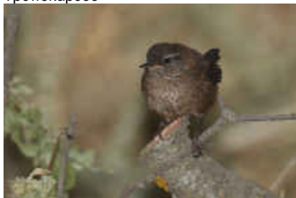
Winter Wren , Platania Picnic Site, 19 th July. Photograph by Stavros Christodoulides

Agios Theodoros Agrou (T100) 5 8-Jun CP/PPa Agros, Ladoudera, Kato Mylos Atlas Square (H05) 19 7-Jun CP/PPa Caledonian Falls 2 29-Jun and 11-Jul ME/JS Kalo Chorio Limassol, Louvaras, Gerasa H04 Atlas Square 3 9-Jun CP/PPa Kelefos Bridge - Mylikouri (2km part only) 9 incl. ad. with 2 begging juvs 1-Jul CR Livadi tou Pashia 2 Heard 11-Jul JS Livadi tou Pashia 1 seen in flight 12-Jul JN Louvaras Forest, Limassol (T093) 2 8-Jun CP/PPa Millomeris Waterfalls, Pano Platres 2 seen 26-Jul JN Mylikouri trail 6 28-Jun JN Persephone Trail, Troodos 1 26-Jul JN Platania Picnic Site 2+ 1+ seen, 1 heard only 19-Jul SC Troodos 2 28-Jul IBr