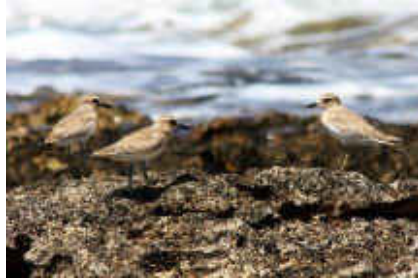
Greater Sand Plover, Paphos Headland. 29 th July.

Agia Thekla 1 with remains of orange breast band 16-Jul ME Paphos Lighthouse 2 moulting 22-Jun CR Paphos Lighthouse 4 at least 2 in ad plumage 18-Jul CR Paphos Lighthouse 3 22, 27, 28 & 29-Jul CR/IBR/CHO