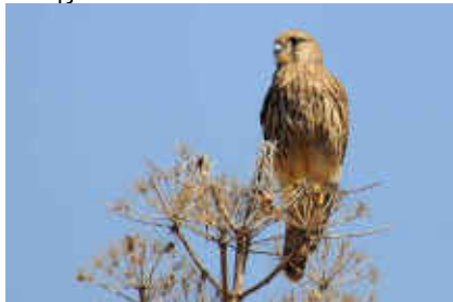
Common Kestrel, Agios Theodoros, 9 th June.