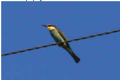
European Bee-eater, Mamonia, 28 th July.

Agia Napa Sewage Works 1 heard only 25-Jul SC with C Stavrou Agios Theodoros Agrou, Limassol (T100) 20 13-Jul CP/PPa Agros, Ladoudera, Kato Mylos Atlas Square (H05) 2 7-Jun CP/PPa Akhna Dam 35 migrants 31-Jul AKe Aspro Dam Canal 5 incl 1 possible juv at nest hole entrance 14-Jul CR Aspro Dam Canal 1 22-Jul CR Athalassa Park 1 heard only 4-Jun SC Athalassa Park 3 27-Jul JS Ay Nik (ESBA) 2 or 3 Heard 24-Jul ME Anavargos 4 My garden 21-Jun MSS Dhiarizos R. Kouklia Present heard 15-Jul MSS Kalavassos 2 8-Jun MH Kamares (Tala) Present heard only 27-Jul DJW Kouklia 1 juvenile 17-Jul TRe