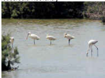
Eurasian Spoonbill, Oroklini Marsh, 15 th July.

Akhna Dam 1 juvenile 18, 19, 24, 25 & 27-Jun AKe/JS/ME Akrotiri Salt Lake 1 Adult 26-Jun ME Oroklini Marsh 2 1 adult, 1 juvenile 9 & 12-Jul ME/SC/JS Oroklini Marsh 3 2 adult, 1 juvenile 15, 17, 18, 22, 23, 24 & 25-Jul