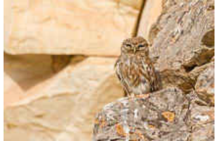
Little Owl, Asprokremmos Dam, June 19 th .

Akhna Dam 1 15, 26, 28, 29 & 31-Jul ME Alaminos 3 Heard. Night survey 27-Jun JS Anarita Park 1 13-Jun HST Anavargos Hills 3 8-Jun MSS Androlίκου 1 15-Jun HST Anogyra, Pachna, Prastio, Avdimou 10 x 10 km square 6 heard 15-Jun JN Anthoupoli Fields 4 2 adult, 2 juvenile, at nest site 3 & 5-Jun SC with F Georgiades Asprokremmos Dam 1 juvenile 19-Jun AS Ay Nik (ESBA) 1 Heard 29-Jul ME Ayioi Trimithias CBMS T123 2 5-Jun CP/PPa Dali 1 15-Jun FGe Evretou Dam 1 12-Jun HST Famagusta 1 18-Jul ME Germa-sogeia Dam 1 6-Jun ADT Kalavassos 1 8-Jun MH Kivisili 2 Duetting. Night survey 27-Jun JS Koilinia – Vretsia 1 24-Jun CR/DJW Koilinia 1 24-Jul DJW Larnaca Salt Lake 2 One heard and another seen 21-Jun JS Mennogeia 2 One heard and one seen. Night survey 27-Jun JS Neo Horio 3 27-Jun HST Omodhos 1 in flight 20-Jun JN Panagia Stazousa SPA 1 At nest hole 9-Jun JS Panagia Stazousa SPA 2 30-Jun and 21-Jul JS Parekkliasia 2 6-Jun ADT Pervolia 2 Heard. Nocturnal Survey M05 15-Jun JS Petounta Point 1 Heard 27-Jun JS Souni 2 4 & 9-Jun JN