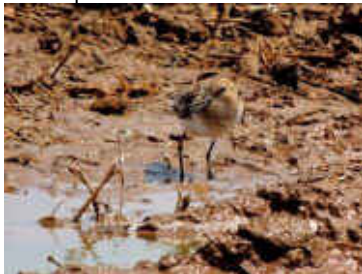
Little Stint, Larnaca Desalination Plant, 21 st July.

Max counts per location each month: Akhna Dam 13 1 & 2-Jun AKe Akhna Dam 11 29-Jul ME Fresh Water Lake South 4 25-Jul ME Lady's Mile c10 28-Jul IBr Larnaca Desalination Plant 4 On fields which were being watered 21-Jul JS Larnaca Sewage Works 1 17-Jun JS Larnaca Sewage Works 3 15-Jul JS Oroklini Marsh 2 1-Jun ME Oroklini Marsh 5 22 & 26-Jul ME/JN