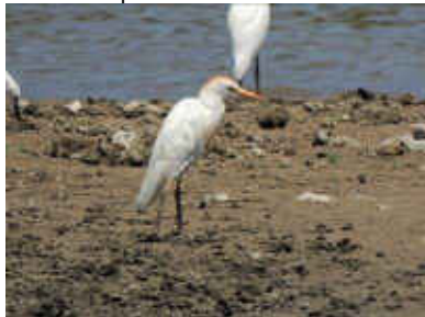
Cattle Egret, Akhna Dam, 24 th June.