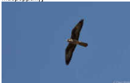
Eleonora's Falcon, Tala, 11 th July.