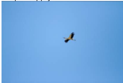
White Stork, Polis, 13 th June.

Polis village 1 Overflying. Photographed 13-Jun HSt