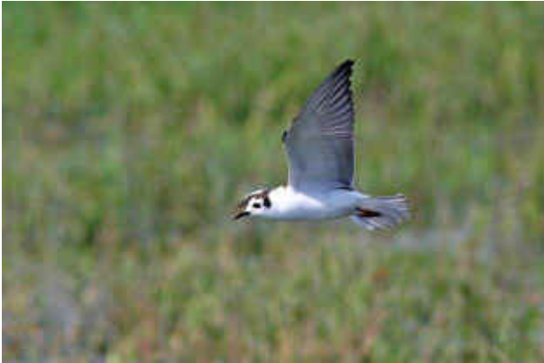
Left: White-winged Tern and below Whiskered Tern.