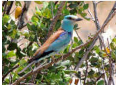
European Roller, Panagia Stazousa, 19 th June.

Over 150 records received for this species for June and July. Largest counts and interesting reports given below: