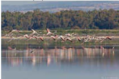
Greater Flamingo, Akrotiri Salt Lake, June 14 th .

Max counts per location each month: Akrotiri Salt Lake 140 24-Jun CR Akrotiri Salt Lake c.30 seen distantly 28-Jul IBr Fresh Water Lake South 1 Adult 1-Jul ME Larnaca Airport Pool North 25 7-Jun ME Larnaca Sewage Works 2 7-Jun ME Larnaca Sewage Works 1 26 & 28-Jul SC/JS Oroklini Marsh 89 29-Jun ME Oroklini Marsh c100 1-Jul ME Pachyrammos bay 1 24-Jun CS Spiro's Beach 4 Flying West 17-Jul ME