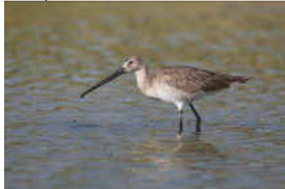
Black-tailed Godwit, Akhna Dam, 6 th July.