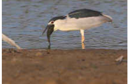
Black-crowned Night Heron, Akhna Dam , 6 th July.