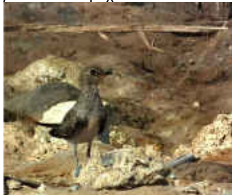
Juvenile Collared Pratincole, Zakaki Marsh, August 6 th.