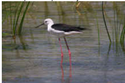
Black-winged Stilt, Zakaki Marsh, August 8 th .

Max count per location: Akhna Dam 9 11-Aug SC Akrotiri Gravel Pits 6 pits in scrub, nearest Phasouri Reed-beds 23-Aug SC Akrotiri Salt Lake 3 female and juv, juv alone 22-Aug MH Aradippou Slurry Pits 5 2 adult, 3 juvenile 11-Aug SC Athalassa Dam 3 30-Aug FGe Bishop's Pool 18 21-Aug JSta