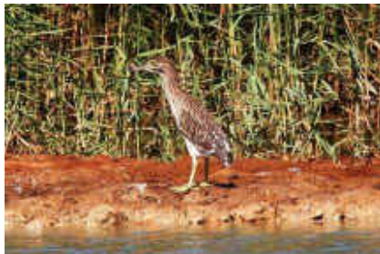
Juvenile Black-crowned Night Heron, Zakaki Marsh, August 1 st.