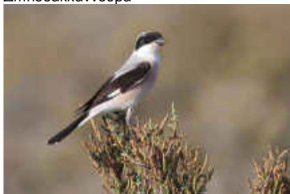
Lesser Grey Shrike, Akrotiri Gravel Pits, August 20 th .