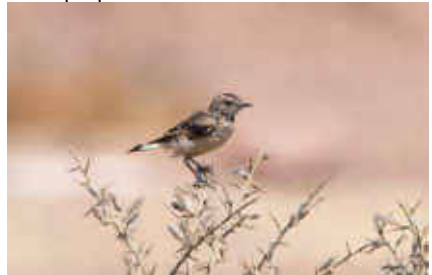
Juvenile Cyprus Wheatear, Mavrokolympos Dam, August 4 th .

CYPRUS WHEATEAR Oenanthe cyprica Σκαλιφούρτα