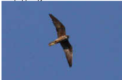
Eleonora's Falcon, Kensington Cliffs, August 1 st.

Akrotiri Gravel Pits 1 13-Aug TRe Akrotiri Gravel Pits 2 25 & 31-Aug CR