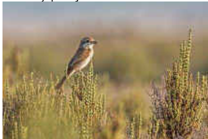
Red-backed Shrike, Akrotiri, August 30 th.