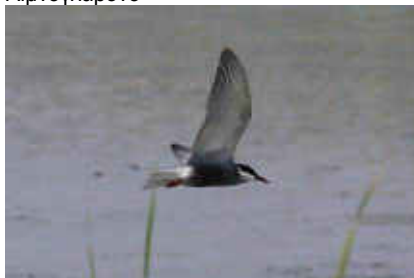
Whiskered Tern, Zakaki Marsh, August 8 th.

WHISKERED TERN Chlidonias hybrida Λιμνογλάρονο