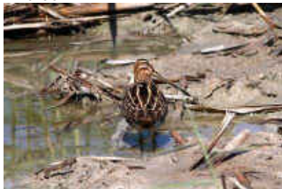
Common Snipe, Zakaki Marsh, August 8 th.

COMMON SNIBE Gallinago gallinago Πικατσόνι