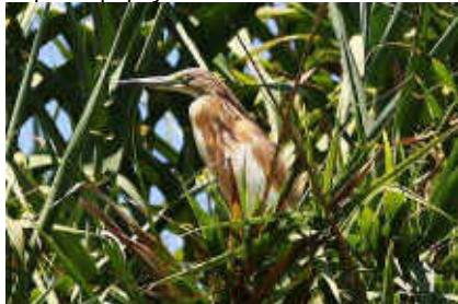
Squacco Heron, Ezousas Pools, August 2 nd.