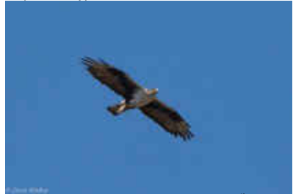
Bonelli's Eagle, Kathikas, August 7 th.

BONELLI'S EAGLE Aquila fasciatus Περτικοσιάχινο