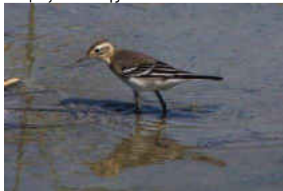
Citrine Wagtail, Zakaki Marsh, August 8 th.

Akhna Dam 1 1st Winter 1, 3, 4, 14 & 15- Aug ME/FGe/SC/AKe