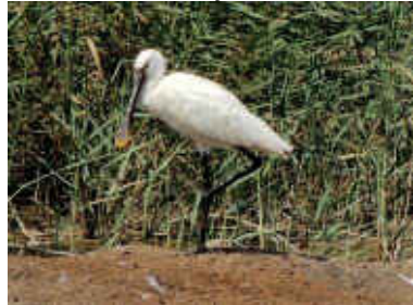
Eurasian Spoonbill, Zakaki Marsh, August 30 th.