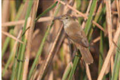
Eurasian Reed Warbler, Phassouri Reed Beds, August 20 th .

Akhna Dam 1 6 & 11-Aug SC Akrotiri Salt Lake, Eucalyptus Plantation North of Lake 1 18-Aug SC Dhiazozos R. Kouklia Present 25-Aug MSS Ezousas Pools 2 31-Aug MSS Lower Ezousa Pools 2 13 & 21-Aug CR Oroklini Marsh 1 2 & 26-Aug ME Partenitis Dam 2 heard only 11-Aug SC Phassouri Reed-beds 2+ 9-Aug SC Phassouri Reed-beds c6 20-Aug SC Phassouri Reed Beds 1 heard calling 22- Aug MH Zakaki Marsh 3 1, 8 & 30-Aug CR/Cho/JS Zakaki Marsh 4+ 4-Aug JS Zakaki Marsh 1 7, 20, 25 & 28-Aug JE/SC/ADT/CR/ME Zakaki Marsh 2 23, 24 & 30-Aug SC/JS/JN