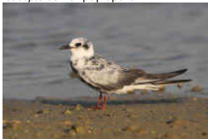
White-winged Tern, Akhna Dam, August 11 th .

WHITE-WINGED TERN Chlidonias leucopterus Ασπρογλάρονο