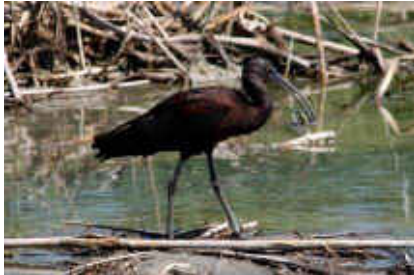
Glossy Ibis, Zakaki Marsh, August 8 th.

Max counts per location and interesting records: