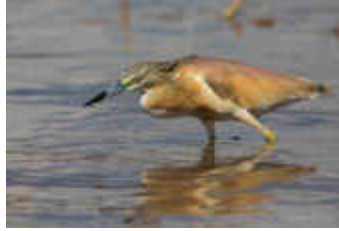
Squacco Heron, Asprokremmos Dam, 12 th May.

SQUACCO HERON Ardeola ralloides Βορτακοφάγος