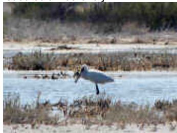
Eurasian Spoonbill, Spiros Pool, 16 th May.

EURASIAN SPOONBILL Platalea leucorodia Κουταλάς