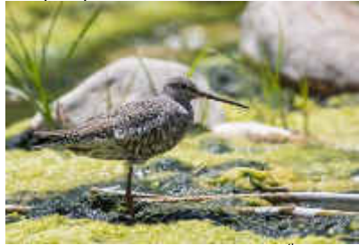
Spotted Redshank, Agia Varvara, 5 th May.