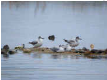
Little Gull, Lady's Mile, 4 th May.