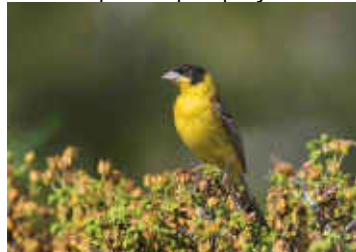
Black-headed Bunting, Vavatsinia, 23 rd May.