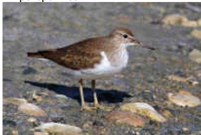
Common Sandpiper, Lady's Mile, 1 st May.