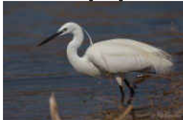
Little Egret, Asprokremmos Dam, 12 th May.