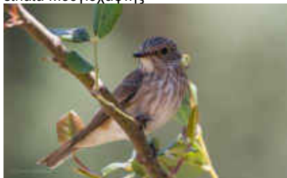
Spotted Flycatcher, Smygies, 14 th May.