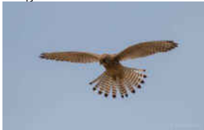
Common Kestrel, Anarita Park, 3 rd May.

Largest counts, ringing records and interesting reports: Ayioi Trimithias CBMS T123 7 4 adults and one nest with 3 young 9-May CP/PPa Dromolaxia, Aradippou, Livadia, Larnaca M06 Atlas Square 6 15-May JS Frenaros 25 8-May AKe Ha Potami IBA survey area 6 inc 4 in a family group 18-May PBe/AG Polis Chrysochou 4 28-May BCBS