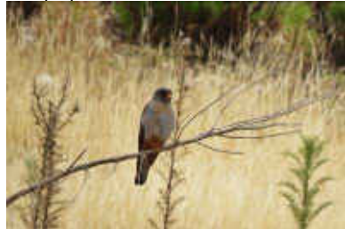
Red-footed Falcon, Anarita Park, 30 th May.

RED-FOOTED FALCON Falco vespertinus Μαυροφάλκονο