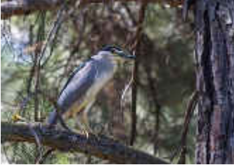
Black-crowned Night Heron, Paphos Forest, 7 th May.