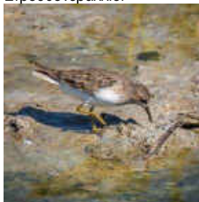
Temminck's Stint, Zakaki Marsh, 6 th May.