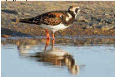
Ruddy Turnstone, Lady's Mile, 16 th May.