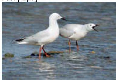
Slender-billed Gull, Lady's Mile, 1 st May.

SLENDER-BILLED GULL Larus genei Ροδόγλαρος