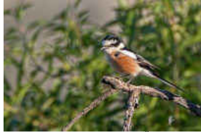
Masked Shrike, Anarita Park, 5 th May.

Agios Theodoros 2 13-May PBe/AG Agros, Ladoudera, Kato Mylos Atlas Square (H05) 10 24-May CP/PPa Akrotiri Salt Lake 1 Road from Sylvania's to Bishop's Pool 8-May PBe Filani 2 10-May FGe Finikaria (Germasogeia) to Kyparissa trail 1 singing 24-May PBe Frenaros 2 8-May AKE Kaminaria 2 5-May LAC Kannaviou, Paphos 3 5 & 7-May JS/DJW Kannaviou Dam area 1 9 & 15-May LAC/DJW Kathikas 2 6-May TRe Kionia 2 3-May MH Lythrodontas 12 17-May FGe Monashilakas Picnic Site 1 7-May DJW Monashilakas Picnic Site 2 9-May DJW Neo Chorio 1 2-May JS Omodos 1 maybe two 9-May JoB/PE Omodhos to Agios Nikolaos road vineyard area 2 11-May JN Pano Kivides - Pachna 10 x 10 km square 2 25-May JN Prastio Kellakidou 1 12-May JS Souni 2 4, 5m 13 & 22-May JN Souni 6 6-May JN Souni 5 8-May JN Souni 12 14-May JN Troodos IBA survey area 2 19-May PBe Vretsia to Galataria 1 9-May LAC Xyliatos Atlas Square H06 23 30-May CP/PPa