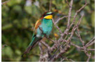
European Bee-eater, Mavrokolympos Dam, 14 th May.

129 records received of this species for May. Largest counts: Akhna Dam 40 25-May AKe Akrotiri 80 10-May JoB/PE Armou Hills 50 15-May CR Arodhes 40 Circling and flying over road from Droushia to Arodhes 5-May JS Goudhi 50 Sudden appearance of c50 over river 15-May RAT Konia 103 pre-roost on wires across hillside 13-May CR Old Kivides village fire trail area 52 15-May JN Phassouri Reed Beds 50+ 20-May AG Theletra Gorge 40 15-May CR Vretsia to Galataria 43+ 9-May LAC