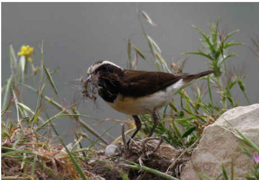
A female Cyprus Wheatear.

The Akamas area is one of the top five breeding sites on Cyprus for the Black-headed and Cretzschmar's Bunting and the European Roller and one of the top ten for the Masked Shrike. The endemic Cyprus Wheatear breed throughout the area as do Eurasian Scops Owl, Little Owl and European Nightjar. Birds of prey include Long-legged Buzzard, Bonelli's Eagle and Peregrine Falcon.