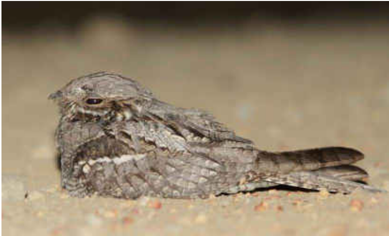
Above: European Nightjar. Below: European Roller.

Some sea watching from the coast around the Chrysochou Bay can start to turn up some interesting birds usually from mid-July onwards. As well as the expected migrating Glossy Ibis, which are usually the first to be seen, Mediterranean Gull, Scopoli's Shearwater and Eurasian Oystercatcher are among the species recorded there. If you are still around as dusk falls the area around Smygies is also a good place to hear and even see European Nightjar and to listen to the call of the Scop's Owl – our endemic sub-species - which can still be calling into the summer.