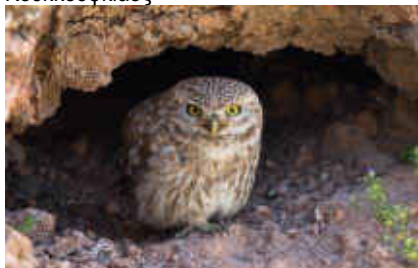
Little Owl, Agia Varvara, 5 th May.