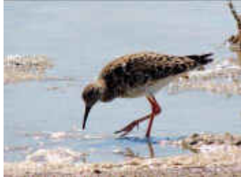
Ruff, Spiros Pool, 15 th May.