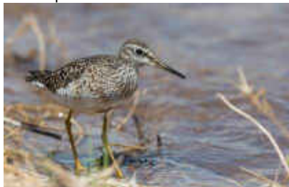
Wood Sandpiper, Asprokremmos Dam, 12 th May.

After 140 records received for this species in April, 107 were received for May. Largest counts and ringing records below: