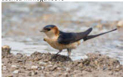
Red-rumped Swallow, Nata, 11 th May.