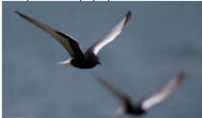
White-winged Tern, Asprokremmos Dam, 12 th May.