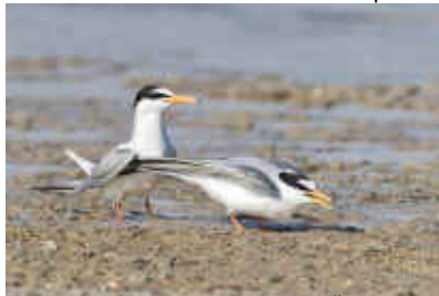
Little Tern, Larnaca Salt Lake, 12 th May.