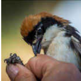
Woodchat Shrike, Neochorio ringing demo , 2 nd May.

Agia Varvara 1 3-May DJW Akamas 2 9-May PBe/AG Akrotiri 3 10-May JoB/PE Akrotiri Gravel Pits 1 2, 5, 11, 12 & 21-May TRe/PBe/AG/JS Akrotiri Gravel Pits 2 3 & 10-May PBe Akrotiri Salt Lake 1 Road from Sylvania's to Bishop's Pool 8-May PBe Anarita Park 1 11-May LAC Arodhes 1 5-May JS Aspro Dam, Finikas end 1 1-May LAC Cape Greco Pines 2 8-May ME Cape Greco 3 One singing 9-May JS Karpas Peninsular 1 9-May ADT Kato Paphos 1 5 & 6-May AWM Lady's Mile 1 8-May TRe Mandria 1 fem - runt looking 20-May CR Neo Chorio area 1 2-May LAC Neo Chorio to Ineia track 2 2-May LAC Neo Horio 1 2-May BCBS Phassouri Reed Beds 1 12-May JS Spiros Pool 1 10-May JS Tala, Paphos 1 22-May DJW