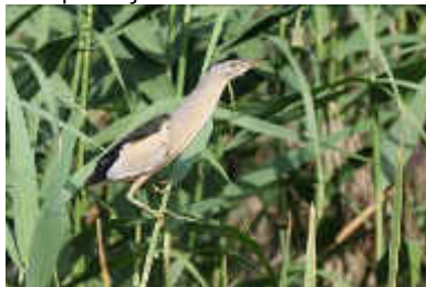
Little Bittern, Phassouri Reed Beds, 9 th May.

Agia Varvara 2 m,f 31-May CR Akhna Dam 1 4-May AKe Akhna Dam 2 6-May RAT Akrotiri 1 9-May JoB/PE Akrotiri Salt Lake 1 male. Road from Sylvana's to Bishop's Pool 8-May PBe Aspro Dam 1 11 & 19-May LAC Ezousas River (Acheleia) 1 11-May DJW Finikaria 1 15-May ADT Lymbia Dam 1 18-May MH Paralimni Lake 1 15-May FGe Phassouri Reed Beds 1 female 2-May TRE Phassouri Reed Beds 1 male 4 & 8-May TRE Phassouri Reed-beds 2+ 1 male, 1 female + 6-May SC with A P Leventis Phassouri Reed Beds 6 One carrying food 7-May JoB/PE Phassouri Reed-beds 4+ 3 males, 1 female + 9-May SC Phassouri Reed-beds 3 1 male, 2 females 16-May SC Phassouri Reed-beds 2 pair chasing, breeding? 18-May CR Phassouri Reed Beds 5 25-May PBe Phassouri Reed-beds 3 2m, 1f. Different locations, one disturbed from reeds, other distant flying over reeds. Surely X pairs breeding? 29-May CR Polis Reedbeds 2 5-May BCRS Polis Reedbeds 1 21-May BCRS