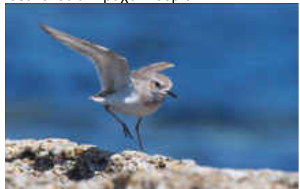
Greater Sand Plover, Agia Thekla, 15 th May.

GREATER SAND PLOVER Charadrius leschenaultii Βραχοπλουμιδι