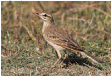
Tawny Pipit, Akhna Dam, 15 th May.

Akhna Dam 1 15-May FGe Akrotiri 1 5-May JoB/PE Akrotiri Gravel Pits 1 1-May FGe Akrotiri Gravel Pits 4 2-May SC Lower Xeros Potamos 1 14-May CR Mandria 4 3-May ADT