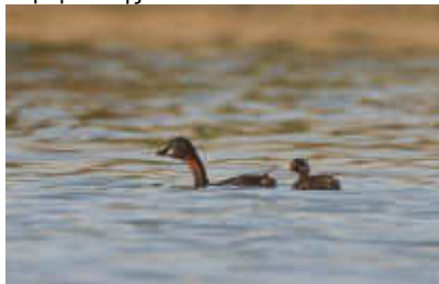
Little Grebe adult and juvenile, Potamia, 17 th May.