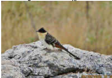
Great Spotted Cuckoo, Anarita Park, 30 th May.