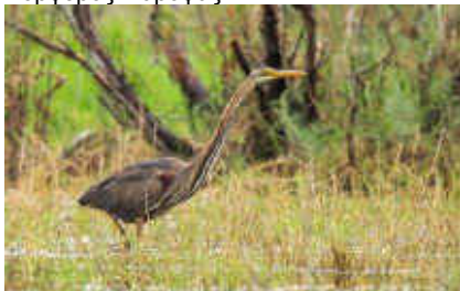
Purple Heron, Germasogeia Dam, 22 nd May.

PURPLE HERON Ardea purpurea Πορφυρός Ψαροφάς