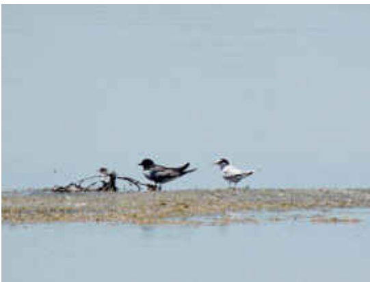
One of the White-winged Tern and a Little Tern seen by the group.

The total number of species seen during the course of the day was around 43.