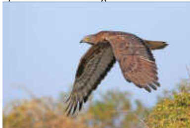
Pernis sp, Akrotiri Gravel Pits, 16 th May.