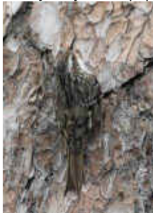
Short-toed Treecreeper, Troodos Square, 9 th May.

Agios Theodoros 2 13-May PBe/AG Kelafos - Mylikouri track 1 h 27-May CR Troodos IBA survey area 14 19-May PBe Troodos Visitor Centre 2 9-May FGe