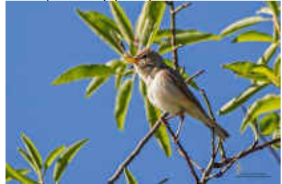
Eastern Olivaceous Warbler, 1 st May.