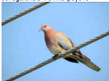
Laughing Dove, Ayia Napa Sewage Works, 9 th May.

Ayia Napa Football Pitches Housing Estate 2 8-May ME Ayia Napa Sewage Works 2 Pair on wires near house close to main road 9-May JS New Limassol Harbour 1 6-May SC with A P Leventis