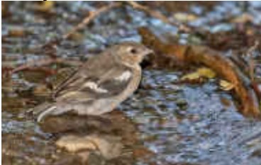
Common Chaffinch fledgling, Livadhi tou Pashia, 11 th July.

Agios Theodoros Agrou 10 14-Jun CP/PPa Akhna Dam 1 seen & heard 27-Jul AKe Artemis Trail (Mt. Olympus) c25 mostly juveniles 16-Jul FGe Halevka 6 29-Jul JWe Kampos - Tsakistra 10km survey area 10 6-Jun PBe Kionia c10 All appeared to be juveniles 10-Jul JS Livadi tou Pashia c40 mostly juveniles 11 & 16-Jul FGe Louvaras - Kalo Chorio 10km survey area 1 1-Jul PBe Louvaras Forest 1 14-Jun CP/PPa Machairas Forest IBA 2 4-Jul FGe