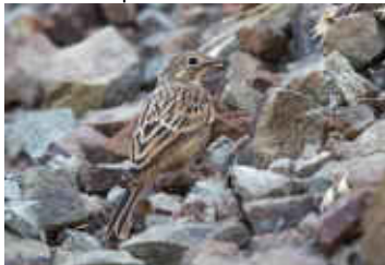
Cretzschmar's Bunting juvenile, Kannaviou Dam, 16 th June.

Akrounda 3 inc 1 juv 1-Jul PBe Androlikou 1 18-Jun DJW Androlikou 4 Recently fledged juveniles 20-Jun PSa Evretou Dam 1 15-Jul CK Kampos - Tsakistra 10km survey area 8 6- Jun PBe Kannaviou Dam 1 Juv 16-Jun DJW Limnatis - Moniatis 10km survey area 4 27-Jun PBe Louvaras Forest 1 14-Jun CP/PPa Machairas Forest IBA 15 4-Jul FGe Malia 2 30-Jun PBe Mandra tou Kampiou 4 4-Jul FGe Mosfiloti c4 1 seen, c3 heard only 27-Jun SC Mosfiloti, Pipis Forest c6 27-Jun SC Omodos to Agios Nikolaos road 2 20-Jun JS Panagia Stazousa SPA 2 Seen in flight. 19-Jun JS Pera 6 9-Jul NM Phinikas 1 25-Jun DJW Polis-reedbeds 1 5-Jun BCRS Polystypos 2 13-Jun FGe Pyrga 2 19-Jun JS Pyrga 1 Female 24-Jun JS Souni 1 1-Jun & 6-Jul JN Stavros tis Psokas 10km survey area 2 5- Jun PBe Vavatsinia 1 Juvenile 10-Jul JS Vyzakia 1 24-Jul FGe