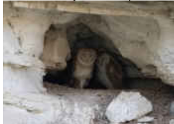
Barn Owl at nest, Politiko, 4 th July.

Asinou Church 1 26-Jul MH Chrisospilliotisa 1 Flushed from cave roost 3 & 20-Jun PSA Chrysochou 1 Adult roosting in abandoned building 6-Jun PSA Episkopi, Paphos 1+ Adult feeding two hissing chicks in trees at bottom of cliff 3-Jul JStA Parakklesia 2 disturbed in shed; no obvious signs of breeding 5-Jun MGR Pera Orinis 1 12-Jul MH Politiko 2+ young in nest cavity 4-Jul FGe Theletra Gorge 1 Nest cavity in bridge over gorge. At least 1 chick present viewed from road above 19-Jun PSA