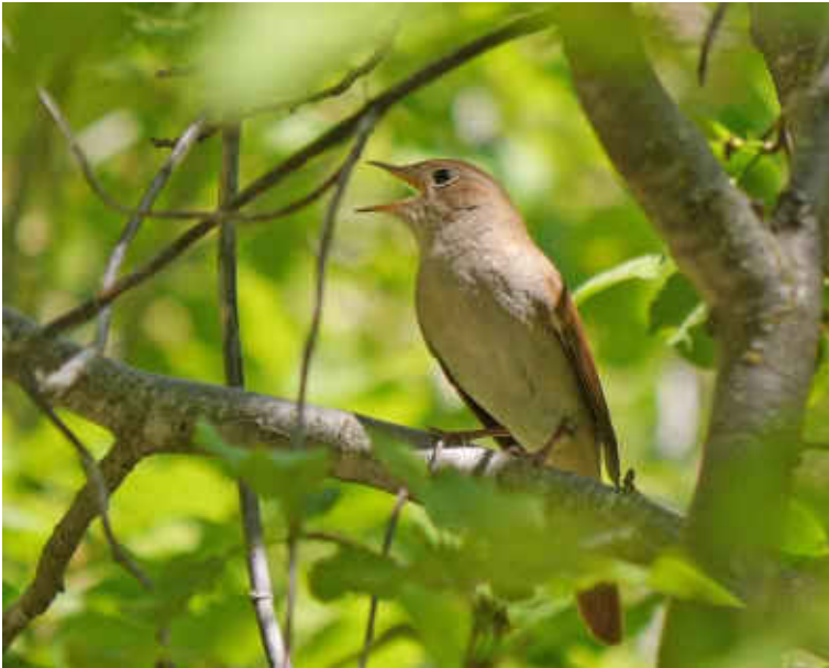
Singing Common Nightingale

The Greek poet George Sopheris wrote in 1967, when he stayed in Platres, that he was unable to sleep because the singing of the Nightingales kept him awake. When we first moved to Platres in 1991 we could hear several Common Nightingales singing in the forest below our house which is on Odos Aeodonion (Nightingale Road). Last year there was a single male singing; this year there were none!