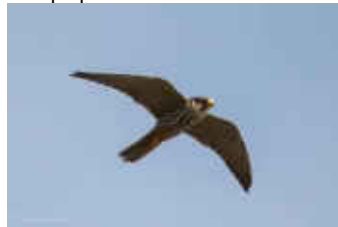
Eurasian Hobby, Tala, 12 th June.

Androlikou 1 5-Jun PSa Androlikou 2 19-Jun HSt Evretou Dam 1 15-Jul CK Kamares (Tala) 2 8, 10, 11, 12, 13, 14, 19, 20, 25 & 29-Jun & 2, 5, 6, 7 & 8-Jul DJW Kamares (Tala) 1 10, 23 & 25-Jun & 3, 4, 9, 23 & 31-Jul DJW