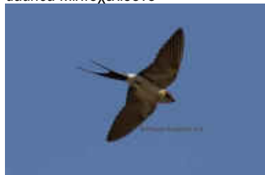
Red-rumped Swallow, Vyzakia, 11 th July.

Largest counts and ringing records: Amiantos area c15+ 1-Jun SC Limnatis - Moniatis 10km survey area 11 2 parties inc fledged birds 27-Jun PBe Omodos to Agios Nikolaos road 10 17-Jul JS Pano Amiantos 8 16-Jul FGe Polis Reedbeds 1 22-Jun BCRS Salamiou - Malia 10km survey area 13 30-Jun PBe Troodos 1 7-Jul BCRS