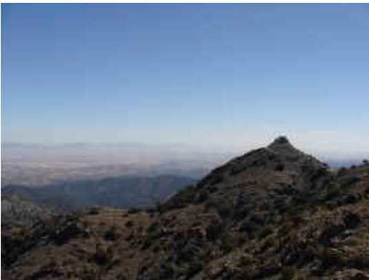
Left: Chandria Trail, Madari

Despite feeling a tad chilly in the square with just a fleece that morning and contemplating a thick mist hanging beneath the trees that obscured the flight of a crossbill passing overhead, Troodos was a place I quickly began to love; a realm of raptors, forest birds and stunning vistas that I returned to again and again during my stay. The subject of many of these visits was a small, streaky-brown bird whose distribution in Cyprus is turned rather upside down from those I know in the UK. A specialist of lowland heathland habitats there, on Cyprus it is transported to remote forested mountainsides and ridges in the breeding season, a habitat to suit its generally low-key nature. Efforts to survey this bird often took me off the beaten track, down valleys, up hills and though often tiring, every step was worth it to hear the sweet, descending song of a Woodlark somewhere off in the distance. It is a song of a remarkable, understated qualities.