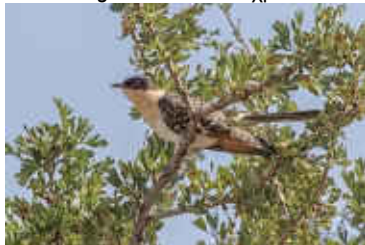
Great Spotted Cuckoo juvenile, Anarita Park, 2 nd June.

Agios Sozomenos 1 Juvenile begging from Magpie 22-Jun JS/DRh Anarita Park 1 2-Jun AST Androlikou 1 Juv 18-Jun DJW Athalassa Park 1 1 & 13Jun DRh/SC Chrisospilliotisa 1 26-Jun PSA Drinia 2 Fresh juveniles 9-Jun PSA Episkopi 2 Juv 12-Jun DJW Evretou Dam 1 juvenile 23-Jun HSt Kivisili 2 Two juveniles together on a wire with Magpie 12-Jun JS Limnatis 1 juvenile 27-Jun PBe Malia 1 juvenile 30-Jun PBe Mazotos 2 juveniles. Between Mazotos and Alaminos 12-Jun JS Panagia Stazousa SPA 1 19 & 24-Jun JS Pegeia - Ineia 10km survey area 8 inc one juvenile near Kathikas and 2 adults near Ineia 11-Jun PBe Pera Orinis 1 29-Jun MH Peristerona 1 juvenile 20-Jun HSt Pyrga 2 Juveniles 19-Jun JS Souni 2 1, 3 & 10-Jun & 2 & 10-Jul JN