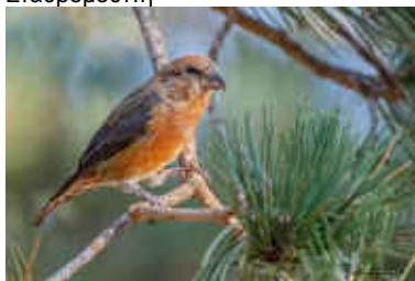
Red Crossbill, Mount Olympus, 11 th July.

Artemis Trail (Mt. Olympus) 7 16-Jul FGe Livadi tou Pashia 4 11-Jul FGe Mount Olympus c15 11-Jul AST Mount Olympus 3 14-Jul CK