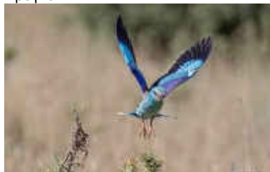
European Roller, Anarita Park, 2 nd June.