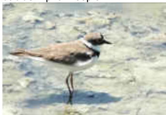
Little Ringed Plover, Oroklini Marsh, 15 th July.