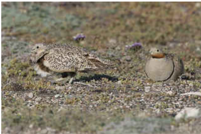
A pair of

BLACK-BELLIED SANDGROUSE Pterocles orientalis Πουρτάλλα: Up to four birds were reported regularly at Akrotiri Gravel Pits between 1 st March and 2 nd May.