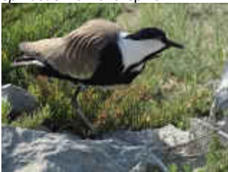
Spur-winged Lapwing, Zakaki Marsh, 27 th July.

SPUR-WINGED LAPWING Vanellus spinosus Πελλοκατερίνα