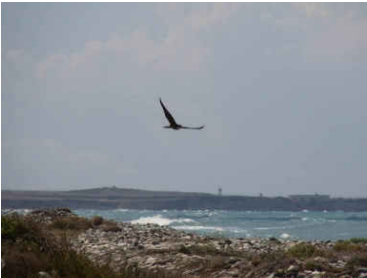
Above: Kidasi in the spring. Below: Eleonora's Falcon, Akrotiri coast.