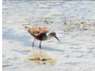
Ruff, Oroklini Marsh, 22 nd July.

Oroklini Marsh 3 One juvenile and two still with some neck feathers of breeding plumage 15-Jul JS Oroklini Marsh 2 20-Jul JS Oroklini Marsh 5 22-Jul JS Spiro's Pool 2 14-Jun JS