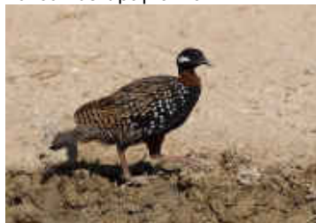
Black Francolin, Anthoupolis, Nicosia, 25 th July.

Largest counts: Athalassa c5 1 male, 1 female seen, c3 heard only 13-Jun SC Kiti, Perivolias, Meneou M05 Survey Square 10 8 males calling and 1m and 1f seen 10-Jun JS Mazotos, Kivisilli, Mennogeia, Alaminos L05 Atlas Square 5 Four heard calling. One seen 12-Jun JS Pegeia - Ineia 10km survey area 8 11-Jun PBe