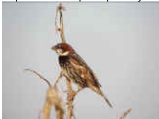
Spanish Sparrow, Agios Sozomenos, 22 nd June.

Agios Sozomenos 1 Male 22-Jun JS/DRh Agios Theodoros Agrou 54 14-Jun CP/PPa Episkopi - Paramali 10km survey area 4+ around Paramali 24-Jun PBe Kampos - Tsakistra 10km survey area 2+ At least two males at Kampos, 1 with food , probably more in noisy House Sparrow colonies 6-Jun PBe Kiti, Perivolias, Meneou M05 Survey Square 24 Incs several juveniles 10-Jun JS Makedonitissa Fields 1 immature male 29-Jul SC Mosfiloti, Pipis Forest c4 27-Jun SC Omodhos to Agios Nikolaos road vineyard area 1 male 18-Jul JN