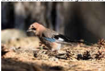
Eurasian Jay, Troodos, 16 th July.

Agios Theodoros Agrou 2 14-Jun CP/PPa Almirolivado 2 16-Jul FGE Artemis Trail (Mt. Olympus) 4 16-Jul FGE Atalante Trail, Troodos 1 around Troodos Square 4-Jul PBe Chandria (Madari Trail) 2+ inc one mobbing a perched Long-legged Buzzard 4-Jul PBe Kampos - Tsakistra 10km survey area 7 6-Jun PBe Kionia 3 10-Jul JS Livadi tou Pashia 2 11-Jul FGE Louvaras - Kalo Chorio 10km survey area 5 in a group with at least one juv 1-Jul PBe Louvaras Forest 1 14-Jun CP/PPa Machairas Forest IBA 3 4-Jul FGE Mylikouri trail 4 heard calling (possibly juveniles or family party) 11-Jul JN Mylikouri trail 5 3 seen together were probably juveniles, other 2 heard calling 18-Jul JN Pedoulas - Pano Platres 10km survey area 20 all in post-breeding family groups of 4-5 15-Jul PBe Persephone Trail, Troodos 6 25-Jul JN Platania Picnic Site 1+ 1-Jun SC Stavros tis Psokas 10km survey area 6 including at least one fledged bird begging 5-Jun PBe Troodos Square 1 1-Jun SC