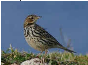
Red-throated Pipit, Paphos Headland, 1 st February.