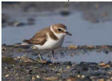
Kentish Plover, Lady's Mile, 5 th February.