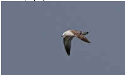
Common Gull, Larnaca Sewage Works, 5 th February.

Famagusta Fresh water Lake 1 1st Winter 26-Jan NCP