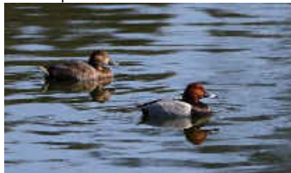
Common Pochard, Bishop's Pool, 15 th January.