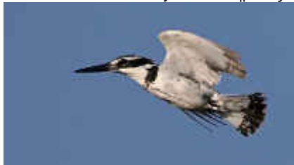
Pied Kingfisher, Lady's Mile, 16 th February.

Lady's Mile/Zakaki Marsh 1 1, 3, 7, 11, 13, 16 & 24-Feb AWH/KSa/TRe/KH/DJW/IKB/WAS/JN/DBu