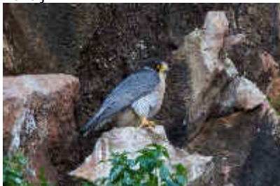
Peregrine Falcon, Episkopi, 13 th February.