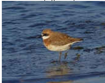
Greater Sand Plover, Paphos Headland, 26 th February.