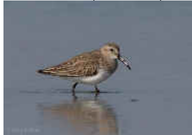
Dunlin, Lady's Mile, 5 th February.