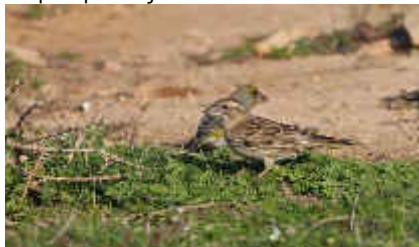
Rock Sparrow, Cape Greco, 2 nd February.