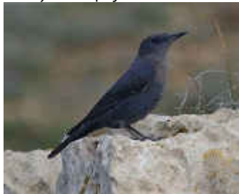
Blue Rock Thrush, Tomb of the Kings, 17 th February.