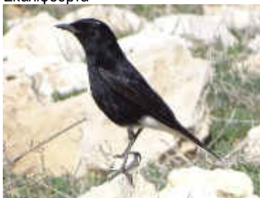
White-crowned Wheatear, Cape Greco, 24 th February.

Oenanthe leucopyga Λευκόπυγη Σκαλιφούρτα