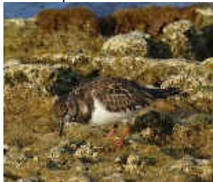
Ruddy Turnstone, Paphos Headland, 26 th February.

RUDDY TURNSTONE Arenaria interpres Χαλικονεραλλίδι