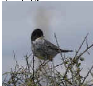
Cyprus Warbler, Anarita Mast, 5 th February.