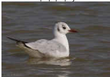
Common Black-headed Gull, Lady's Mile, 5 th February.