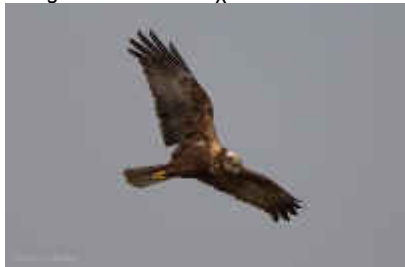
Western Marsh Harrier, Zakaki Marsh, 5 th February.