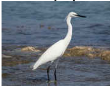
Little Egret, Larnaca Airport Coast, 28 th February.