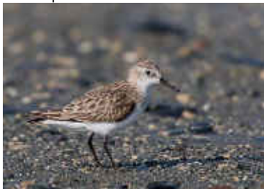
Little Stint, Lady's Mile, 5 th February.

Agia Thekla 3 21-Feb FGe Akrotiri Salt Lake 3 12-Feb KH Leivadia JUMBO drain 2 10-Feb MGr Lady's Mile 14 5-Feb DJW Lady's Mile 38 15-Feb JStA Lady's Mile c80 19-Feb KH Lady's Mile 5 26-Feb ADT Lady's Mile 16 27-Feb JN Larnaca Salt Lake 15 Tekke area 5-Feb KH Larnaca Salt Lake Northshore 2 10-Feb MGr