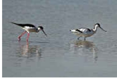
Pied Avocet with a Black-winged Stilt, Lady's Mile 15 th February.

PIED AVOCET Recurvirostra avosetta Αβοκέτα