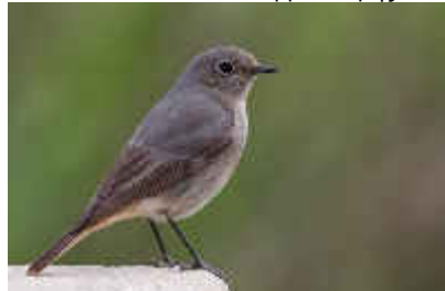
Western Black Redstart, Paphos Headland, 12 th February.

WESTERN BLACK REDSTART Phoenicurus ochrurus Καρβουνιάρης