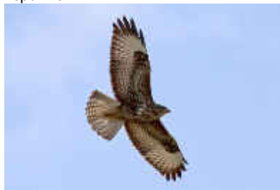
Common Buzzard, Akrotiri, 25 th February.