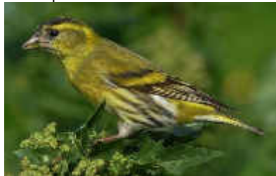
Eurasian Siskin, Paphos Headland, 12 th February.