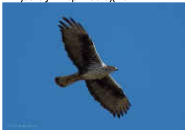
Bonelli's Eagle, Arodes, 29 th February.