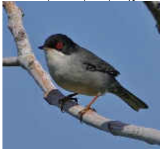
Sardinian Warbler, Mandria.

Largest counts and interesting and ringing records: