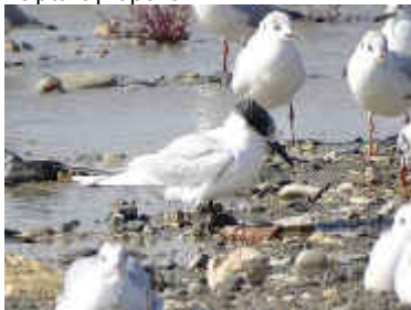
Sandwich Tern, Lady's Mile, 4 th February.

Lady's Mile 2 4-Feb TRe Lady's Mile 1 21-Feb KH Oroklini Coast 1 1 & 9-Feb BB/STi Oroklini Beach 4 2-Feb STi Oroklini Coast 3 25-Feb BB Spiros Beach 2 7-Feb JS Zakaki Marsh 1 5-Feb JN