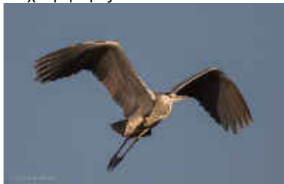
Grey Heron, Zakaki Marsh, 5 th February.