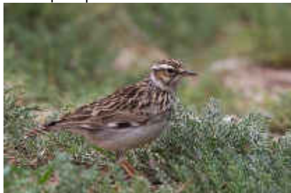
Woodlark, Paphos Headland, 19 th February.