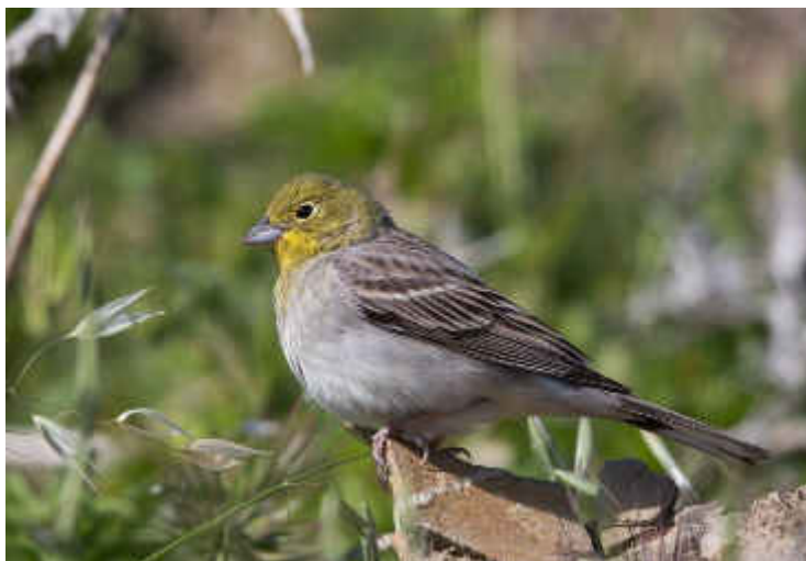
Above: A Male Cinereous Bunting photographed by Dave Walker at Mavrokolympos Dam in 2015.

As a result of its moderately small population the Cinereous Bunting is classified as Near Threatened on the IUCN Red List. It is suspected to be declining as a result of degradation of its habitats. It breeds on dry stony slopes with low vegetation, maquis and scattered trees.