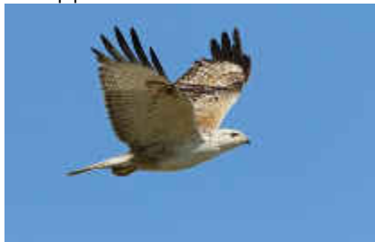
Long-legged Buzzard, Cape Greco, 2 nd February.