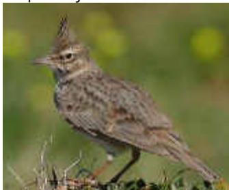
Crested Lark, Paphos Headland, 16 th February.