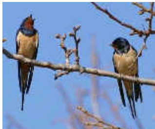
Barn Swallow, Paphos Headland, 23 rd February.