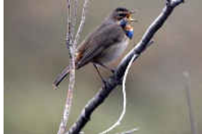
Bluethroat, Lady's Mile, 11 th February.

BLUETHROAT Luscinia svecica Γαλαζολαίμης