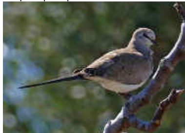
Namaqua Dove, Mandria, 22 nd February.

NAMAQUA DOVE Oena capensis Μικροπερίστερο