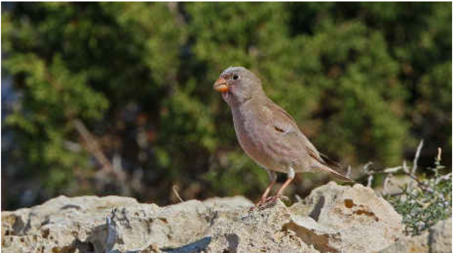
Photographs: Above: Pied Kingfisher, Zakaki Marsh. Below: Trumpeter Finch, Cape Greco.