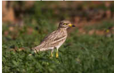
Eurasian Stone Curlew, Mandria, 5 th February.

EURASIAN STONE-CURLEW Burhinus oedicnemus Τρουλλουριά