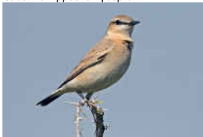
Isabelline Wheatear, Akrotiri, 28 th February.