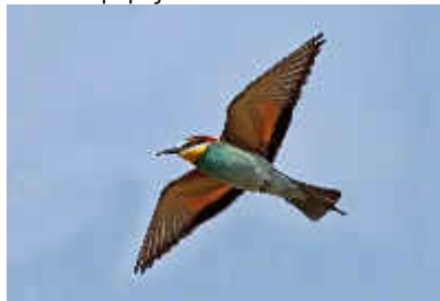
European Bee-eater, Akrotiri, 6 th May.

Largest counts – 99 records received this month: