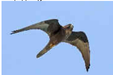
Eleonora's Falcon, Kensington Cliffs, 17 th May.

Akrotiri Gravel Pits 1 6-May AGr Akrotiri Salt Lake 2 Zakaki run off 9-May AGr Akrotiri Salt Lake 1 11 & 14-May AGr/JN Akrotiri village 12 feeding together late in day 7-May AGr Anarita Park 1 6-May JS Anarita Park 2 9-May STi Arodhes 1 High over area 26-May JS Bishop's Pool 2 hunting 14-May JN Erimi 2 hunting hirundines 31-May JN Karpas Peninsula 5 28-May JS Kensington Cliffs 2 5 & 11-May RAT/SMM Kensington Cliffs 20+ 8-May AGr Kensington Cliffs 3 9 & 17-May LAC/JE Kensington Cliffs 12 probably more 14-May JN Kensington Cliffs 4 23-May JE Lady's Mile 2 8-May AGr Mandria 1 in flight 28-May JN Panayia, Agios Therapon 1 in flight 19-May JN Pano Kivides - Pachna 10 x 10 km square 4 light morph chasing Common Swifts and others were dark morphs, all hunting 29-May JN Paramali 2 light one chasing a female Roller and dark one eating insects in flight 30-May JN Petra tou Romiou 3 7-May JS Petra tou Romiou 2 21 & 26-May DJW/JS Phasouri Reed beds 2 7 & 11-May AGr Phasouri Reed beds 3 9-May AGr Pissouri 1 26-May JS Souni 1 hunting finches over ridge 11-May JN Troodos 2 Possibly up to five. Seen at several points around the walk 20-May RAT Tunnel Beach 6+ late morning 11-May AGr