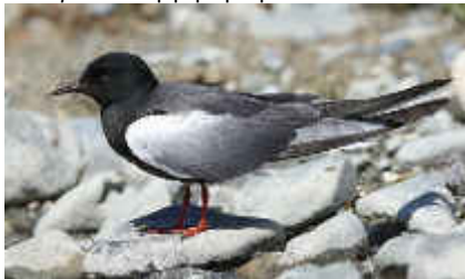
White-winged Tern, Germasogeia area, 8 th May.