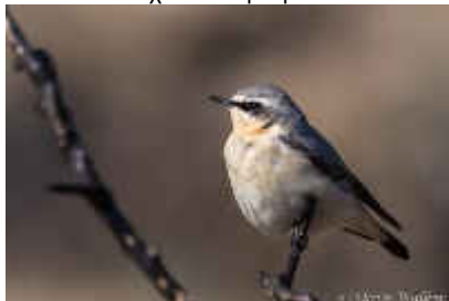
Northern Wheatear, Mavrokolympos Dam, 10 th May.

Lady's Mile 1 13-May TRe Latchi 1 female 1-May STi Mandria 1 11-May LAC Mavrokolymbos Dam 1 10-May DJW Phasouri Reed beds 1 2-May AGR