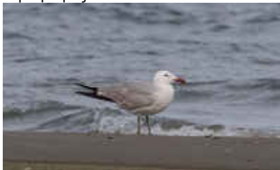
Audouin's Gull, Spiros Beach, 17 th May.