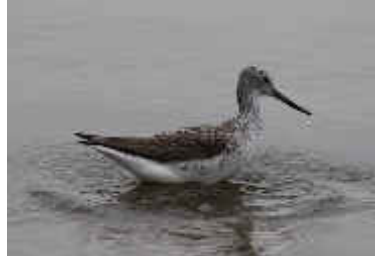
Common Greenshank, Akrotiri Gravel Pits, 3 rd May.

Akhna Dam 2 7-May BB Akrotiri Gravel Pits 2 3-May TR Meneou Pool 1 7 & 9-May FGe/JS Phasouri Reed beds 1 2-May AGr