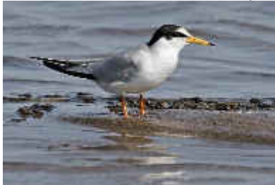
Little Tern, Akrotiri Gravel Pits, 9 th May.