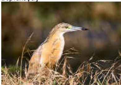
Squacco Heron, Agia Varvara, 22 nd May.

Largest counts and ringing record: Akhna Dam 6 3, 16 & 19-May AKe Fresh Water Lake South 7 at least three nests 27-May JS Phasouri Reed Beds 19 6.15 - 10.05 am 9-May AGr Polis Reedbeds 1 7-May BCRS Zakaki Marsh 5 5-May RAT