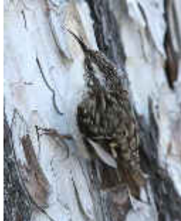
Short-toed Treecreeper, Troodos.

Artemis Trail, Troodos 2 31-May JS Caledonian Falls 2+ Troodos end of trail 31-May JS Kampos tou Livadiou 1 31-May JS Platania Picnic site 1+ 31-May JS