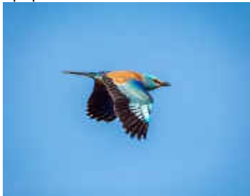
European Roller, Arodes, 8 th May.

Largest counts – 123 records received this month: Anogyra – Archimandrita 10km survey area 8 31-May JN Anarita Park to Episkopi road 6 Plus one road kill 11-May JS Androlikou 12 inc 3 pairs 19-May DJW Pano Kivides – Pachna 10 x 10 km square 26 29-May JN Phinikas 7 22-May DJW Pittokopos 7 17-May DJW Souni 8 11-May JN