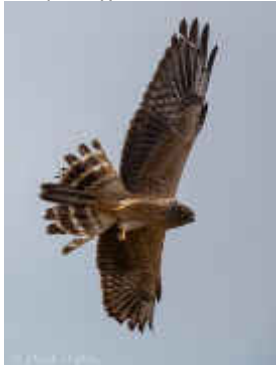
Pallid Harrier, Anarita Park, 8 th May.

PALLID HARRIER Circus macrourus Ασπροσιάχινο