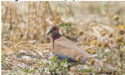
Laughing Dove, Aradippou, 20 th May.

Aradippou 4 7-May FGE Aradippou 20+ Inc one juvenile seen 20-May JS Kouklia 2 7 & 26-May JS Leivadia 2 20-May JS Mandria 3 inc a juvenile 1-May LAC Mandria 1 3, 7, 8 & 20-May LAC Mandria 2 4 & 9-May LAC Mandria 4 16-May LAC