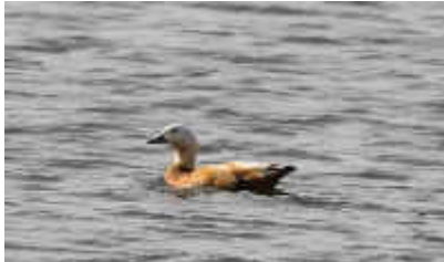
Ruddy Shelduck, Larnaca Sewage Works, 18 th May.

RUDDY SHELDUCK Tadorna ferruginea Καστανόπαπια