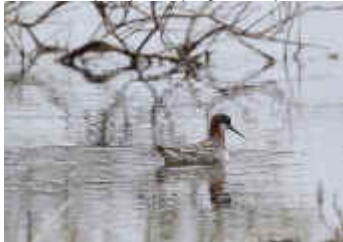
Red-necked Phalarope, Akrotiri Gravel Pits, 13 th May.