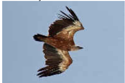
Eurasian Griffon Vulture, Kensington Cliffs, 19 th May.

EURASIAN GRIFFON VULTURE Gyps fulvus Γύπας