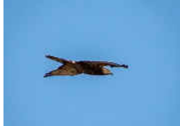
European Honey Buzzard, Droushia, 29 th May.

EUROPEAN HONEY BUZZARD Pernis apivorus Μελισσοσιάχινο