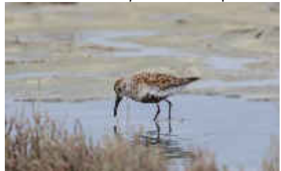
Dunlin, Lady's Mile, 15 th May.

Akhna Dam 1 16-May AKe/BB Akrotiri Gravel Pits 30+ evening 2-May AGr Akrotiri Pits 2 14-May JE Akrotiri Salt Lake 1 at least 14-May JN