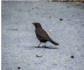
Eurasian Blackbird, Platres, 20 th May.

Amiandos Botanical Gardens 3+ 31-May JS Artemis Trail 1 Male 31-May JS Caledonian Falls 5 3m and 2 f seen. Others heard. Troodos end of trail 31-May JS Kionia 3 21-May FGe Livadi tou Pashia, Troodos 5+ 2m, 1f and 1 juv seen plus others heard 31-May JS Pano Platres 1 20-May RAT Platania Picnic site, Troodos 3+ A male and female seen plus at least one other singing 31-May JS Troodos Visitor Centre 1 31-May JS