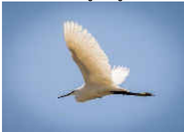
Little Egret, Zakaki Marsh, 21 st May.

Largest counts: Akhna Dam 15 7-May BB Akroiri Salt Lake 24 9-May LAC Cape Drepano, Avakas Gorge, Lara 10x10 AtlasSquare 12 migrating 12-May DJW Phasouri Reed Beds 10 11-May AGr