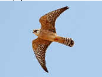
Red-footed Falcon, Anarita Park, 5 th May.

Akrotiri 1 12-May ABW Anarita Park 6 1-May LAC Anarita Park 3 2-May JE Anarita Park 5 3, 13 & 15-May ABW/JE/LAC Anarita Park 15 4-May LAC Anarita Park 30 5-May JE Anarita Park 20+ Two thirds of those seen were male 6-May JS Anarita Park c50 At least 30 feeding throughout area and c20 seen gaining height to N of area at 8.15 am. 7-May JS