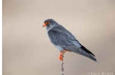
Amur Falcon, Anarita Park, 6 th May.

Anarita Park 1 1, 2, 3, 4, 5, 6, 7, 9 & 15-May LAC/JE/ABW/LAC/TRe/JS/DJW/STI (First record for Cyprus)