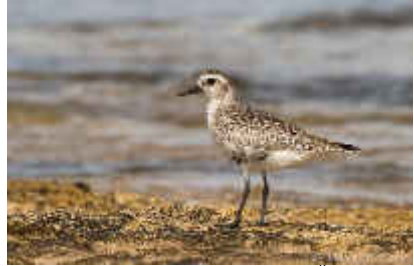
Grey Plover, Paphos Headland, 13 th May.