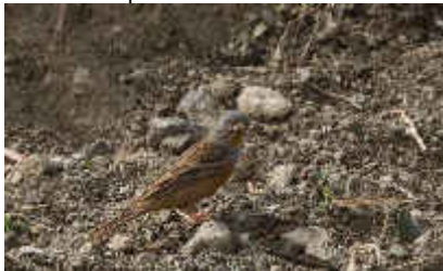
Cretzschmar's Bunting, Anarita Park, 5 th May.