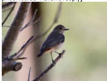
Common Redstart, Akrotiri Gravel Pits, 9 th May.

COMMON REDSTART Phoenicurus phoenicurus Κοτσινονούρης