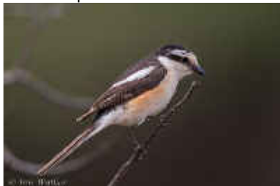
Masked Shrike, Smygies, 17 th May.