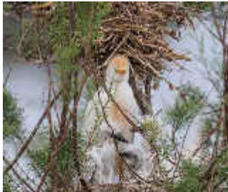
Cattle Egret and three young, Fresh Water Lake (South), 27 th May.

Largest counts: Akhna Dam 13 7-May AKe Fresh Water Lake South 200+ At least 75 nests many with young birds in them 27- May JS/MC/CC Oroklini Marsh 150+ 14-May AGr Vrysoulles 30 5-May AKe