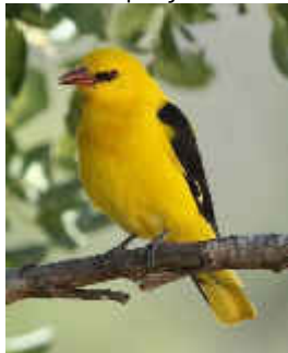
Eurasian Golden Oriole, Baths of Aphrodite, 7 th May.

Akhna Dam 1 10-May AKE Androlikou 6 2 & 17-May LDz Arodhes 2 Males 6-May JS Asprokremmos Dam 9 others also heard 2-May LAC Bishop's Pool 3 9-May ABW Ineia 2 17-May DC Kannaviou Dam 1 7-May DJW Kathikas 3 8-May ABW Kritou Terra 4+ several very vocal birds 1- May STi Lady's Mile 8 single flock in off sea and headed inland at midday 2-May AGr Neo Chorio 4 2m and 2f 3-May JS Nikokleia 2 7-May LAC