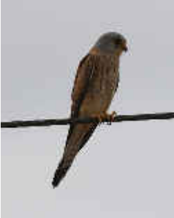
Lesser Kestrel, Anarita Park, 3 rd May.

Anarita Park 5 3-May ABW Anarita Park c20 5-May JS Anarita Park 2+ 6-May JS Anarita Park c1 One male present and possibly one female 7-May JS Anarita Park 1 Male 11 & 18-May JS/LAC Bishop's Pool 1 male 9-May LAC Kensington Cliffs 2 14-May JN