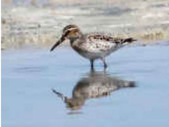
Broad-billed Sandpiper, Lady's Mile, 10 th May.

Akrotiri Salt Lake 2 14-May AGr Lady's Mile 2 10-May TR