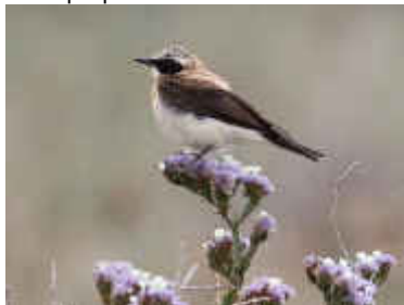
Eastern Black-eared Wheatear, Akrotiri Gravel Pits, 3 rd May.

Oenanthe melanoleuca Ισπανική Σκαλιφούρτα