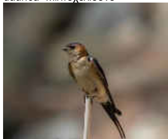
Red-rumped Swallow, Platania, 31 st May.