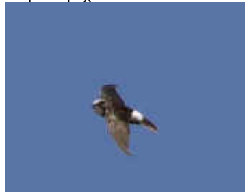
Little Swift, Akrotiri Gravel Pits, 16 th August.

LITTLE SWIFT Apus affinis Μικροπετροχελίδονο