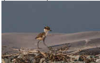
Spur-winged Lapwing chick, Larnaca Sewage Works, 9 th August.

Max count per location and interesting reports: