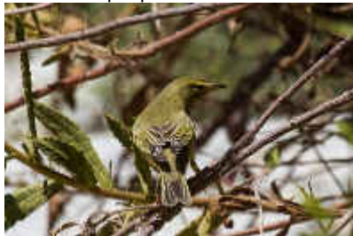
Willow Warbler, Mavrokolympos Dam, 21 st August.

WILLOW WARBLER Phylloscopus trochilus Θαμνογιαννούδι