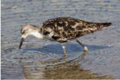
Ruff, Akrotiri Gravel Pits, 3 rd August.

Akhna Dam 1 3 & 6-Aug BB Akrotiri gravel Pits 1 1, 2, 3, 4, 5 & 27-Aug TRe Lady's Mile 1 22, 27 & 30-Aug DJW/JN/SC/APL Larnaca Sewage Works 4 2-Aug JS Larnaca Sewage Works 6 7-Aug JS Larnaca Sewage Works 1 9-Aug JS Larnaca Sewage Works 2 11-Aug JS Larnaca Sewage Works 8 13-Aug JS Larnaca Sewage Works 7 16-Aug JS Larnaca Sewage Works 5 31-Aug JS