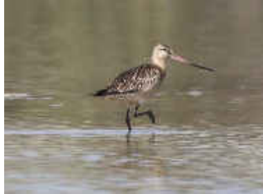
Bar-tailed Godwit, Akrotiri Gravel Pits, 8 th August.