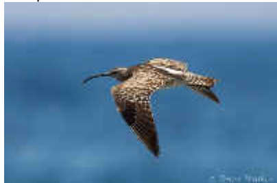
Whimbrel, Paphos Headland, 12 th August.