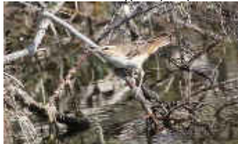
Sedge Warbler, Akrotiri Gravel Pits, 16 th August.

Akrotiri Gravel Pits 1 16-Aug TRe Akrotiri Salt Lake 1 feeding and perched 25-Aug JN