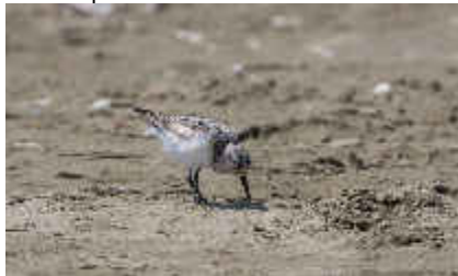
Sanderling, Spiros Beach, 13 th August.

Lady's Mile 1 27 & 30-Aug JN/TRe Lady's Mile 2 31-Aug TRe Larnaca Sewage Works 1 2 & 15-Aug JS Spiros Beach 1 2, 13 & 20-Aug JS/FGe