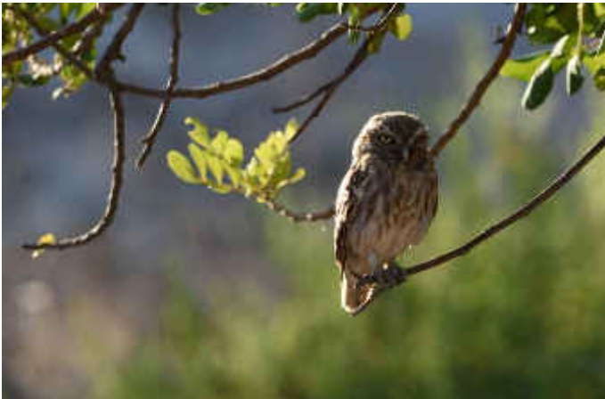
Little Owl, Arodes photographed by Dinos Konis.

The next morning a group of five enthusiastic birders met at 6.30 am outside the hotel and headed off to the valley behind the nearby village of Arodes for some early morning bird watching. The first bird found was a Woodchat Shrike , followed by the first of at least twenty juvenile Red-backed Shrike , with only one attractive male bird seen. Several Willow Warbler were flitting around in the trackside vegetation and at least twelve Sardinian Warbler , four Whinchat and four Cyprus Wheatear were seen. A flock of 30 Chukar flew in front of us and then we spotted a Little Owl on the lower branches of a roadside tree. While Dinos took many photos of the Little Owl, a Cretzschmar's Bunting flew off but it couldn't be found again.