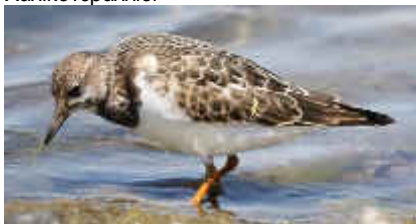
Ruddy Turnstone, Akrotiri Gravel Pits, 23 rd August.

Akrotiri Gravel Pits 1 23, 29 & 30-Aug TRe/FGe