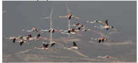
Greater Flamingo, Larnaca Sewage Works, 16 th August.

Akrotiri 18 0840-0846 in flight S of base circling bay then to NW and then SE then NW very high 31-Aug JS/JN Larnaca Sewage Works 7 2, 7 & 9-Aug JS Larnaca Sewage Works 4 11 & 15-Aug JS Larnaca Sewage Works 5 adults 13-Aug JN Larnaca Sewage Works 27 23 flew in off sea, over Spiros Pool and joined four already on Sewage Pools 16-Aug JS Larnaca Sewage Works c20 31-Aug JS