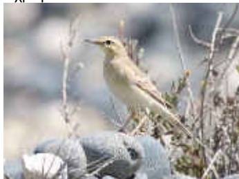
Tawny Pipit, Akrotiri Gravel Pits, 31 st August.