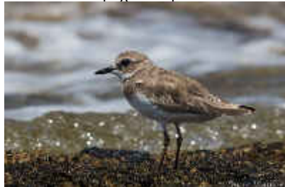
Greater Sand Plover, Paphos Headland, 12 th August.

Agia Trias 4 20-Aug SSk Paphos Headland 3 1 & 12-Aug JS/DJW Paphos Headland 4 3 & 28-Aug JS/DJW