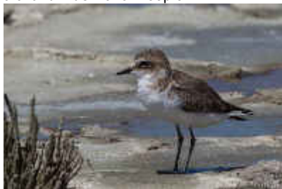
Kentish Plover, Lady's Mile, 22 nd August.