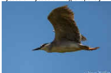
Black-crowned Night Heron, Asprokremmos Dam, 8 th August.

Agios Theodoros 16 Heading S towards sea 7.10pm 31-Aug JS