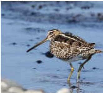
Common Snipe, Akrotiri Gravel Pits, 8 th August.

Akhna Dam 2 24-Aug BB Akrotiri Gravel Pits 1 8-Aug TRe Lady's Mile 2 25-Aug NK/GF