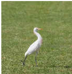
Cattle Egret, Agia Napa Football Fields, 12 th August.