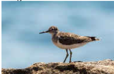
Common Sandpiper, Paphos Headland, 28 th August.