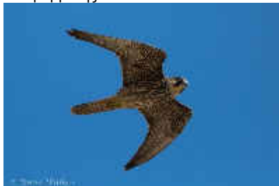
Eleonora's Falcon, Kensington Cliffs, 22 nd August.