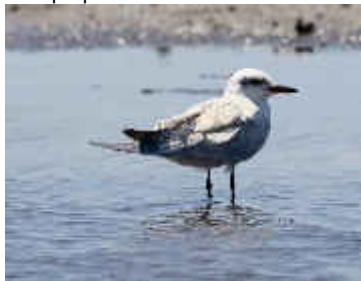
Gull-billed Tern, Akrotiri Gravel Pits, 1 st August.

Akhna Dam 1 1-Aug FGe Akrotiri Gravel Pits 1 11-Aug TRe Larnaca Sewage Works 1 probable flying W over bund of W pool, away from the hide 13-Aug JN Mandria, Paphos 1 31-Aug DJW