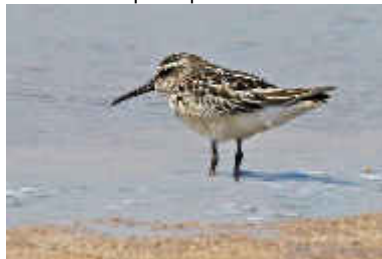
Broad-billed Sandpiper, Lady's Mile 26 th August.