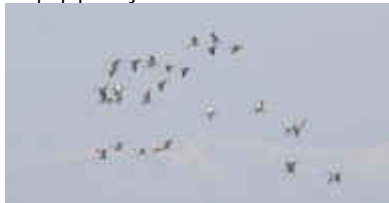
Demoiselle Crane, Akrotiri Salt Lake, 30 th August.

Akrotiri Salt Lake 100+ very distant dark 'blobs' on far E shore of salt lake but too hazy to be certain until they took flight - seen from Agios Georgios Church on the