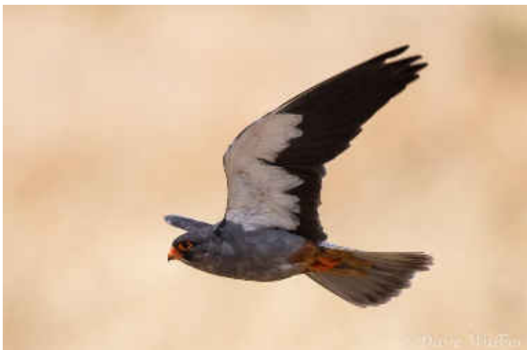
Cyprus' first Amur Falcon photographed at Anarita Park on 6 th May.

AMUR FALCON Falco amurensis Ασιατικό Μαυροκίρκινέζο: The first record of this species was seen at Anarita Park on 28-Apr and remained in the area until 15-May