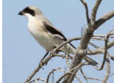
Lesser Grey Shrike, Akrotiri Gravel Pits, 17 th August.

LESSER GREY SHRIKE Lanius minor Σταχτοκεφαλάς