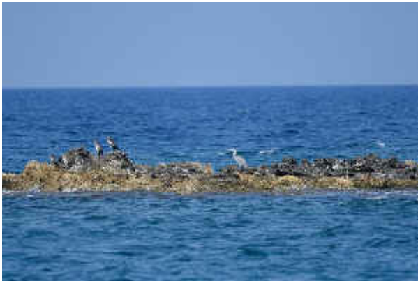
Above: Little and Cattle Egret on the Akamas Coast Below: European Shag and a migrating Grey Heron