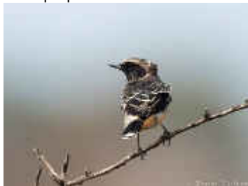
Cyprus Wheatear, Mavrokolympos Dam, 10 th August.