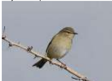
Common Chiffchaff, Agios Sozomenos, 24 th November.