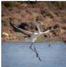
Greater Flamingo, Lady's Mile, 30 th November.