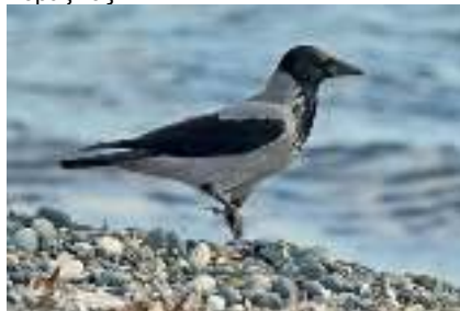
Hooded Crow, Zakaki, 24 th November.