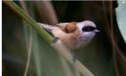
Eurasian Penduline Tit, Zakaki Marsh, 29 th November.