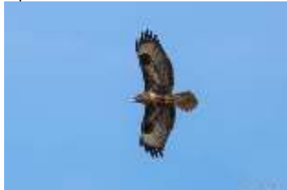
Eurasian Buzzard, Timi Beach, 26 th November.