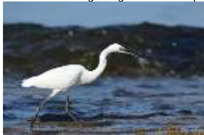
Little Egret, Paphos Headland.