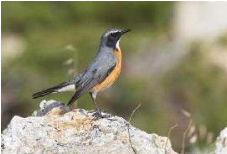
White-throated Robin, Cape Greco 22 nd April.

WHITE-THROATED ROBIN Irania gutturalis : One was briefly at Cape Greco 22 nd Apr. The 20 th Cyprus record.