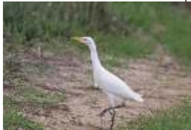
Cattle Egret, Agios Sozomenos, 25 th November.