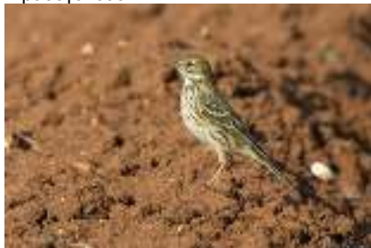
Meadow Pipit, Mandria, 26 th November.