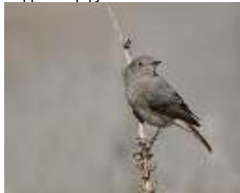
Black Redstart, Cape Greco, 1 st November.

BLACK REDSTART Phoenicurus ochrurus Καρβουνιάρης