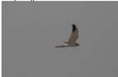
Pallid Harrier, Mandria, 14 th November.