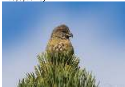
Red Crossbill, Troodos, 1 st November.

Almirolivado 2 16-Nov FGe Artemis Trail (Mt. Olympus) 3 9-Nov FGe Atalante trail south part 2 9-Nov FGe Giant Juniper 12 14-Nov MSS Kannoures Track c25 + 11-Nov SC Livadi tou Pashia 2+ One seen and others heard 7-Nov JS Livadi tou Pashia 2 9-Nov DJW Livadi tou Pashia 5 14 & 25-Nov MSS/DJW Livadi tou Pashia 8 24-Nov JS Livadi tou Pashia c10 25-Nov SC with BirdLife Cyprus Fieldtrip Troodos Visitor Centre 6 1-Nov DJW Troodos Weather Station c12 25-Nov SC with BirdLife Cyprus Fieldtrip Troodos 8 25-Nov DJW