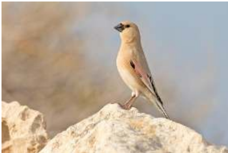
Male Desert Finch, Cape Greco, 30 th April.

DESERT FINCH Rhodospiza obsoleta : The first records for Cyprus were all reported in April. The first was at Apostolos Andreas on 5 th April followed by a male at Cape Greco 20 th Apr and a male (maybe the same) and a female there 30 th Apr – 2 nd May.