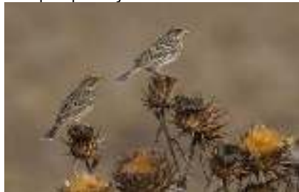
Corn Bunting, Ovgoros, 17 th November.

Anadiou to Sarama track 30+ 10-Nov JS Asprokremmos Dam 30+ 23-Nov JS Karpasia Peninsula 30+ 18-Nov JS/MC/CC Souni 35 28 together seen feeding then in flight plus 7 together in flight elsewhere 10- Nov JN