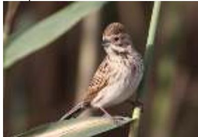
Reed Bunting, Zakaki Marsh, 27 th November.

Zakaki Marsh 2 8 & 11-Nov TRe/JN Zakaki Marsh 1 15, 23, 27 & 29-Nov VT/TRe