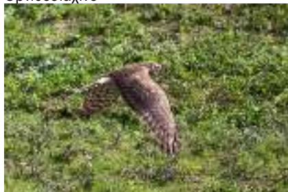
Hen Harrier, Asprokremmos Dam, 16 th November.