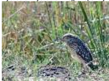
Black-crowned Night Heron, Zakaki, 8 th November.

Athalassa Dam 2 12-Nov MH Athalassa Dam 1 18-Nov MH Zakaki Marsh 1 juvenile 6-Nov FM Zakaki Marsh 1 11-Nov TD/JN