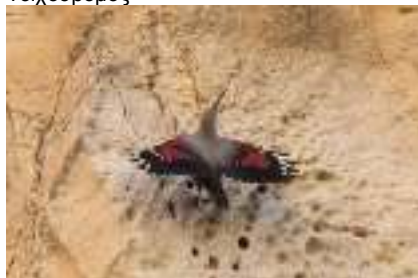
Wallcreeper, Avagas Gorge, 13 th November.