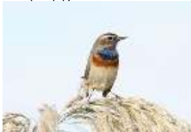
Bluethroat, Zakaki Marsh, 30 th November.