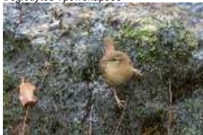
Northern Wren, Platres, 1 st November.