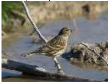
European Serin, Nicosia, 9 th November.