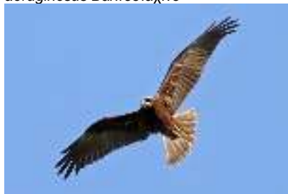
Western Marsh Harrier, Bishop's Pool, 24 th November.