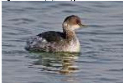
Black-necked Grebe, Akrotiri, 15 th November.