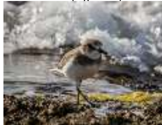
Greater Sandplover, Paphos Headland, 27 th November.

Agia Trias 4 28-Nov JS Nissi Beach, Agia Napa 1 2-Nov TD Paphos Headland 3 3, 5, 6, 9, 16, 23 & 26-Nov IKB/TD/JCh/LAC/SC/LS/ABW Paphos Headland 4 10-Nov HM Paphos Headland 2 27-Nov RAT