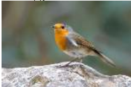
European Robin, Avagas Gorge, 4 th November.