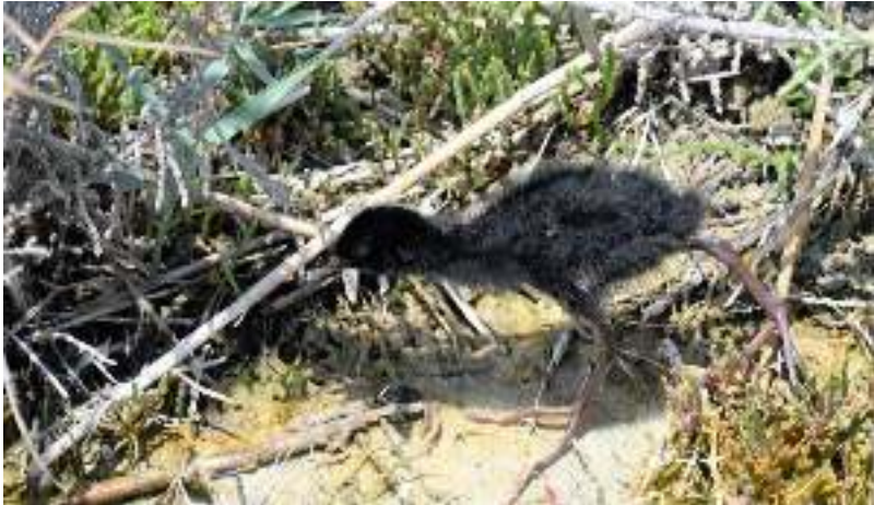
Juvenile Water Rail, Zakaki Marsh, July 2017.

WESTERN WATER RAIL Rallus aquaticus : Summer 2017 saw the first confirmed breeding of this species since 1985 when three small chicks were seen 13 th July at Zakaki Marsh.