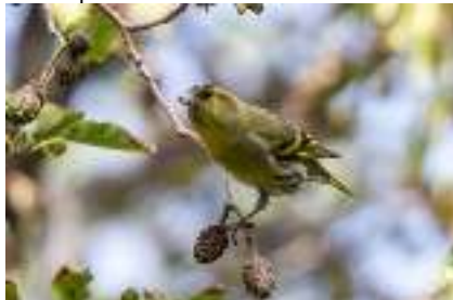
Eurasian Siskin, Evretou Dam, 14 th November.

Almirolivado 4 16-Nov FGe Evretou Dam 6+ 14-Nov DJW Kapedes 1 25-Nov FGe Lythrodontas 1 25-Nov FGe Mandra tou Kampiou 1 25-Nov FGe Paphos, Crystallo Apartments 1 Feeding on tree near these 19-Nov MBR