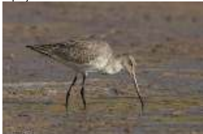
Black-tailed Godwit, Asprokremmos Dam, 16 th November.