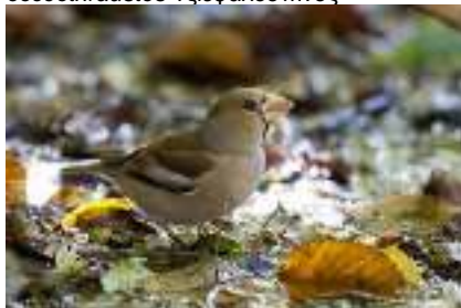
Hawfinch, Troodos, 1 st November.