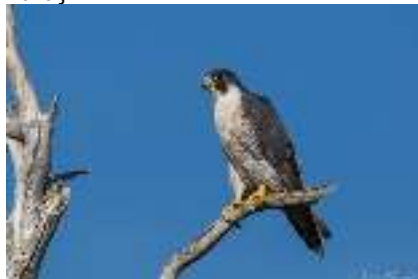
Peregrine Falcon, Timi Beach, 26 th November.

Achna Dam 2 juveniles 18-Nov FGE Agios Sozomenos 1 11-Nov JS Avagas Gorge 1 7-Nov DJW Evretou Dam 1 14-Nov DJW Makedonitissa, Nicosia 1 Juvenile. Fields near cemeteries and UN buffer zone 9-Nov JS Mavrokolymbos Dam 1 5-Nov JCh Peristerona, Paphos 1 24-Nov RAT Timi Beach 1 7, 12, 14, 18 & 26-Nov IKB/DJW