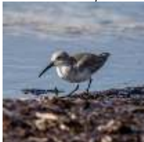
Dunlin, Paphos Headland, 27 th November.