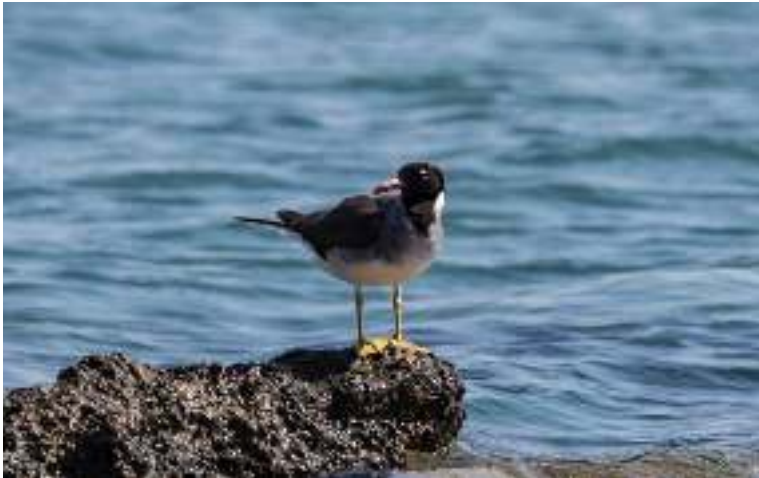
White-eyed Gull, Larnaca Airport Coast, 23 rd June.

WHITE-EYED GULL Ichthyaetus leucophthalmus : An ad seen on the coast near Larnaca Airport 23 rd Jun was the first record of this species for Cyprus. It remained in the area until early afternoon the next day.