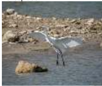
Great White Egret, Evretou Dam, 10 th November.

Achna Dam 1 1-Nov PBr Achna Dam 2 7-Nov PBr Athalassa Dam 1 12 & 18-Nov VT/MH/LAC Evretou Dam 1 10-Nov RAT Fresh Water Lake South 2 17-Nov JS/MC/CC Lady's Mile 1 fly over from Zakaki 1-Nov TRe Lady's Mile 2 flying over 7-Nov TRe/FM Larnaca Sewage Works 1 3-Nov AKY Mandria 1 6-Nov TD Zakaki Marsh 1 8, 11 & 28-Nov LAC/JN/TD/TRe