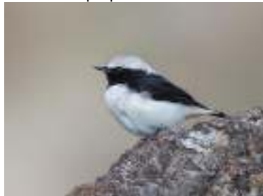
Finch's Wheatear, Anarita Park, 23 rd November.

FINSCH'S WHEATEAR Oenanthe finschii Βουνοσκαλιφούρτα