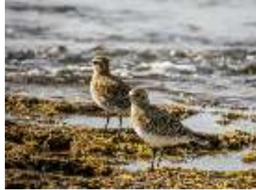
Eurasian Golden Plover, Paphos Headland. 27 th November.