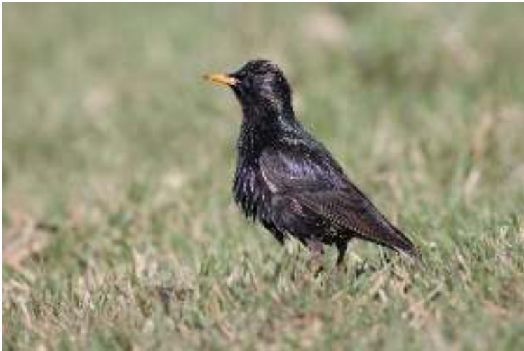
Stavros Christodoulides' photograph (below) was taken in April at Akrotiri Marsh (Phassouri Reed-beds) and the bird is brightly iridescent.

On Common Stonechats, Παπαθικιά, Saxicola torquatus rubicola , the buff feather edges of on the head and back will gradually wear off until the head and back plumage is completely black whereas the tail coverts' buff feathers will wear off leaving them white in winter.