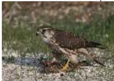
Merlin, Lamaca Sewage Works, 21 st November.

Anarita Mast 1 14-Nov IKB Larnaca Sewage Works 1 Female with prey - lark (probably skylark) 21-Nov JS Lower Ezousas 1 12-Nov IKB Mavrokolymbos Dam 1 17-Nov DJW Oroklini Marsh 1 7, 9, 10, 11 & 12-Nov BCW/PP/JS Phasouri Reed Bed 1 3 & 8-Nov ABW/LAC/JN