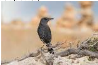
Blue Rock Thrush, Coral Bay, 27 th November.

BLUE ROCK THRUSH Monticola solitarius Γαλαζοκότσυφος