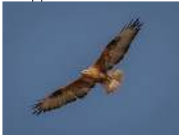
Long-legged Buzzard, Evretou Dam, 10 th November.