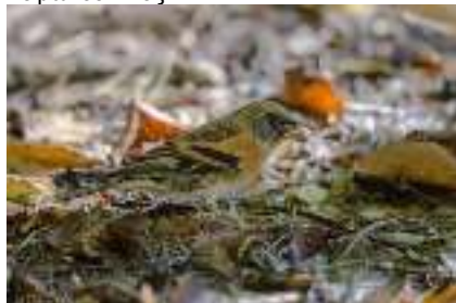
Brambling, Troodos, 1 st November.