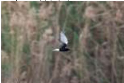
White-winged Tern, Oroklini Marsh, 12 th February.

Larnaca Sewage Works 1 breeding plumage 24-Feb SC with M Charalambides & A Leventis Oroklini Marsh 2 12 & 14-Feb DJW/MP Oroklini Marsh 1 breeding plumage 24-Feb KH/SC with M Charalambides & A Leventis