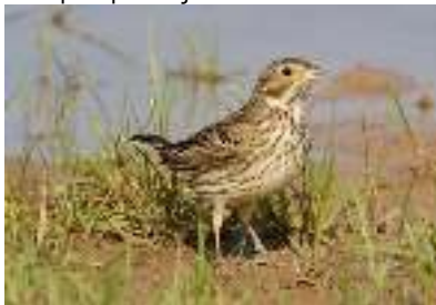
Corn Bunting, Mandria, 22 nd February.