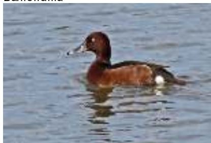
Ferruginous Duck, Bishop's Pool, 19 th February.

Max count per location: Athalassa Lake 5 12-Feb DJW Bishop's Pool 11 1 & 21-Feb KH/IKB Flamoudi Dam 3 21-Feb CR Kiados Dam 6 21-Feb CR