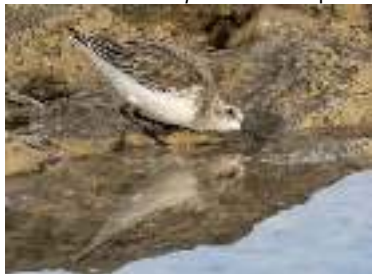
Dunlin, Paphos Headland, 15 th February.

Larnaca Salt Lake c15 17-Feb SC Larnaca Salt Lake c300 20-Feb JS Paphos Headland 2 11 & 15-Feb CR/IKB Silver Beach, Famagusta 19 20-Feb CR