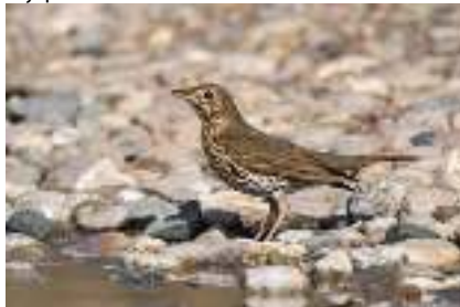
Song Thrush, Mandria, 6 th February.