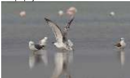
Pallas's Gull imm, Akrotiri Salt Lake, 20 th February.

Akrotiri Salt Lake, 1 imm ringed in Ukraine 20-Feb KH Larnaca Salt Lake 1 Breeding plumage 20-Feb JS Larnaca Sewage Works 1 26-Feb KeR Paphos Headland 1 heading west 12-Feb SDP