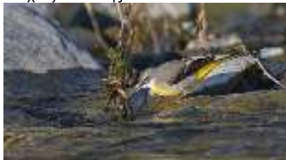
Grey Wagtail, Germasogeia Dam, 2 nd February.

Agia Varvara 1 m 10-Feb CR Amiandos Botanical Garden 1 3-Feb JS Athalassa Dam 1 2-Feb MH Athalassa Dam 2 5-Feb JS Germasogeia Dam 1 2-Feb KH Larnaca Salt Lake 1 Kamares area 6 & 20-Feb MP/JS Lower Ezousas 1 9-Feb IKB Nicosia, Engomi 1 3-Feb SC Oroklini Marsh 1 18-Feb KH Paphos Sewage Plant 1 8, 11, 12 & 14- Feb IKB/CR Phasouri Reed-beds 1 24-Feb JN Piania Dam, Paphos 1 3-Feb DJW Psilo Dendro, Platres 2 25-Feb KH Secret Valley Golf Course 1 24-Feb CR Souni 1 Visiting garden pool all month, now present since the beginning of December JE Zakaki Marsh 1 9 & 22-Feb VT/KH