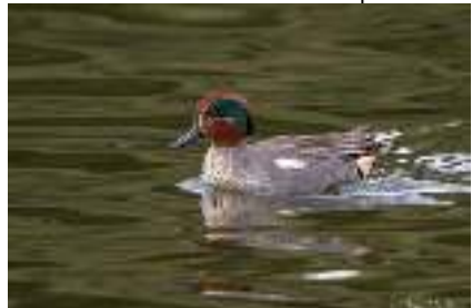
Common Teal, Athalassa Dam, 12 th February.