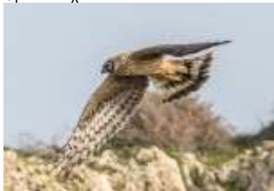
Hen Harrier, Mandria, 7 th February.