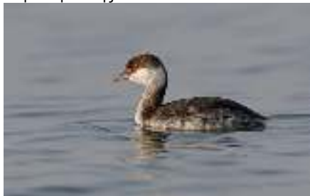
Horned Grebe, Kouklia, 7 th February.

Kouklia Fish Farm 1 2, 3, 4 & 7-Feb SC/CR/JN/JE/KH