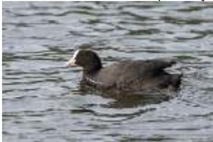
Common Coot, Athalassa Dam, 12 th February.