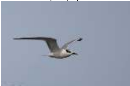
Sandwich Tern, Paphos Headland, 15 th February.

Max count per location: Lady's Mile 3 26-Feb KH Larnaca Beach 2 20 & 21-Feb IKB Oroklini 4 14-Feb MP Paphos Headland 1 15-Feb DJW Timi Beach 1 11 & 26-Feb IKB/CR