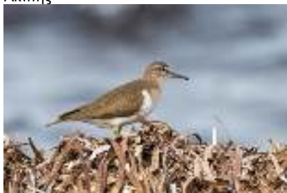
Common Sandpiper, Paphos Headland, 15 th February.

Agia Trias 1 2 & 9-Feb JS/KH Fresh Water Lake (South) 1 20-Feb CR Leivadia, Jumbo Drainage Channel 1 4 & 27-Feb MP/JS