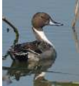
Northern Pintail, Bishop's Pool, 6 th February.