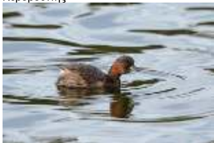
Little Grebe, Athalassa Park, 12 th February.