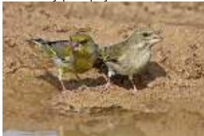
European Greenfinch, Mandria, 4 th February.