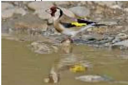
European Goldfinch, Mandria, 23 rd February.