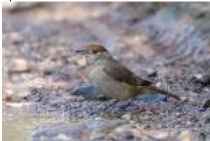
Eurasian Blackcap female, Mandria, 6 th February.