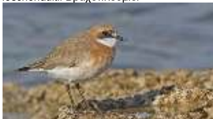
Greater Sandplover, February 23 rd .

Agia Trias 4 2-Feb JS Agia Trias 8 9-Feb KH Agia Trias 3 27-Feb JS Kermia Beach, Agia Napa 3 2-Feb JS Macronissos Beach, Agia Napa 8 2 & 10- Feb JS/MP Oroklini Beach 1 on breakwater 20-Feb CR Paphos Headland 3 9, 11 & 15-Feb DJW/CR/IKB Paphos Headland 1 20-Feb SM