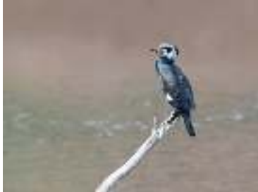
Great Cormorant, Athalassa Dam, 14 th February.

GREAT CORMORANT Phalacrocorax carbo Κορμοράνος