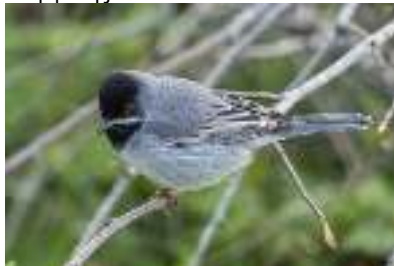
Rüppell's Warbler, Paphos Headland, 27 th February.