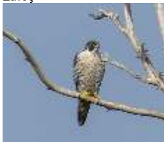
Peregrine Falcon, Timi Beach, 5 th February.

Akamas 1 south Akamas 25-Feb RoB Akhna Dam 1 calidus juv 5-Feb KH Bishop's Pool 1 14-Feb KH Episkopi, Paphos 1 17-Feb DJW Eptakomi Cliffs 1 male, calling 21-Feb CR Kensington Cliffs 2 3 & 22-Feb KH Kensington Cliffs 1 ad 28-Feb KH Larnaca Sewage Works 1 calidus juv 5 & 19-Feb KH/IKB Oroklini Marsh 1 flew over 18-Feb MP Phasouri Reed-beds 1 15-Feb KH Timi Beach 1 3, 5, 9, 26 & 28-Feb IKB/CR