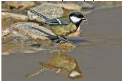
Great Tit, Mandria, 23 rd February.