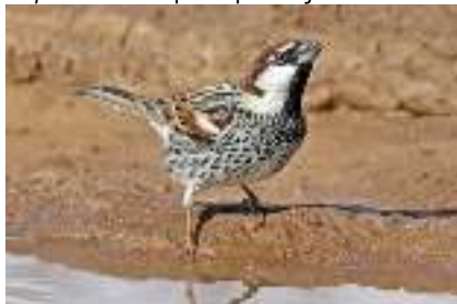
Spanish Sparrow, Mandria, 28 th February.