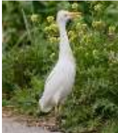
Cattle Egret, Paphos Sewage Plant, 16 th February.