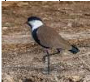
Spur-winged Lapwing, Paphos Sewage Plant, 13 th February.