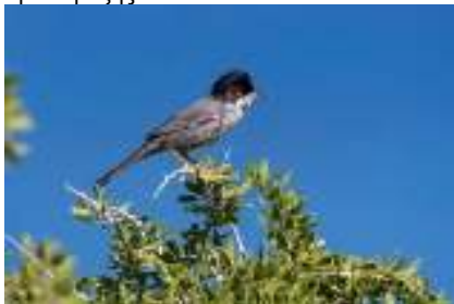
Cyprus Warbler, Cape Greco, 27 th February.