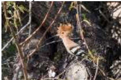
Common Hoopoe, Anarita, 3 rd February.

Agia Varvara 2 25-Feb DJW Akrotiri Gravel Pits 1 in flight 24-Feb JN Anarita 1 calling 3-Feb DJW Larnaca Airport Pools North 1 20-Feb JS Larnaca Sewage Pools 1 12-Feb DJW Larnaca Sewage Works 2 24-Feb SC with M Charalambides & A Leventis Lower XP 1 flew across motorway 27-Feb CR Mandria 1 28-Feb CR Paphos Lighthouse 1 28-Feb IKB Pegeia Sea Caves area 1 22-Feb RoB Petounta Point 1 11-Feb KH Phasouri Reed-beds 1 in flight 24-Feb JN Souni 1 heard calling 15 & 19-Feb JN Trimiklini 1 25-Feb KH