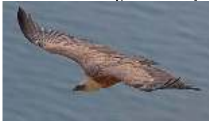
Griffon Vulture, Kensington Cliffs, 3 rd February.

Kensington Cliffs 10 3-Feb KH Kensington Cliffs 1 flew up from cliffs, circled then departed to NW 18-Feb JN Kensington Cliffs 2 28-Feb KH Paramali 4 2 groups of 2 over hills near tunnel, 9.15h 27-Feb CR