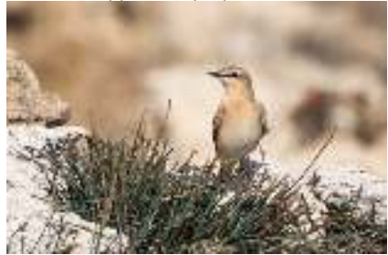
Isabelline Wheatear, Paphos Headland, 8 th February.

Singles reported throughout the month at suitable, mainly coastal locations. Records of 2+ listed: