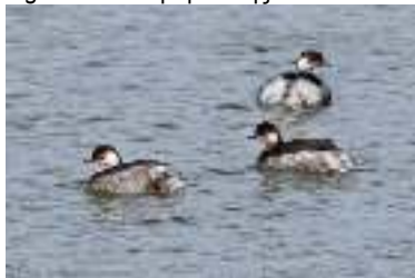
Black-necked Grebe, Bishop's Pool, 19 th February.