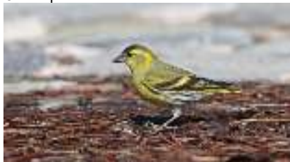
Eurasian Siskin, Troodos, 25 th February.