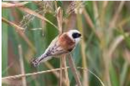
Eurasian Penduline Tit, Zakaki Marsh, 8 th February.

Larnaca Salt Lake 1+ Heard 12-Feb KH Phasouri Reed-beds 1 24 & 26-Feb JN/KH Zakaki Marsh 1 6, 9, 10 & 28-Feb IKB Zakaki Marsh 3 8-Feb DJW Zakaki Marsh 4 22-Feb KH Zakaki Marsh 2 26-Feb TRE