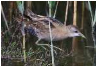
Little Crane, Zakaki Marsh, 26 th February.

LITTLE CRAKE Zapornia parva Μικροπουλάδα