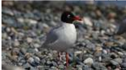
Mediterranean Gull, Lady's Mile, 13 th February.