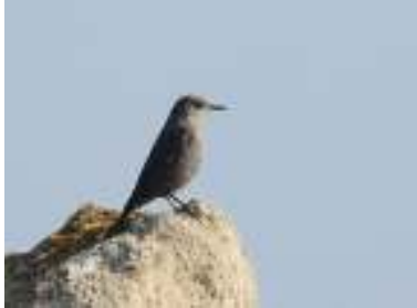
Blue Rock Thrush, Cape Greco, 7 th February.

Agia Napa - Cape Greco - Protaras walk 1 28-Feb KeR