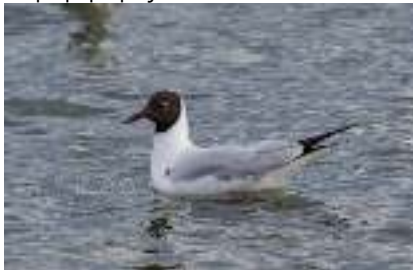
Black-headed Gull, Oroklini Beach, 27 th February.