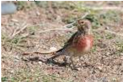
Common Linnet, Mandria, 6 th February.