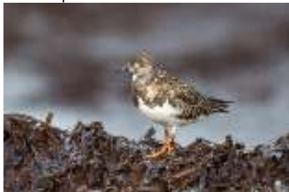
Ruddy Turnstone, Paphos Headland, 15 th February.

Paphos Headland 2 11-Feb CR Paphos Headland 4 15-Feb IKB Spiros Beach 1 12-Feb KH