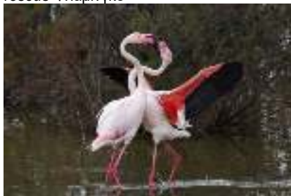
Greater Flamingo, Oroklini Marsh, 12 th February.