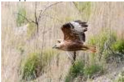
Long-legged Buzzard, Theletra, 20 th February.