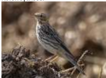
Red-throated Pipit, Anarita Mast, 9 th February.

Anarita Mast 3 1 & 2-Feb IKB Anarita Mast 2 9, 11 & 12-Feb IKB Larnaca Salt Lake 1 11-Feb MP Paphos Headland 3 11-Feb CR Paphos Headland 2 15-Feb IKB Paphos Headland 5 20-Feb SM Paphos Sewage Plant 2 22-Feb TRe Zakaki Marsh 2 8-Feb KH Zakaki Marsh 1 9-Feb VT