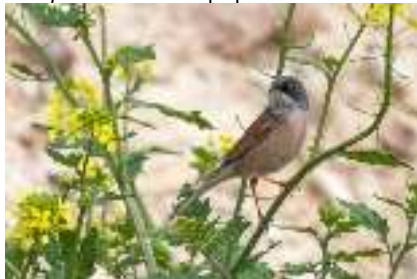
Spectacled Warbler, Asprokremmos Dam, 15 th February.