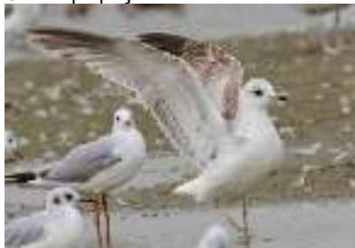
Common Gull, Lady's Mile, 8 th February.