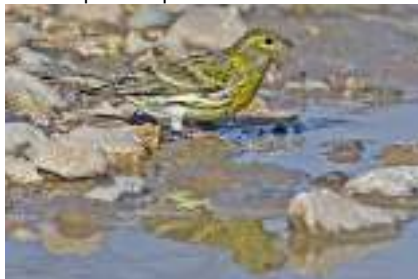
European Serin, Mandria, 23 rd February.