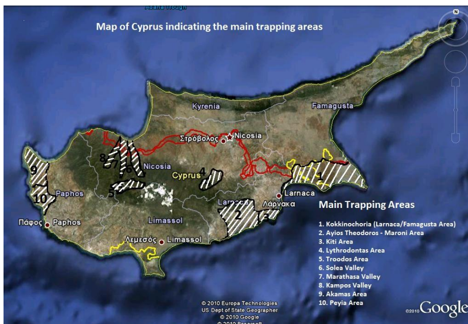
Figure 1 Map of Cyprus showing the main trapping areas

Although trapping is also an issue in other areas of Cyprus, the survey efforts focus on these two main areas due to resource limitations and because they hold the highest trapping activity. The monitoring is undertaken by visiting a random selection of sample squares (1 km 2 ) during daytime hours, with a focus on detecting mist netting activity. Limesticks are recorded if they are found while searching for mist nets. The squares selected are stratified to ensure a representative coverage of areas under SBA administration and the Republic of Cyprus. For more details on the methodology of BirdLife Cyprus read Appendix 1.