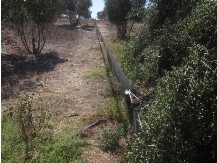
Figure 5: Active Unset Net present (AUN) in an olive grove