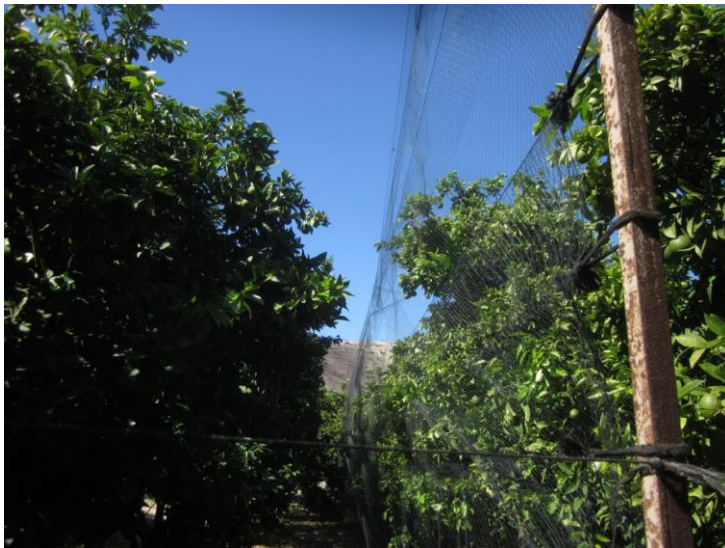
Figure 6: Active Set Net present (ASN) –corridors in orchards are often used for mist netting