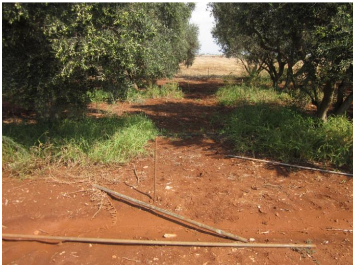
Figure 4: Active No Net ride (ANN) with poles, bases, feathers & signs of trampling in an olive grove