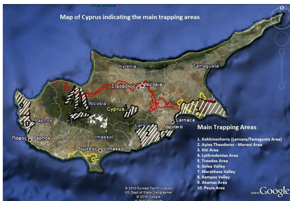
Figure 1 Map of Cyprus showing the main trapping areas

Although trapping is also an issue in other areas of Cyprus, the survey efforts focus on these two main areas due to resource limitations and because they hold the highest trapping activity. The monitoring is undertaken by visiting a random selection of sample squares (1 km 2 ) during daytime hours, with a focus on detecting mist netting activity. Limesticks are recorded if they are found while searching for mist nets. The squares selected are stratified to ensure a representative coverage of areas under SBA administration and the Republic of Cyprus. For more details on the methodology of BirdLife Cyprus read Appendix 1.