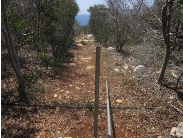
Figure 3: Prepared (P) net ride