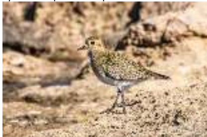
Eurasian Golden Plover, Paphos Headland, 7 th December.

Max count per location: Larnaca Desalination Plant 218 13-Dec JS Larnaca Sewage Works 45 1-Dec VT Mandria 1 5 & 7-Dec KRo/SC Paphos Headland 81 15-Dec CR