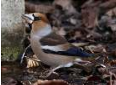
Hawfinch, Troodos, 21 st December.

Almirolivado (Troodos) 1 1 & 29-Dec JS/CR Amiandos Botanical Gardens c8 1-Dec JS Armou Hills 1 flying away 22-Dec CR Livadi tou Pashia 3 1m and 2f 1-Dec JS Livadi tou Pashia 1 2, 14 & 21-Dec FGe/TRe Marathounta 1 in valley 11-Dec CR Marathounta 10 perched and flying around 23-Dec CR Marathounta 6 perched in rain, in valley 31-Dec CR Platania Picnic site 4+ 1-Dec JS Salamiou 3 18-Dec CR Troodos area 1 29-Dec CR Troodos, Leventis Botanical Garden 19 29-Dec CR