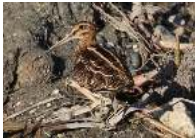
Common Snipe, Zakaki Marsh, 11 th December.