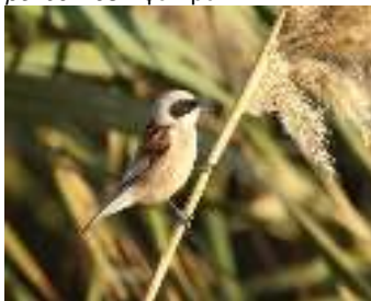
Eurasian Penduline Tit, Zakaki Marsh, 26 th December.