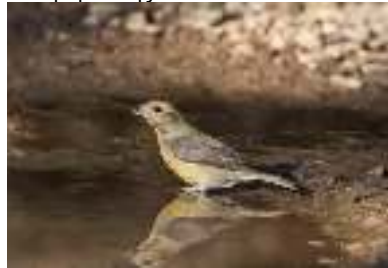
Red Crossbill, Livadi tou Pashia, 1 st December.

Almirolivado 6 29-Dec CR Livadi tou Pashia 2 1 & 2-Dec JS/FGe Troodos area 30 flocks flying and perching 29-Dec CR Troodos, Leventis Botanical Garden 14 29-Dec CR Troodos, visitors centre 1 yellow male in full song on top of pine tree 29-Dec CR