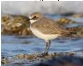
Greater Sandplover, Paphos Headland, 28 th December.

Agia Trias 5 8-Dec VT Paphos Headland 3 7, 15, 25 & 28-Dec DJW/SCar/RH