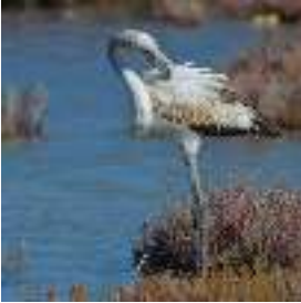
Greater Flamingo, immature, Lady's Mile.