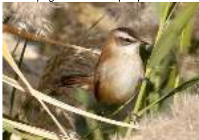
Moustached Warbler, Zakaki Marsh, 7 th December.