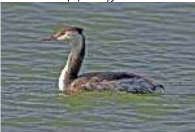
Great Crested Grebe, Akrotiri Gravel Pits, 11 th December.

Akrotiri Gravel Pits 1 1, 4, 5, 6, 7, 8, 9, 11, 12 & 15-Dec JE/TRre/JS/ABW/FGe/CR/JN/DJW/MH Asprokremmos Dam 1 12-Dec CR Asprokremmos Dam 2 16, 21 & 28-Dec CR/DJW