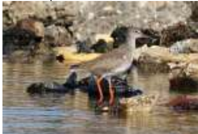
Common Redshank, Akrotiri Gravel Pits, 12 th December.