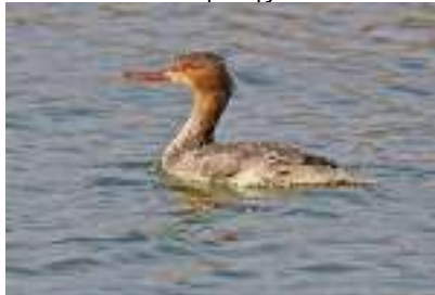
Red-breasted Merganser, Akrotiri Gravel Pits, 29 th December.

RED-BREASTED MERGANSER Mergus serrator Θαλασσοπρίστης