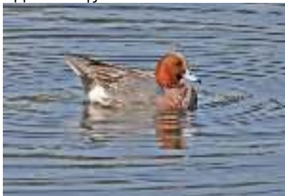
Eurasian Wigeon, Bishop's Pool, 21 st December. Photograph by John East.

Akrotiri Gravel Pits 4 29-Dec TRC Bishop's Pool 4 9 & 23-Dec JN/SCar Bishop's Pool 2 then up to 5 through month 11-Dec JE Bishop's Pool 5 20-Dec ABW Larnaca Sewage Works 8 1-Dec VT Larnaca Sewage Works 9 13-Dec JS Larnaca Sewage Works 7 26-Dec FGe Vathia Gonia treated water new pool 3 9- Dec FGe