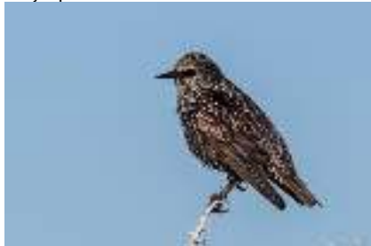
Common Starling, Paphos Headland, 7 th December.