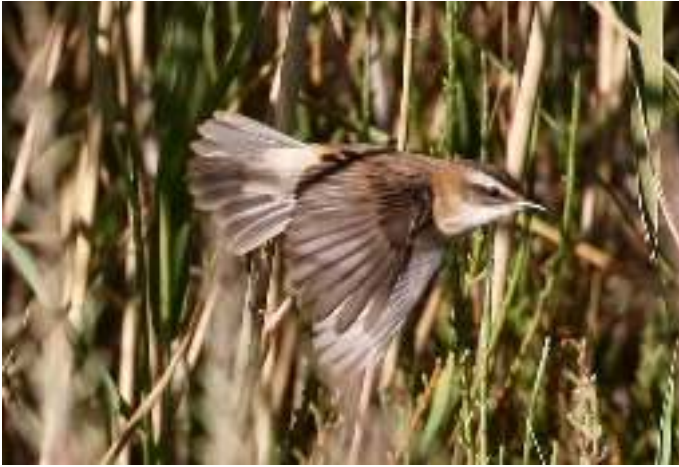
Photographed at Zakaki Pool, Limassol 7 th December 2017.