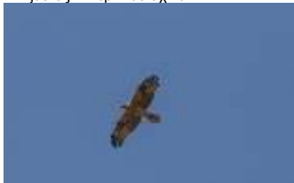
Bonelli's Eagle, Agios Sozomenos, 2 nd December.

Agios Sozomenos 1 Juvenile 2 & 30-Dec JS/FGe Akrotiri marsh 1 1 ad. hunting Wood Pigeons 29-Dec RH Akrotiri Salt Lake 1 juv, came up from nearby scrub 8-Dec CR Arminou Dam 2 ads 18-Dec CR Armou Hills 1 ad 1-Dec CR Asprokremmos Dam 1 juv 12-Dec CR Bishop's Pool 1 11-Dec JE Evretou Dam 2 ads 14-Dec CR Kamares (Tala) 2 adult pair 13-Dec DJW Paphos Sewage Plant 1 juv 3-Dec CR Phinikas 2 16-Dec DJW Vathia Gonia treated water new pool 2 1 adult, 1 juvenile, flew over 9-Dec FGe Vathia Gonia treated water new pool 1 juvenile, flew over towards UN buffer zone 26-Dec FGe