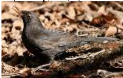
Eurasian Blackbird, Troodos, 21 st December.