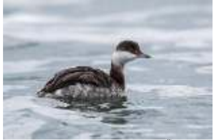
Horned Grebe, Kouklia (Paphos), 16 th December.

Kouklia Fish Farm 1 5, 7, 10, 13, 15, 16, 20 & 30-Dec CR/SC/CM/SS/ABW/TRre/JE/DJW