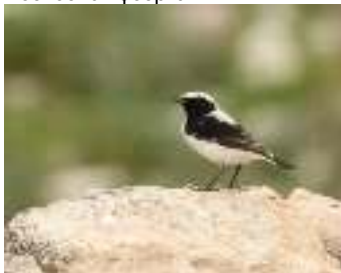
Finch's Wheatear, Phinikas, 25 th December.

Agia Varvara 1 m 20 & 25-Dec CR Agios Sozomenos 3 2m and 1f 2-Dec JS Agios Sozomenos 1 m 9-Dec FGe Agios Sozomenos 2 males 30-Dec FGe Anarita Park 1 m 25-Dec CR