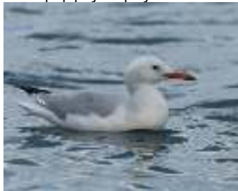
Slender-billed Gull, Lady's Mile, 30 th December.

Lady's Mile 2 8, 12 & 29-Dec TRe/JS/JE Lady's Mile 1 14 & 23-Dec TRe