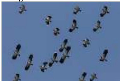
Northern Lapwing, Agios Sozomenos, 2 nd December.

Agios Sozomenos 82 2-Dec JS Akrotiri Salt Lake 25 8-Dec CR Asprokremmos Dam 2 21-Dec CR Kouklia Bay 1 7-Dec SC with C Makris & S Spyrou Larnaca Sewage Works 7 1-Dec VT Larnaca Sewage Works 2 11-Dec JS Oroklini Marsh 21 24-Dec MH Paphos Sewage Plant 2 3-Dec CR Potamia 15 9-Dec FGe