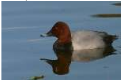
Common Pochard, Bishop's Pool.

Athalassa Dam 1 m 26-Dec CR Bishop's Pool 1 18 & 20-Dec JE/ABW Bishop's Pool 2 21-Dec ABW