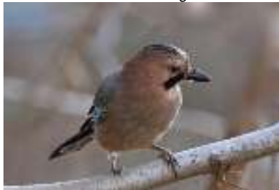
Eurasian Jay, Troodos, 21 st December.