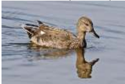
Gadwall, Bishop's Pool, 18 th December.