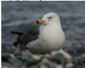
Armenian Gull, Lady's Mile, 24 th December.