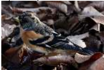
Brambling, Troodos, 21 st December.

Larnaca Salt Lake 1 11-Dec VT Livadi tou Pashia 4 1-Dec DJW Livadi tou Pashia 2 14-Dec TRe Livadi tou Pashia 1+ 21-Dec TRe Marathounta 2 with Hawfinches 23-Dec CR