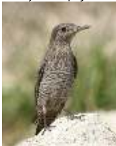
Blue Rock Thrush, Cape Greco, 26 th December.

Agios Sozomenos 1 female 2-Dec JS Anarita Park 1 25-Dec CR Cape Greco 1 fem 26-Dec SCar Coral Bay 1 male 4-Dec DJW Kamares (Tala) 1 25-Dec DJW Phinikas 1 male 16-Dec DJW Secret Valley Golf Course (Ha Potami) 1 fem 16-Dec CR