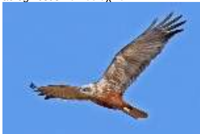
Western Marsh Harrier, Akrotiri Gravel Pits, 8 th December.

Largest counts: Akrotiri Gravel Pits 3 11-Dec JE Larnaca Sewage Works 3 26-Dec FGe Phasouri Reed-beds 5 a female hunting over reed-bed, 2 quartering to S and 2 circling to the N 9-Dec JN