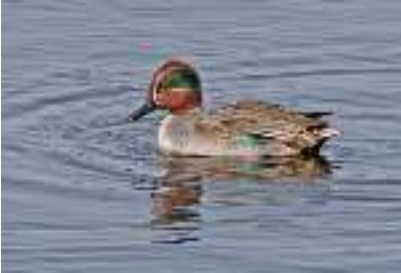
Common Teal, Bishop's Pool, 21 st December.