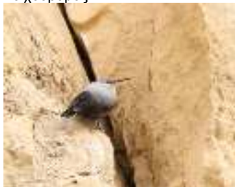
Wallcreeper, Avagas Gorge, 28 th December.