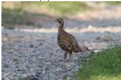
Black Francolin, Akrotiri Gravel Pits, 11 th December.

BLACK FRANCOLIN Francolinus francolinus Φραγκολίνα