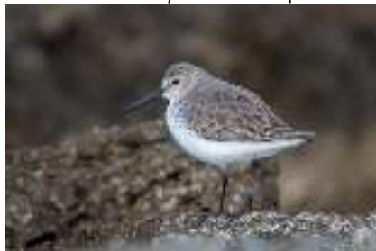
Dunlin, Paphos Headland, 15 th December.