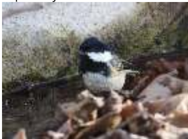
Coal Tit, Troodos, 14 th December.