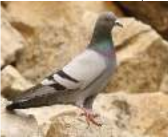
Rock Dove, Avagas Gorge, 28 th December