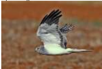
Hen Harrier, Mandria, 15 th December.

Largest counts: Frenaros 2 5-Dec AKe Geri 3 1 adult male & 2 ringtails 26-Dec FGe Kidasi 2 2-Dec KRo Larnaca Sewage Works 2 11-Dec VT Mandria 2 fems 28-Dec CR