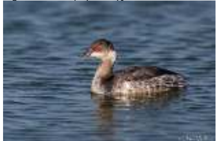
Black-necked Grebe, Akrotiri Gravel Pits, 11 th December.