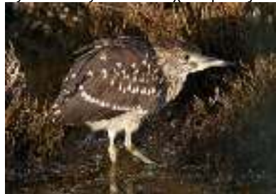
Black-crowned Night Heron, Zakaki Marsh, 15 th December.