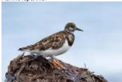
Ruddy Turnstone, Paphos Headland, 15 th December.

RUDDY TURNSTONE Arenaria interpres Χαλικονεραλλίδι