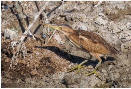
Common Little Bittern, Akrotiri Marsh, 7<sup>th</sup> November.