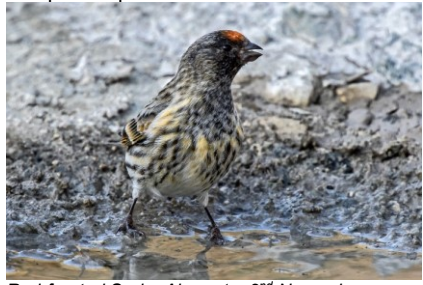
Red-fronted Serin, Akrounta, 2<sup>nd</sup> November.

Akrounta 1 31-Oct & 2-Nov SS/TRe/JS/JF/CR/JWa