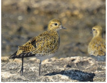
Eurasian Golden Plover, Paphos Headland.

Max count per location: Coral Bay 1 10-Nov DJW Lady's Mile 2 20-Nov LAC/DJW Mandria 4 on beach 26-Nov MJH Paphos Headland 51 29-Nov LAC Spiros Pool c40 Flock in flight over area 25-Nov JS