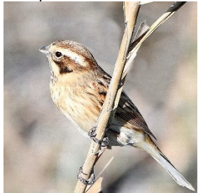
Reed Bunting, Akrotiri, 25th November.

Akrotiri Marsh (Phasouri Reed-beds) 1 15-Nov DS