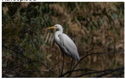
Great White Egret, Athalassa Dam, 16<sup>th</sup> November.