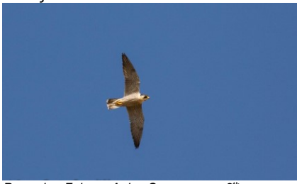
Peregrine Falcon, Agios Sozomenos, 8<sup>th</sup> November.

Agios Sozomenos 2 Male and female mobbing a pair of Bonell's Eagle who were perched on cliffs near to Peregrine's nest site 8-Nov JS