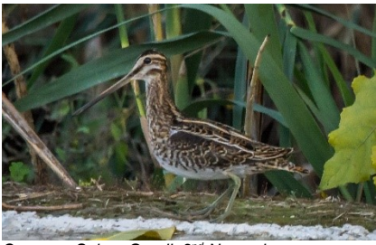
Common Snipe, Goudi, 2<sup>nd</sup> November.