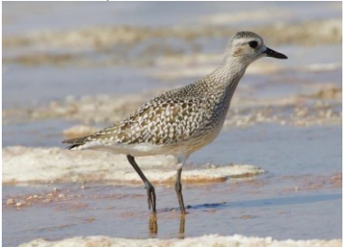
Grey Plover, Lady's Mile, 8<sup>th</sup> November.

GREY PLOVER Pluvialis squatarola Στακτοπλουμίδι