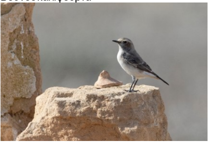
Finsch's Wheatear female, Paphos Headland, 17<sup>th</sup> November.