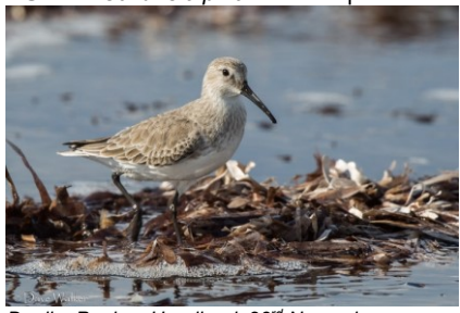
Dunlin, Paphos Headland, 23<sup>rd</sup> November.