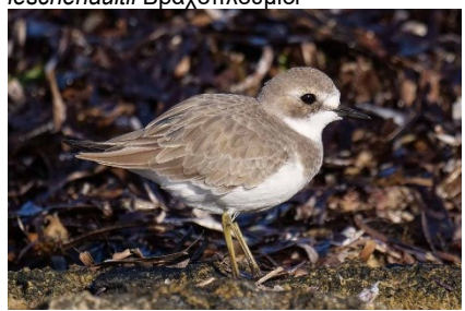
Greater Sandplover, Paphos Headland, 2<sup>nd</sup> November.

GREATER SANDPLOVER Charadrius leschenaultii Βραχοπλουμίδι