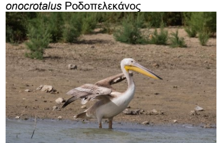
Great White Pelican, Akhna Dam, 3<sup>rd</sup> November.

Akhna Dam 1 Juvenile 3, 9, 10 & 20-Nov JS/SC/STi