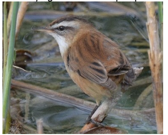
Moustached Warbler with missing tail, Zakaki Marsh.

Max count per location: Akhna Dam 1 3-Nov JS Akrotiri Salt Lake 2 28-Nov CR Mia Milia Water Treatment Plant 1 14-Oct NCP