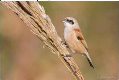
Eurasian Penduline Tit, Mavrokolympos Dam, 2<sup>nd</sup> November.