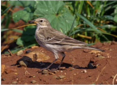
Water Pipit, Mandria, 6<sup>th</sup> November.