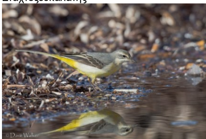
Grey Wagtail, Paphos Headland, 23rd November.

GREY WAGTAIL Motacilla cinereal Σταχτοζευκαλάτης