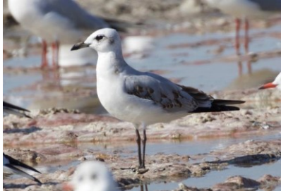
Mediterranean Gull, Lady's Mile, 6<sup>th</sup> November.

MEDITERRANEAN GULL Larus melanocephalus Μαυροκέφαλος Γλάρος