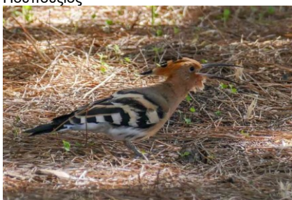
Common Hoopoe, Asprokremmos Dam, 2<sup>nd</sup> November.

Asprokremmos Dam 1 2 & 15-Nov IKB Dekeleia Garrison 1 20-Nov STi UN buffer zone, Nicosia airport 1 20-Nov VV