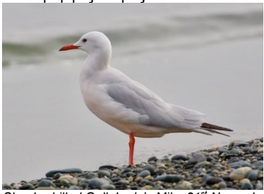
Slender-billed Gull, Lady's Mile, 21<sup>st</sup> November.

Max count per location: Lady's Mile 4 22 & 28-Nov TRe/CR Larnaca Sewage Works 2 25-Nov JS