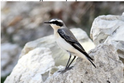
Northern Wheatear, Anarita Park, 3<sup>rd</sup> November.

Agios Sozomenos 1 1-Nov JS Anarita Park 1 3-Nov FM Atalante Trail 1 1-Nov AF Kotchatis, Nicosia 1 2-Nov FGe Larnaca Sewage Works area 1 3-Nov AR Mandria 2 2-Nov IKB