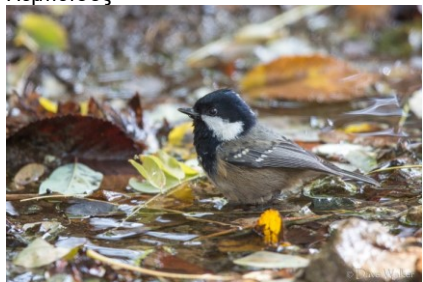
Coal Tit, Livadi tou Pashia, 5<sup>th</sup> November.