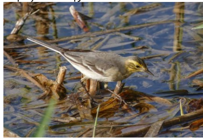
Citrine Wagtail, Zakaki Marsh, 7<sup>th</sup> November.

CITRINE WAGTAIL Motacilla citreola Κιτροζευκαλάτης