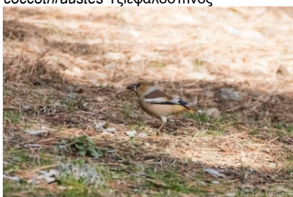
Hawfinch, Livadi tou Pashia, 5<sup>th</sup> November.

HAWFINCH Coccothraustes. coccothraustes Τζιεφαλόσπινος