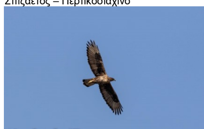
Bonell's Eagle, Agios Sozomenos, 8<sup>th</sup> November.

BONELLI'S EAGLE Aquila fasciatus Σπιζαετός – Περτικοσιάχινο