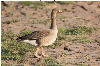
Greater White-fronted Goose, Asprokremmos Dam, 6th November.

Asprokremoos Dam 1 juvenile 2, 6, 12, 16 & 23-Nov AF/IKB/DJW/VT/CR Larnaca Sewage Works 6 2 ads and 4 iuvs 7, 12, 19, 21, 23, 24, 25 & 30-Nov DS/JS/MGr/LAC/RAt