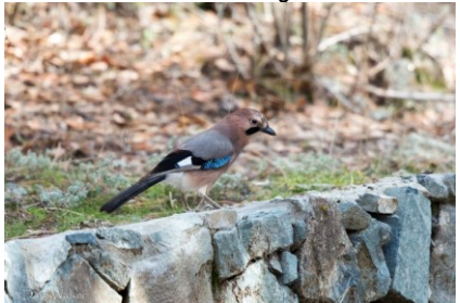
Eurasian Jay, Livadi tou Pashia, 5<sup>th</sup> November.