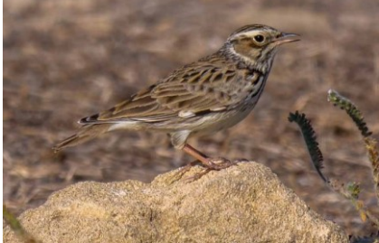
Woodlark, Paphos Headland, 17<sup>th</sup> November.