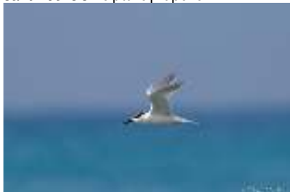
Sandwich Tern, Potima Bay, 24 th January.