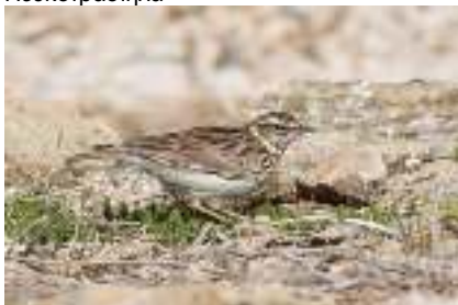
Woodlark, Paphos Headland, 5 th January.