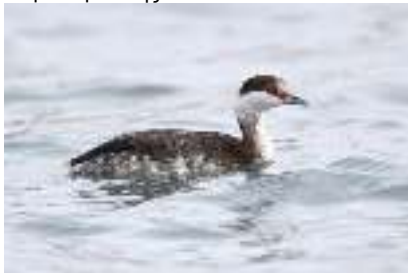
Horned Grebe, Kouklia Fish Farm.

Kouklia Fish Farm 1 8, 14, 16, 20, 21, 24,