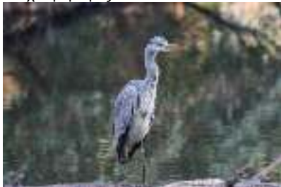
Grey Heron, Athalassa Dam, 12 th January.

Largest counts: Fresh Water Lake South 80 13-Jan CC/MC/LS/AP Lady's Mile 28 together flying from E to SW along shoreline 20-Jan JN Zakaki Marsh 84 at least, with at least 55 on the new pools after heavy rainstorms 5- Jan JN