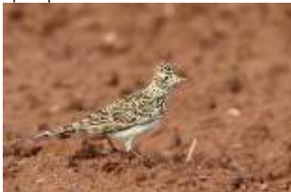
Eurasian Skylark, Mandria.