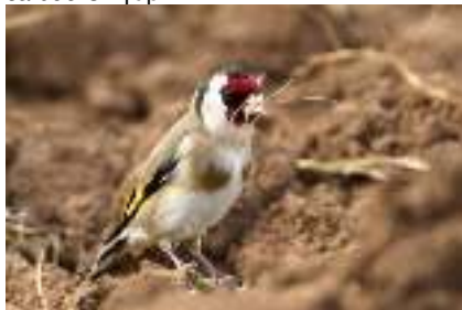
European Goldfinch, Mandria.