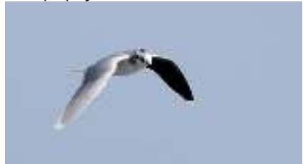
Little Gull, Lady's Mile, 27 th January.

Lady's Mile 2 4-Jan TRe Lady's Mile 1 19, 22, 24, 26, 27 & 29-Jan TRe/JS/IKB/JN