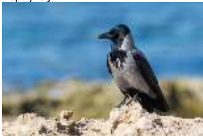
Hooded Crow, Paphos Headland, 31 st January.