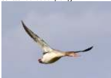
Red-breasted Merganser, Akrotiri Gravel Pits, 3 rd January.