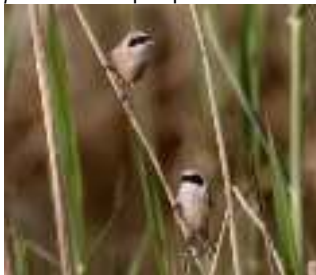
Eurasian Penduline Tit, Zakaki Marsh, 10 th January.

Zakaki Marsh 2 3, 8, 9, 10 & 15-Jan TRe/EST