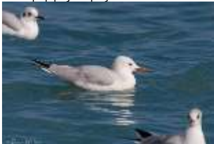
Slender-billed Gull, Lady's Mile, 27 th January.

Lady's Mile 3 4, 10 & 15-Jan TRe Lady's Mile 1 5, 15, 16, 18, 19, 22, 26, 27 & 29-Jan TRe/JN/Est/VE/DJW/JS/IKB/KH Lady's Mile 2 22 & 24-Jan TRe/KH Larnaca Salt Lake 5 14-Jan CR