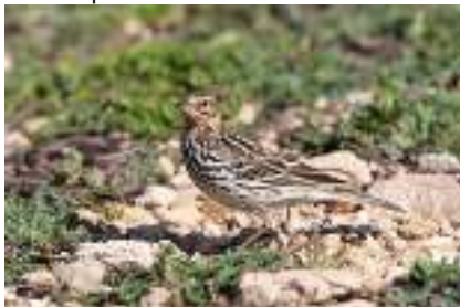
Red-throated Pipit, Paphos Headland, 31 st January.