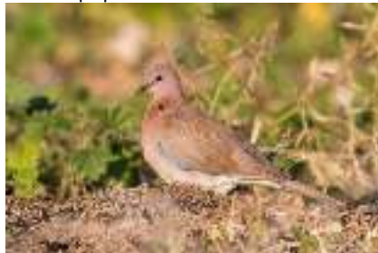
Laughing Dove, Kouklia, 30 th January.