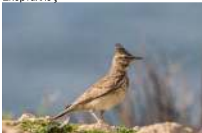
Crested Lark, Paphos Headland, 9 th January.

CRESTED LARK Galerida cristata Σκορταλλός