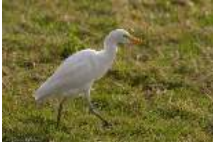
Cattle Egret, Paphos Sewage Plant, 16 th January.

Largest counts: Akhna Dam 62 roost 14-Jan CR Oroklini Marsh 190 sunset roost 14-Jan CR