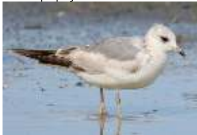
Common Gull, Lady's Mile, 26 th January.