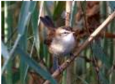
Moustached Warbler, Zakaki Marsh, 9 th January.

Bishop's Pool 1 10-Jan KH Kioneli Dam 1 26-Jan NCP Zakaki Marsh 1 3, 5, 9, 10 & 20-Jan TRe/STH/JN Zakaki Marsh 2 7, 15 & 28-Jan KH/CDa/EST