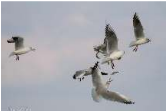
Black-headed Gull ( Larus ridibundus ), Lady's Mile

Lady's Mile provided ample opportunity to study the gull flocks. Seven species of gull were identified – hundreds of Black-headed plus a few Armenian , Yellow-legged and Caspian , 1 adult Mediterranean with a darkening cap, an immature Slender-billed Gull on the sea and a few very quick glimpses of a lone Little Gull plus an obliging Sandwich Tern fishing over the sea. By then everyone was hungry and departed for lunch, with many staying for the New Year's luncheon with our non-birding companions. An enjoyable ending to a good morning's birdwatching. Many thanks to all who took part and for sharing their observations. Altogether 53 species were seen during the field meeting.