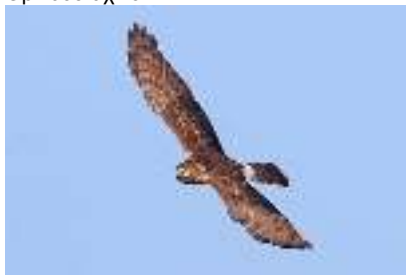
Hen Harrier, Akrotiri, 8 th January.