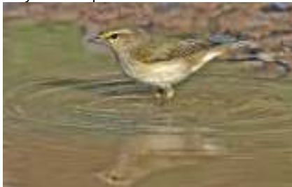
Common Chiffchaff, Mandria, 31 st January.

109 reports of this species received for the month.