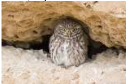
Little Owl, Avakas Coast, 24 th January.