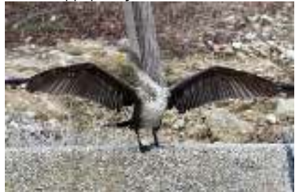
Great Cormorant.

GREAT CORMORANT Phalacrocorax carbo Κορμοράνος