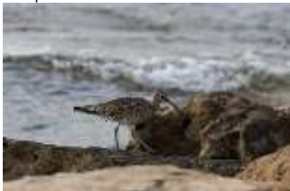
Whimbrel, Paphos Headland, 9 th January.

Paphos Headland 1 5, 9, 13, 27 & 28-Jan CR/JS/AKy/JN/KH/IKB