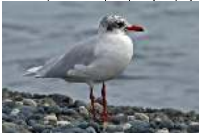
Mediterranean Gull, Lady's Mile, 16 th January.

Lady's Mile 1 4, 5, 16, 19, 22, 27 & 29-Jan TRe/VE/KH/DJW/IKB/JS/JN Lady's Mile 2 18 & 26-Jan TRe Oroklini Coast 2 non-breeding plum 14- Jan CR