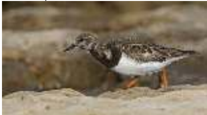
Ruddy Turnstone, Paphos Headland, 27 th January.

Paphos Headland 4 5, 27 & 28-Jan CR/KH/IKB Paphos Headland 2 9 & 13-Jan JS/AKy/JN