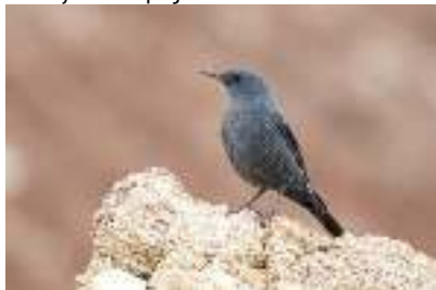
Blue Rock Thrush, Phinkas, 14 th January.

Avagas Coast 1 male 24-Jan DJW Cape Greco 3 2m and 1f 8-Jan KH Cape Greco 5 16-Jan CDa Cape Greco 2 1m and 1f 29-Jan KH Germasogeia Dam 2 23-Jan VT Phinikas 1 male 1, 14 & 16-Jan DJW Pikni Forest Picnic site, Pegeia 2 pair 9-Jan KPr Secret Valley GC 1 m 20-Jan CR White River Cliffs, Akamas 1 Male 9-Jan JS/AKy