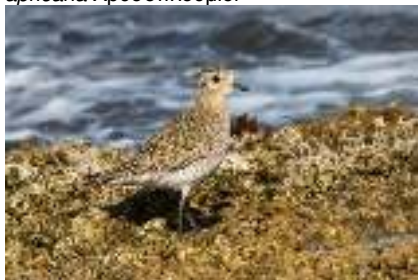
Eurasian Golden Plover, Paphos Headland, 31 st January.

EURASIAN GOLDEN PLOVER Pluvialis apricaria Χρυσοπλουμιδι