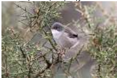
Sardinian Warbler female.