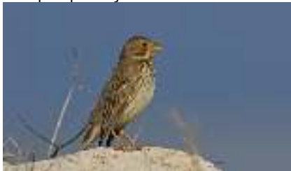
Corn Bunting, 27 th January.