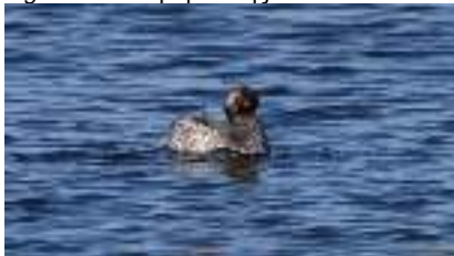
Black-necked Grebe, Larnaca Sewage Works, 8 th January.