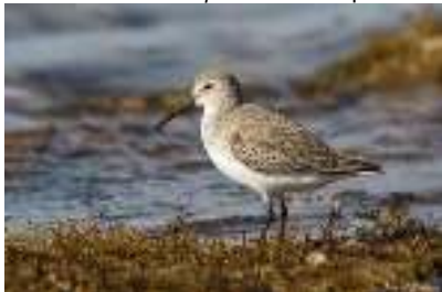
Dunlin, Paphos Headland, 31 st January.