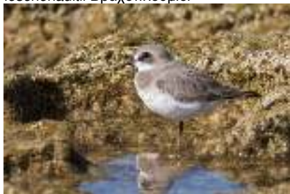
Greater Sandplover, Paphos Headland, 31 st January.

GREATER SANDPLOVER Charadrius leschenaultii Βραχοπλουμιδι