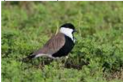
Spur-winged Lapwing, Paphos Sewage Plant.