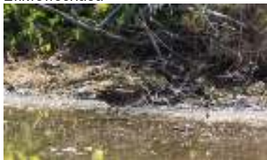
Spotted Crake, Paralimni Lake, 27 th March.

Agia Varvara 1 31-Mar CDL Paralimni Salt Lake 1 27-Mar JS