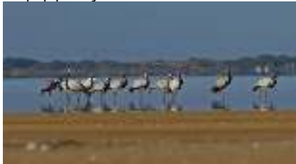
Demoiselle Crane, Akrotiri Salt Lake, 11 th March.

Akrotiri Gravel Pits 72 flying over 9:25am 12-Mar KH Akrotiri Salt Lake 17 11-Mar KH Akrotiri Salt Lake c25 7:30am 12-Mar KH