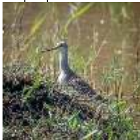
Spotted Redshank, Phasouri Reed-beds, 19 th March.

Akrotiri Salt Lake 1 19-Mar KH Bishop's Pool 1 19-Mar KH Larnaca Sewage Works 1 24-Mar LAC Oroklini Marsh 1 25-Mar LAC Phasouri Reed Beds 1 18, 19 & 20-Mar IKB/DJW/MH/RAT Silver Beach, Famagusta 1 non-breeding plum 21-Mar CR