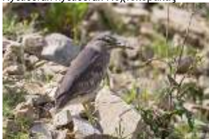
Black-crowned Night Heron, Mavrokolymbos Dam, 27 th March.