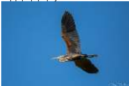
Purple Heron, Paphos Headland, 21 st March.