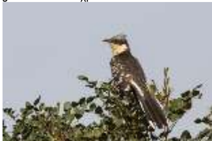
Great Spotted Cuckoo, Mavrokolymbos Dam, 27 th March.