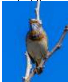
Bluethroat, Mandria, 11 th March.