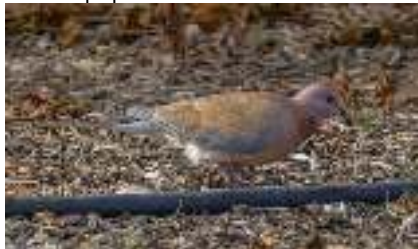
Laughing Dove, Coral Bay, 3 rd March.