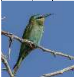
Blue-cheeked Bee-eater, Paphos Headland, 20 th March.