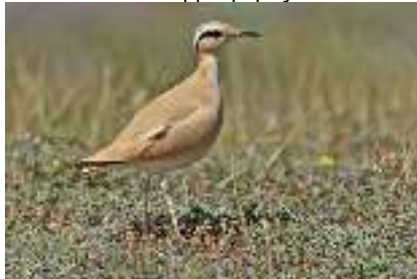
Cream-coloured Courser, Akrotiri Gravel Pits, 26 th March.