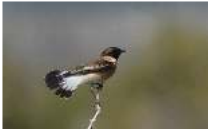
Northern Caspian Stonechat, Akrotiri Gravel Pits, 19 th March.

Saxicola torquatus hemprichii Καστική Παπαθκιά