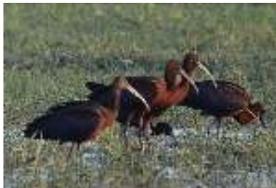
Glossy Ibis, Phasouri Reed-beds.