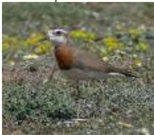
Caspian Plover, Mandria, 14 th March.

Akrotiri Salt Lake 1 male 21 & 26-Mar KH/CI/HE Rare Bird Report requested Mandria 1 14 & 15-Mar VT/CR/LAC/AWh/MP/JN/TRe/JS Rare Bird Report required Zakaki Marsh 1 adult in winter plumage - very good and quite close views 7-Mar JN/IKB Rare Bird Report received