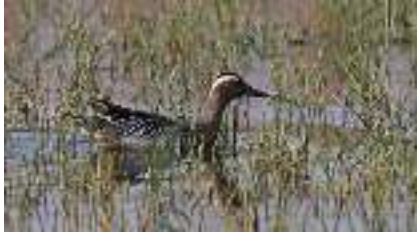
Garganey, Phasouri Reed-beds, 20 th March.