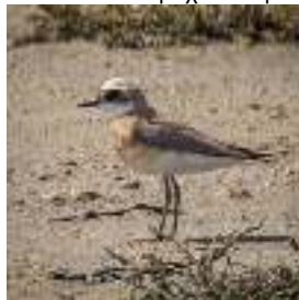
Greater Sandplover, Akrotiri Gravel Pits, 19 th March.