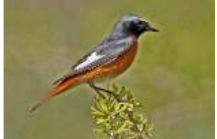
Ehrenberg's Redstart, Lady's Mile 18 th March.

EHRENBERG'S REDSTART Phoenicurus phoenicurus samamisticus Ασιατικός Κοτσινονούρης