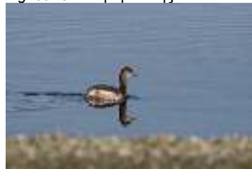
Black-necked Grebe, Larnaca Sewage Works, 15 th March.