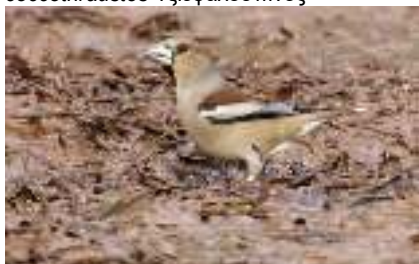
Hawfinch, Mandria, 8 th March.

HAWFINCH Coccothraustes . coccothraustes Τζιειραλόσπινος