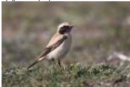
Desert Wheatear, Timi Beach, 20th March.

Akrotiri Gravel Pits 1 20 & 26-Mar RC/LAC Anarita Park 1 27-Mar TF Cape Drepanum 1 female 21 & 22-Mar JWa Cape Greco 1 17 & 23-Mar FB per MSS/JS Lady's Mile 3+ 2 or 3 males and 1 female 23-Mar TRe Mandria 1 Male 7-Mar JS Mandria 1 female 24 & 25-Mar JWa/PFo/AWh Paphos Beach 1 fem. Also on 23rd March 21-Mar JoD Paphos Headland 1 female 26-Mar KH Timi Beach 2 1m and 1f 20 & 23-Mar JoD/VT Timi Beach 1 21, 22, 23, 25 & 26-Mar LAC/JWa/JS/TRe/AWh/IKB/VT/CR/RoD/KH Zakaki Marsh 1 female 24-Mar KH