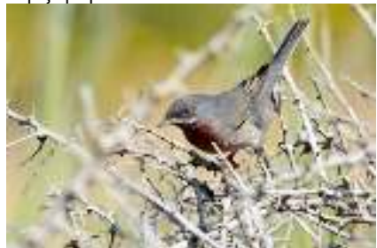
Subalpine Warbler, Cape Greco, 14 th March.

SUBALPINE WARBLER Sylvia cantillans Γκριζοφτέρι