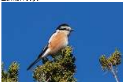
Masked Shrike, Troodos, 26 th March.

Earliest reports and largest counts: Almirolivado 3 2m and 1f 22-Mar JS Androlikou 2 25-Mar IKB Cape Greco 1 5-Mar StM Karpasia Peninsula 2 Road from Koca Reis hotel to Cape Andreas 31-Mar JS Livadi tou Pashia 2 pair 28-Mar CR/BirdLife Austria Milomeri Waterfalls, Pano Platres 3 1 male seen, then in song on wire, joined by female and 1 other male in flight up the track 31-Mar JN Potamia 2 25-Mar FGe Prastio Kellakiou 1 Male - on breeding territory 11-Mar JS Rizokarpasos to Cape Andreas 1 10-Mar CC/MC