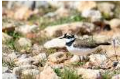
Little Ringed Plover, Cape Greco.