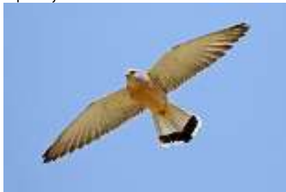
Lesser Kestrel, Anarita Park, 31 st March.

Earliest reports and max count per location: Anarita Park 2 m,f 17 & 19-Mar CR/MSS Anarita Park 17 on power lines 26-Mar CR/BirdLife Austria Asprokremmos Dam 4 23-Mar VT Cape Greco 2 Males 23-Mar JS Karpasia Peninsula c17 groups of 4 and 6 and seven falcons gaining height prob this species. Road from Koca Reis hotel to Cape Andreas 31-Mar JS Kivisili 13 30-Mar VT Mandria 3 edge of village 23-Mar JoD Mavrokolymbos Dam 1 23-Mar MP