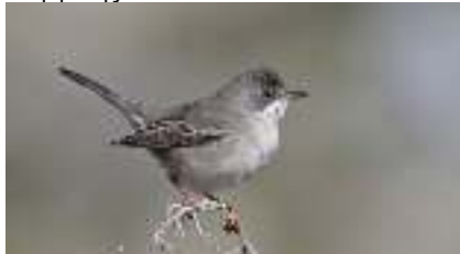
Ruppell's Warbler, female, Akrotiri, 17 th March.