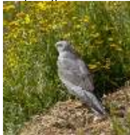
Pallid Harrier, Anarita Park, 26 th March.