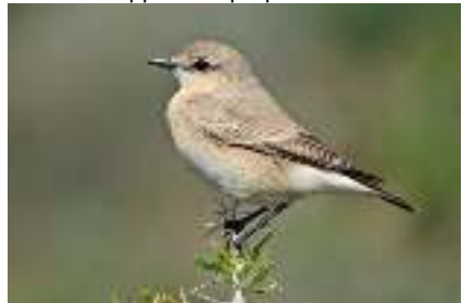
Isabelline Wheatear, Lady's Mile, 1 st March.