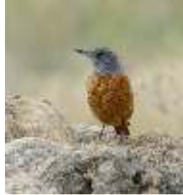
Rufous-tailed Rock Thrush, Paphos Headland, 29 th March.

RUFIOUS-TAILED ROCK THRUSH Monticola saxatilis Πετροκότσυφος