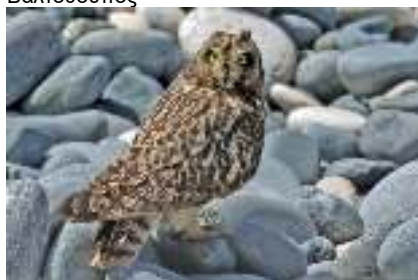
Short-eared Owl, Akrotiri Gravel Pits, 21 st March.

SHORT-EARED OWL Asio flammeus Βαλτόθουπος