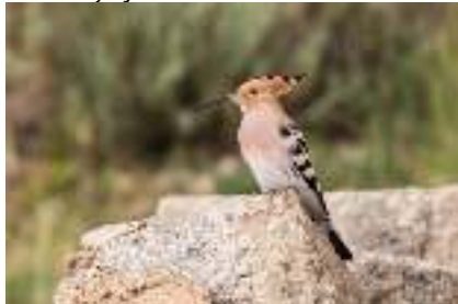
Common Hoopoe, Paphos Headland, 27 th March.

166 reports of this species received for March. Largest counts: