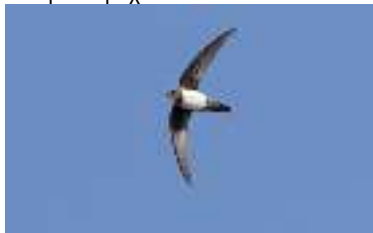
Alpine Swift, Kensington Cliffs, 11 th March.