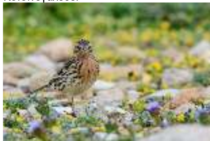
Red-throated Pipit, Paphos Headland, 20 th March.