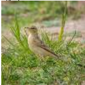
Tawny Pipit, Mandria, 10 th March.