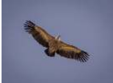
Griffon Vulture, Kensington Cliffs, 19 th March.

Amargeti – Xeros Potamos valley 1 over Kelokedara 16-Mar CR Kensington Cliffs 7 13-Mar IKB Kensington Cliffs 8 19-Mar RAT Kensington Cliffs 2 22 & 31-Mar MSS/HST Kensington Cliffs 3 26-Mar VT Kensington Cliffs 1 preening on ledge 27-Mar CR/BirdLife Austria Troodos 1 soaring over the hillside SE of village, missing 2 primary feathers in right wing 31-Mar JN