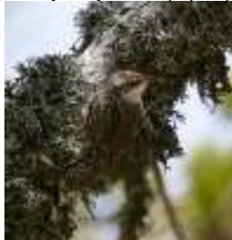
Short-toed Treecreeper, Troodos, 2 nd March.

Almirolivado 1 1-Mar JS Livadi tou Pashia 1 22 & 31-Mar JS/JN Livadi tou Pashia 2 28-Mar CR/BirdLife Austria