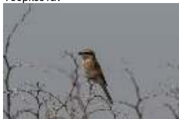
Red-tailed Shrike, Kiti, 19 th March.

Lanius phoenicurioides Κεφαλάς του Τουρκεστάν