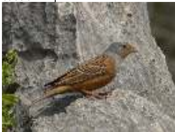
Cretzschmar's Bunting, Anarita Park, 6 th March.

CRETZSCHMAR'S BUNTING Emberiza caesia Σιταροπούλλι