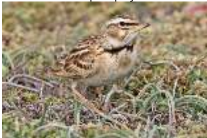
Bimaculated Lark, Akrotiri Gravel Pits, 15 th March.