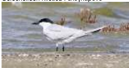
Common Gull-billed Tern, Lady's Mile, 16 th March.

Akrotiri Salt Lake 22 22-Mar MSS Akrotiri Salt Lake 1 29-Mar KH Kiti to Petounta Road 2 Prob this species along coast 19-Mar JS/CR Lady's Mile 1 16-Mar TRe Mandria 1 flying over potato fields 19-Mar MSS Pervolia 4 Flying along coast heading E 17-Mar JS Timi Beach 1 east 23-Mar CR Zakaki Run-off 30 22-Mar RoD