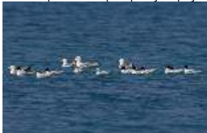
Mediterranean Gull, Akrotiri Bay, 6 th March.

MEDITERRANEAN GULL Larus melanocephalus Μαυροκέφαλος Γλάρος