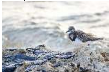
Ruddy Turnstone, Paphos Headland, 19 th March.

Paphos Headland 3 2-Mar CR Paphos Headland 4 7 & 24-Mar JS/TF Paphos Headland 2 15-Mar IKB