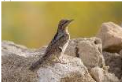
Eurasian Wryneck, Paphos Headland, 25 th March.