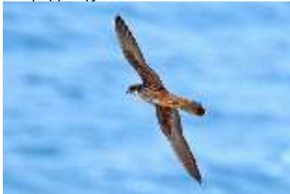
Eleonora's Falcon, Kensington Cliffs, 2 nd May.

Max counts per location: Akoursos area 1 5-May JH Akrotiri Gravel Pits 1 2, 4 & 9-May JS/TRe/JE Akrotiri marsh 1 24-May ABW Akrotiri Salt Lake 6 Eastern edge/Zakaki run off 18-May TRe Bishop's Pool 2 18-May DJW Cape Greco 1 23-May JS Karpasia Peninsula 1 Kleides area 19- May JS Kensington Cliffs 25 on arrival 14 on cliff face and 11 in flight, thereafter difficult to assess numbers accurately 25-May JN Marathounta 1 over valley, fem 8-May CR Mousere 1 25-May DJW Old Kivides village fire trail area 1 hunting dark morph 26-May JN Petra tou Romiou area 3 10-May JS Souni 1 hunting, mobbed by Barn Swallows 9-May JN Troodos 12 18-May RAT