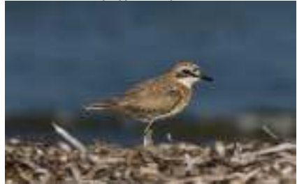
Greater Sandplover, Spiros Beach, 15 th May.

Akrotiri Salt Lake 1 2 & 3-May JS/VT Lady's Mile 1 4-May TRe Spiros Pool 1 Also seen on beach later in day 15-May JS