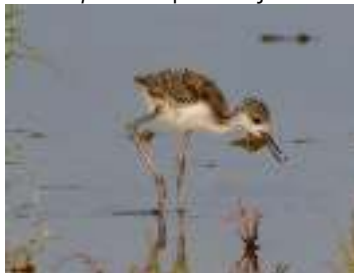
Black-winged Stilt chick, Akrotiri Salt Lake, 29 th May.