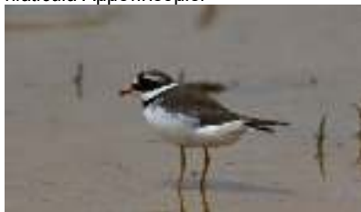
Common Ringed Plover, Akrotiri Salt Lake, 7 th May.