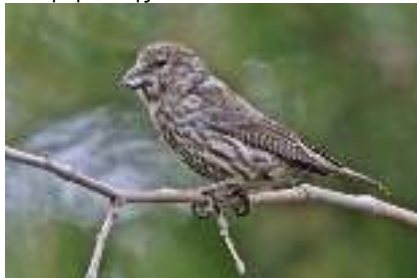
Red Crossbill juvenile, Troodos, 7 th May.

Troodos 1f 2 juv 7-May JE Troodos 1f 29-May JE