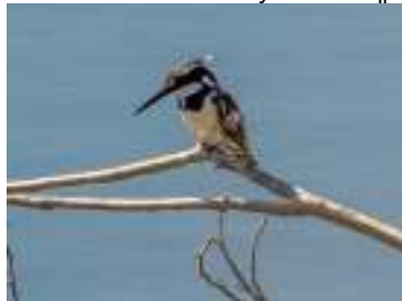
Pied Kingfisher, Argaka Dam, 17 th May.