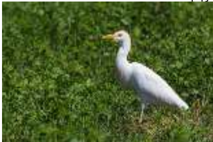
Cattle Egret, Paphos Sewage Plant, 15 th May.

Largest counts: Fresh Water Lake South c850 267 nests 18-May JH