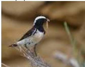
Cyprus Wheatear, Paphos, 28 th May.

120 reports received for this species during May. Largest counts: