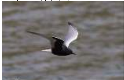
White-winged Tern, Mavrokolymbos Dam, 15 th May.