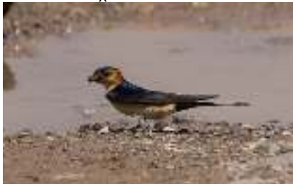
Red-rumped Swallow, Nata, 11 th May.