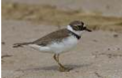
Little Ringed Plover, Akrotiri Salt Lake, 7 th May.