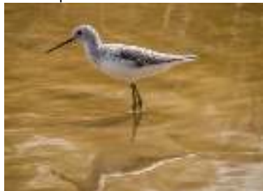
Marsh Sandpiper, Akhna Dam, 4 th May.

MARSH SANDPIPER Tringa stagnatilis Βαλτονεραλλίδι