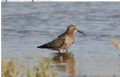
Curlew Sandpiper, Akrotiri Salt Lake, 24 th May.

Akrotiri Salt Lake east (run-off) 15 3-May CR