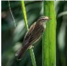
Sedge Warbler, Goudi, 14 th May.

Akhna Dam 1 Seen 3-May JS Goudi 1 14-May RAT Partenitis Dam 2 13-May SC with A Kirschel Phasouri Reed Beds 1 12-May DJW/JN Polis Reed beds 7 3-May UKRG Polis Reed beds 19 7-May UKRG Polis Reed beds 25 10-May UKRG Polis Reed beds 24 12-May UKRG