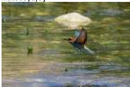
European Bee-eater, Agia Varvara, 15 th May.

140 reports of this species received for