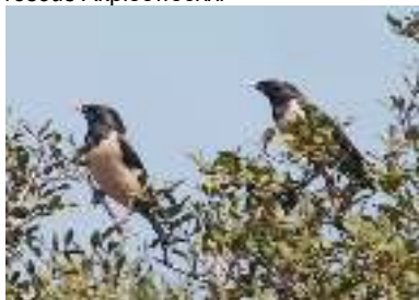
Rose-coloured Starling, Karpasia, 11 th May.