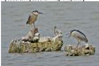
Black-crowned Night Heron, Akhna Dam, 22 nd May.