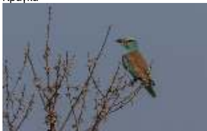
European Roller, Agios Phylonas, 19 th May.