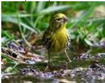
European Serin, Troodos, 3 rd May.