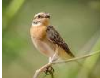
Whinchat, Evretou Dam, 6 th May.

Largest counts and latest records: Akrotiri Gravel Pits 3 5-May JE Akrotiri Gravel Pits 1 18-May PA Akrotiri Salt Lake 1 Eastern edge/Zakaki Marsh run off 21-May TRe Arodes 4 10-May DJW Vretsia 3 5-May LAC