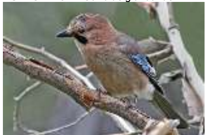
Eurasian Jay, Troodos, 29 th May.