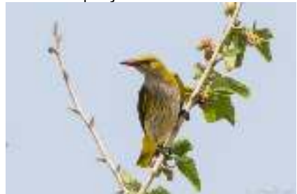
Eurasian Golden Oriole, Androlikou, 2 nd May.

Agios Phylonas, Karpasia 1 19-May JS Akrotiri Gravel Pits 1 female 7-May TRe Androlikou 9 2-May DJW Androlikou 5 10-May DJW Androlikou 2 Males in flight 11-May JS Asprokremmos Dam 8+ 2-May LAC