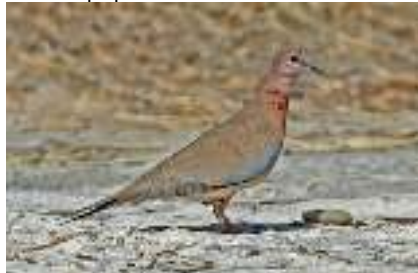
Laughing Dove, Kouklia, 28 th May.