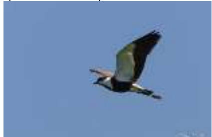
Spur-winged Lapwing, Paphos Sewage Plant, 15 th May.