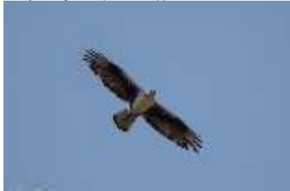
Bonelli's Eagle, Androlikou, 10 th May.

Akrotiri Salt Lake 1 15-May TRE Anarita Park 2 ads 1 & 15-May CR/JE Anarita Park 1 imm 11-May JE Androlikou 3 10-May DJW Asprokremmos Dam 1 adult 15-May DJW Episkopi, Ezousas Valley 2 very high 23- May CR Mandra tou Kampiou East 1 Adult carrying a Chukar chick and being aerially harassed by a Goshawk 28-May FGe near Akoursos 1 21-May LAC Paphos Sewage Plant 1 juv 11-May CR Pegeia 1 9-May JH