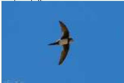
Alpine Swift, Mousere, 25 th May.

Anavargos 1 15-May CR Kannaviou 6 5-May DJW Karpasia Peninsula 1 Kleides area 19-May JS Kensington Cliffs 2 2, 15 & 22-May JE/REW Kensington Cliffs 4 14-May JE Kensington Cliffs 5 Incl 2 flying into downward opening crevice ? Nest 15-May MGr Kensington Cliffs 6 17-May CR Kensington Cliffs 16 on arrival 14 seen in flight around cliff faces and 2 in flight over the sea 25-May JN Mandria 1 9-May CR Mandria Village 2 13-May LAC Mousere 5 25-May DJW Petra tou Romiou area 3 10-May JS