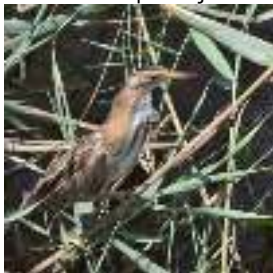
Common Little Bittern, Phasouri Reed-beds, 25 th May.