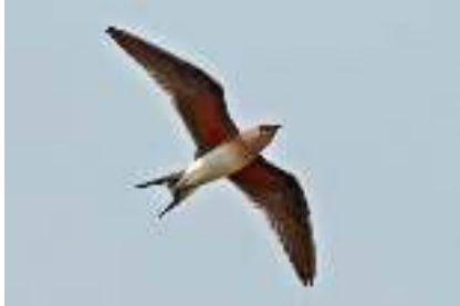
Collared Pratincole, Achna Dam, 22 nd May.

COLLARED PRATINCOLE Glareola pratincola Νεροχελιδόνο