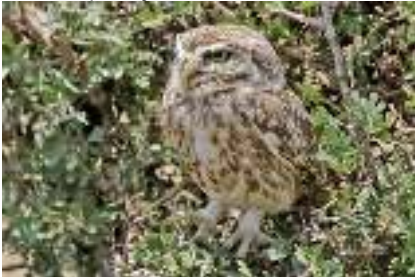
Little Owl, Anarita Park, 28 th May.

Largest counts: Agios Filonas, Karpasia 4 Ads. One with grasshopper in bill 19-May JS Anarita Park 3 2 juv and 1 ad 10-May LDz