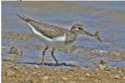
Common Sandpiper, Akhna Dam, 18 th May.

COMMON SANDPIPER Actitis hypoleucos Ακτίτης