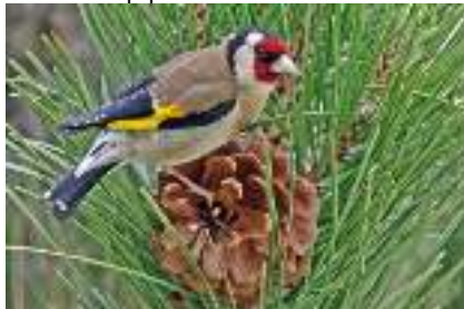
European Goldfinch, Troodos, 24 th May.