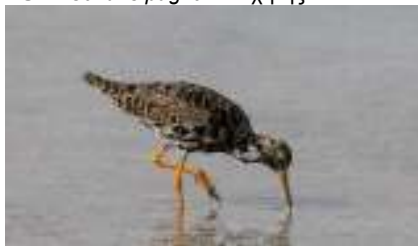
Ruff, Lady's Mile, 2 nd May.