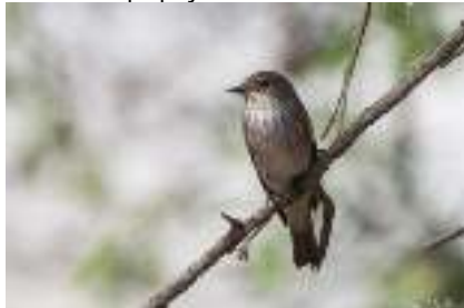
Spotted Flycatcher, Pittokopos, 10 th May.