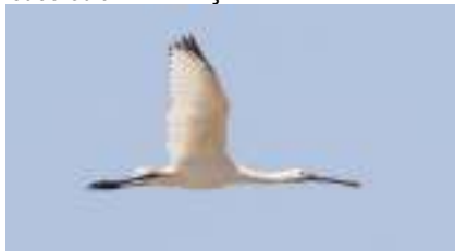
Eurasian Spoonbill, Akrotiri Salt Lake, 31 st May.

Akrotiri Salt Lake 1 Eastern edge/Zakaki run off 31-May TR