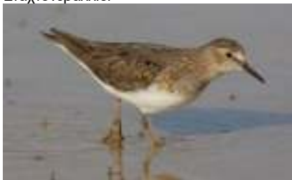
Temminck's Stint, Akrotiri Salt Lake, 1 st May.