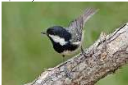
Coal Tit, Troodos, 7 th May.