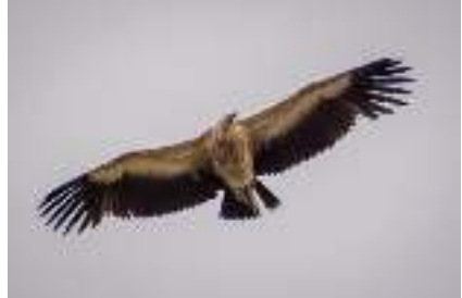
Griffon Vulture, Kensington Cliffs, 4 th May.

Kensington Cliffs 3 4-May RAT Kensington Cliffs 6 all sitting on 2 ledges 17-May CR Kensington Cliffs 5 19-May PA Kensington Cliffs 2 together on ledge, one sitting (on nest?) 29-May ABW Mousere 3 25-May DJW Sotira 6 18-May DJW Souni 1 overflying towards NE from S 9- May JN Vretsia 3 5-May DJW