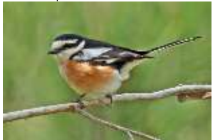
Masked Shrike, Troodos, 7 th May.