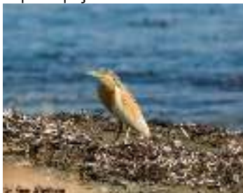
Squacco Heron, Larnaca Airport Coast, 9 th May.

Largest counts: Akrotiri Salt Lake 7 17-May CR Fresh Water Lakes 14 Eight nests seen with incubating ads on. One ad seen carrying nesting material 18-May JS/JH/MC/CC Larnaca Airport Coast 12 Resting on beach 9-May JS