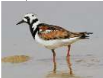
Ruddy Turnstone, Akrotiri Salt Lake, 7 th May.

Akrotiri Salt Lake 1 7, 23, 24 & 25-May TRe/JS/JE/CR