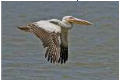
Great White Pelican, Akhna Dam, 18 th May.

Agia Varvara 1 11-May JE Akhna Dam 1 18-May JE Akrotiri Salt Lake 1 15-May TRE Evretou Dam 1 5, 6 & 10-May CR/JH/MSS