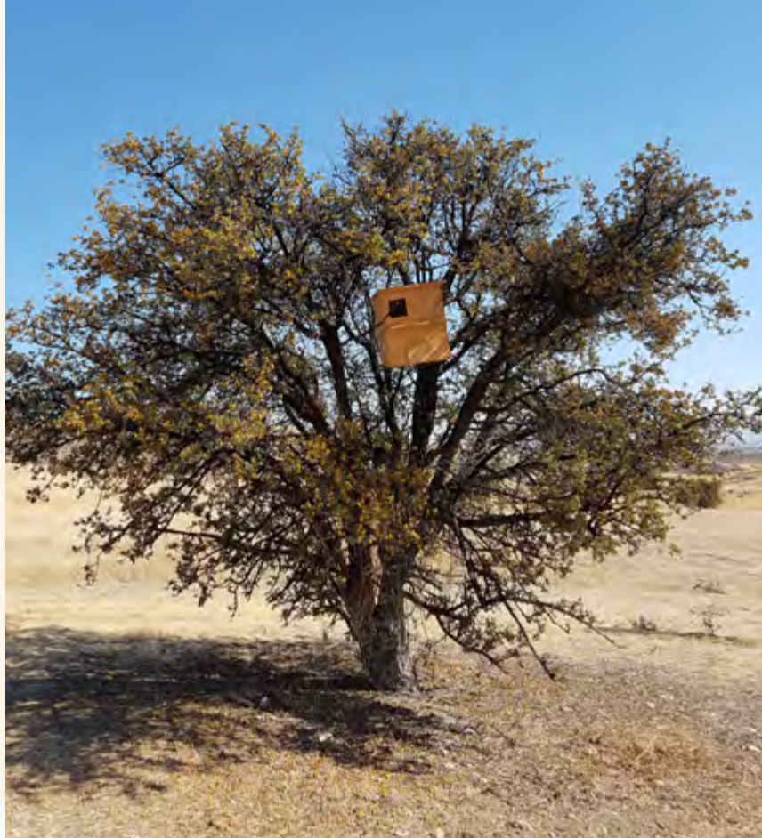
Barn Owl nest box

Furthermore, we organized a number of visits and meetings in villages and engaged with interested farmers. In total, we installed 27 nest boxes in various farmland areas of Cyprus and in collaboration with farmers who showed interest in using Barn Owls to control rodent population naturally.