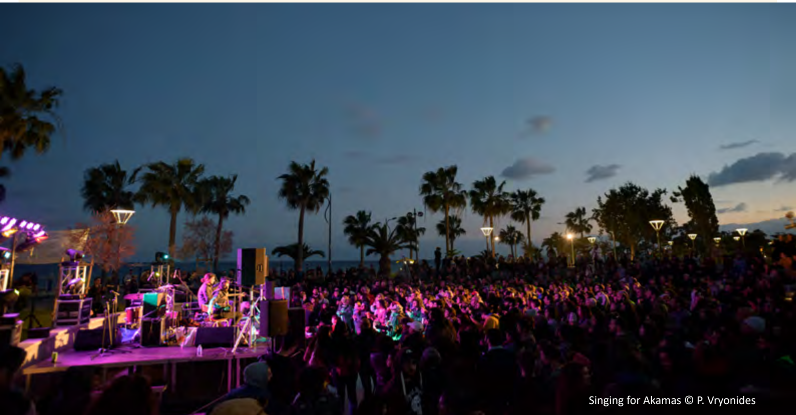
Singing for Akamas

Undoubtedly, 2017 will be a year of major and important developments for Akamas Peninsula. BirdLife Cyprus will continue its fight for the protection and preservation of this area.