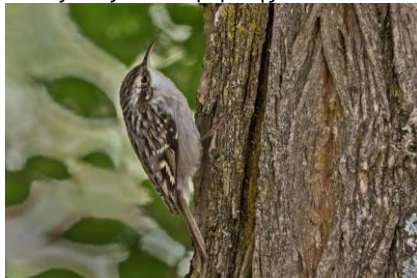
Short-toed Treecreeper, Troodos, 8 th October.

Almyrolivado picnic area, Giant Junipers 2 18-Oct CR