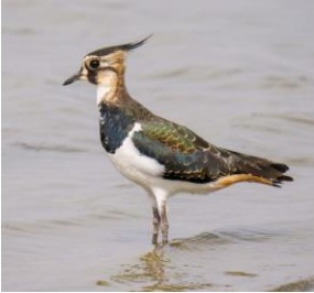
Northern Lapwing, Kouklia Dam, 13 th October.

Akrotiri Gravel Pits 1 14-Oct JE Akrotiri Marsh (Phasouri Reed-beds) 9 31-Oct FM Kouklia Dam, Famagusta 13 16-Oct CR Larnaca Sewage Works 1 19-Oct SC/BC field trip/LAC Mandria Beach 18 28-Oct LAC Syngراسi Dam 1 16-Oct CR