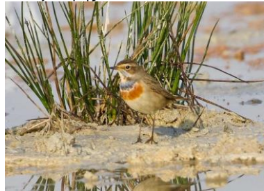
Bluethroat, Akrotiri Salt Lake, 14 th October.