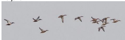
Northern Shoveler, Akrotiri Salt Lake, 15 th October.

NORTHERN SHOVELER Spatula clypeata Σαξάνα