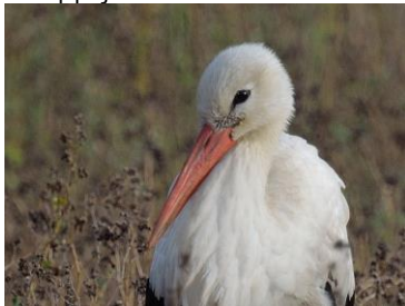
White Stork, Akrotiri Marsh, 11 th October.

WHITE STORK Ciconia ciconia Λευκός Πελαργός