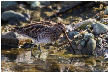
Common Snipe, Agia Varvara, 21 st October.

Akrotiri Salt Lake 40+ 17:15 - 18:00 Came to bathe in pool near reeds at run off 11-Oct JS Lady's Mile 20+ 11-Oct JS