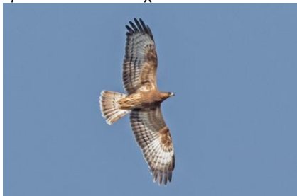
European Honey Buzzard, Phasouri, 2 nd October. Photograph by John East.

Achna Dam 1 12-Oct FGe Akamas offshore 1 juv 8-Oct AG Kouklia Dam 2 13 & 18-Oct IKB/LAC Kouklia Dam 1 15 & 16-Oct IKB/CR Larnaca Sewage Works 1 Flew over heading W 20-Oct JS Phasouri Bee-hives 1 10-Oct ADT