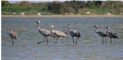
Common Crane, Kouklia Dam, 13 th October.

Agia Varvara 53 flying high east 11-Oct CR