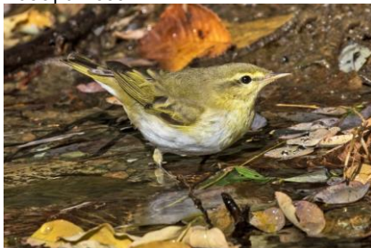
Wood Warbler, Troodos, 18 th October.

Almyrolivado picnic area, Giant Junipers 1 18-Oct CR Troodos 1 3, 8, 16 & 18-Oct JE