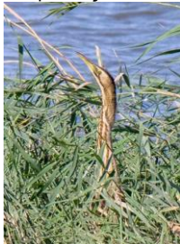
Eurasian Bittern, Kouklia Dam, 13 th October.

Agia Varvara 1 flushed from reeds near ford 24-Oct CR Kouklia Dam, Famagusta 1 13-Oct IKB Limassol to Zygi coast 2 migrating over sea. Seen from boat 10-Oct AG