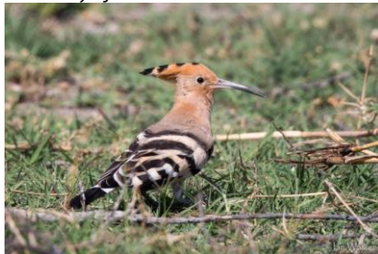
Common Hoopoe, Asprokremmos Dam, 6 th October.

Achna Dam 2 12-Oct FGE Armou Hills 1 20-Oct IKB Asprokremmos Dam 2 6-Oct DJW Evretou Dam 1 13-Oct RAT Kouklia Dam 1 14-Oct IKB Mandria 2 7-Oct CR