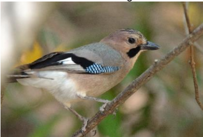
Eurasian Jay, October 2019.

Akhna Dam 5 three adults and two juveniles 7-Sep FGe Armou Hills 4 ads,juvs 1 & 4-Sep CR Karpasia 10 5-Sep NCP