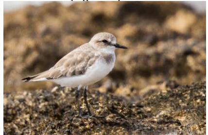
Greater Sandplover, Paphos Headland, 11 th October.