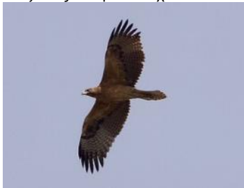
Bonelli's Eagle, Akrotiri Gravel Pits, 22 nd October.

LESSER SPOTTED EAGLE Clanga pomarina Κραυγαετός Akrotiri Salt Lake pluto masts 1 dark juv, over trees 14:20h, then dropped out of sight 2-Oct CR