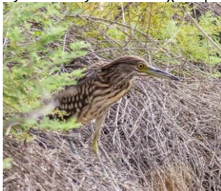
Black-crowned Night Heron juv, Kouklia Dam. 15 th October.

Asprokremmos Dam 1 27-Oct AFo Bishop's Pool 3 subads 15-Oct CR Fresh Water Lake 1 Juv 4-Oct JS Kouklia Dam, Famagusta 1 15-Oct IKB Kouklia Dam, Famagusta 9 28-Oct DJW Latchi Harbour 1 in off late in day 7-Oct AG Oroklini Marsh 1 imm in flight at dusk 18- Oct JWa Potamia Riverbed 2 5-Oct FGe Pyla 11 14-Oct IKB Zakaki Marsh 1 23-Oct FM Zygi Harbour 1 Heard early am 11-Oct AG