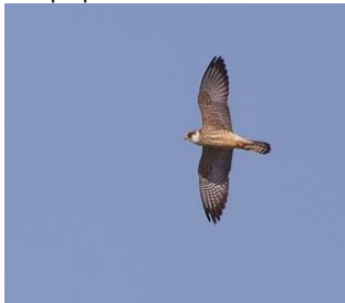
Red-footed Falcon, Akrotiri Salt Lake, 9 th October.