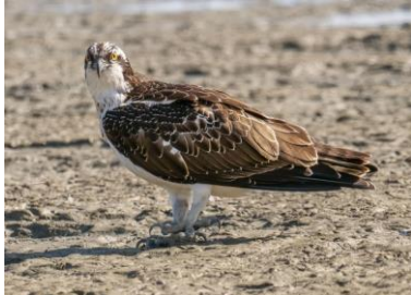
Osprey, Kouklia Dam, 13 th October.

Achna Dam 1 12-Oct FGe Akamas offshore 1 juv 8-Oct AG Kouklia Dam 2 13 & 18-Oct IKB/LAC Kouklia Dam 1 15 & 16-Oct IKB/CR Larnaca Sewage Works 1 Flew over heading W 20-Oct JS Phasouri Bee-hives 1 10-Oct ADT