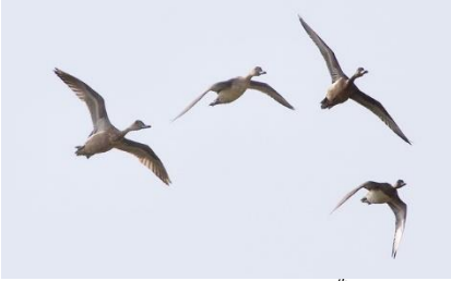
Northern Pintail, Akrotiri Marsh, 16 th October.