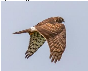
Hen Harrier, Kouklia Dam, 18 th October.

102 reports received for this species for Oct. Largest counts: Akrotiri peninsula 17 4-Oct ADT Phasouri Bee-hives 50 11-Oct LAC