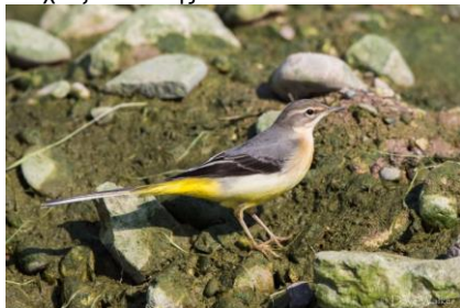
Grey Wagtail, Agia Varvara, 21 st October.