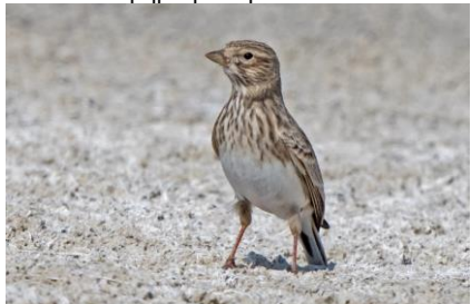
Lesser Short-toed Lark, Akrotiri Salt Lake, 23 rd October.

Akrotiri Salt Lake 1 maybe two 23-Oct SS/TRe/JS/ABW