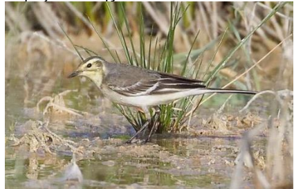
Citrine Wagtail, Akrotiri Salt Lake, 10 th October.

Akrotiri Salt Lake 1 Zakaki run-off 9-Oct TRe Akrotiri Salt Lake 2 1f and 1 juv. Zakaki run-off 10-Oct TRe Mandria 1 13 & 16-Oct AG Paphos Headland 1 8-Oct AG