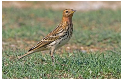
Red-throated Pipit, Akrotiri Marsh, 31 st October.

RED-THROATED PIPIT Anthus cervinus Κοτσινόγαλούδι