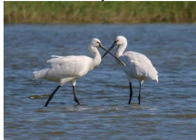
Eurasian Spoonbill, Kouklia Dam, 13 th October.

EURASIAN SPOONBILL Platalea leucorodia Κουταλάς