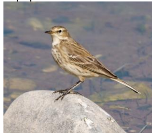
Water Pipit, Agia Varvara, 31 st October.

WATER PIPIT Anthus spinoletta Νερογαλούδι