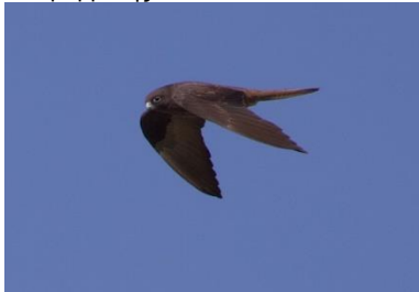
Eleonora's Falcon, Akrotiri Salt Lake, 3 rd October.