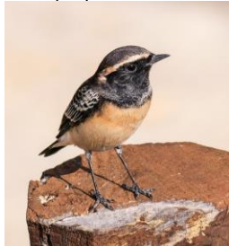
Cyprus Wheatear, Paphos, 22 nd October.

CYPRUS WHEATEAR Oenanthe cypriaca Σκαλιφούρτα