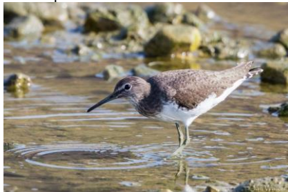
Green Sandpiper, Agia Varvara, 21 st October.