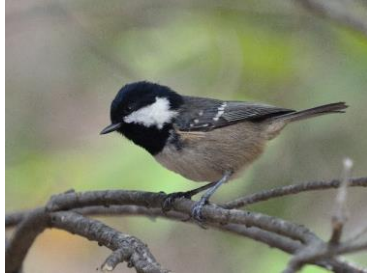
Coal Tit, October 2019.

Almyrolivado picnic area, Giant Junipers 20 18-Oct CR Artemis Trail 19 31-Oct AFo Livadi tou Pashia 16 31-Oct DJW Lythrodontas dam 12 5-Oct FGe Mandra tou Kampiou East 11 5-Oct FGe Panagia Picnic Site 10 13-Oct ABW Platania 4+ 29-Oct JS