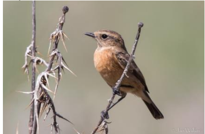
European Stonechat, Asprokremmos Dam, 6 th October.