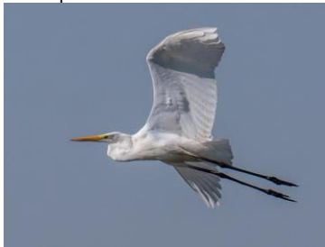
Great White Egret, Kouklia Dam, 13 th October.