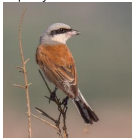
Red-backed Shrike, Androlikou, 12 th October.

Achna Dam 2 one female and one late hatched juvenile 12-Oct FGe Anarita Park 1 1stW 11-Oct CR Armou Hills 1 juv 4-Oct CR Karpasia Peninsula 2 Juvs. Road to Cape Andreas tip 5-Oct JS Karpasia Peninsula 1 juv. Around Koca Reis hotel 6-Oct JS Lady's Mile 1 Juv 11-Oct JS Mandria 1 2-Oct PSm Nicosia Airport UN Buffer Zone 1 19-Oct FGe Paphos Headland 1 juvenile 29-Oct LAC Paphos Sewage Plant 1 19-Oct IKB