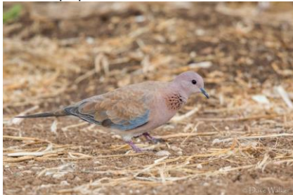
Laughing Dove, Mandria, 14 th October.