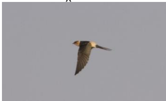
Red-rumped Swallow, Akrotiri Salt Lake, 2 nd October.