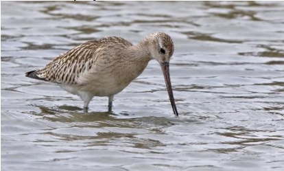
Bar-tailed Godwit, Akrotiri Gravel Pits, 23 rd October.

BAR-TAILED GODWIT Limosa lapponica Θαλασσολιμόζα