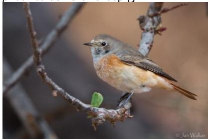
Common Redstart, Mavrokolymbos Dam, 25 th October.

Agios Georgios, Pegeia 3 28-Oct AFO Asprokremmos Dam 1 30-Oct AFO Kamares (Tala) 1 female 30-Oct DJW Mandria Beach 1 31-Oct LAC Panagia tou Sinti 2 fems 27-Oct CR Paphos Headland 1 22, 25 & 29-Oct IKB/LAC Phasouri Bee-hives 2 25-Oct FM Souskiou 1 male 31-Oct DJW