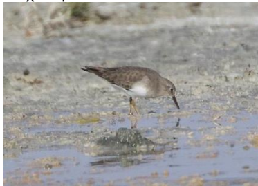
Temminck's Stint, Akrotiri Salt Lake, 3 rd October.