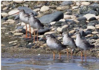
Spotted Redshank, Akrotiri Gravel Pits, 11 th October.

Akrotiri Gravel Pits 12 together in mixed flock with Greenshanks 5-Oct SC with L Sergides