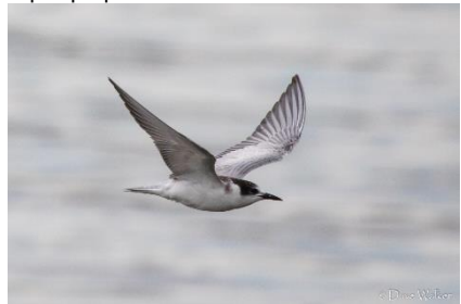
Whiskered Tern, Kouklia Dam, 28 th October.

WHISKERED TERN Chlidonias hybrid Λιμνογλάρονο