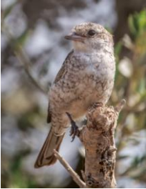
Masked Shrike juv, Paphos Sewage Plant, 19 th October.

Akhna Dam 5 three adults and two juveniles 7-Sep FGe Armou Hills 4 ads,juvs 1 & 4-Sep CR Karpasia 10 5-Sep NCP