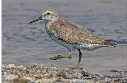
Red Knot, Akrotiri Gravel Pits, 19 th October.

RED KNOT Calidris canutus Κοκκινονεραλλίδι