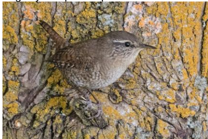
Northern Wren, Troodos, 3 rd October.