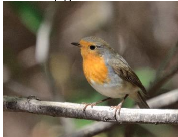
European Robin, October 2019.