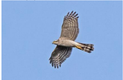
Eurasian Sparrowhawk, Phasouri, 5 th October.

LEVANT SPARROWHAWK* Accipiter brevipes Σαΐνι Akrotiri Salt Lake 1 juv. North side 15-Oct AG/VT Rare bird report required