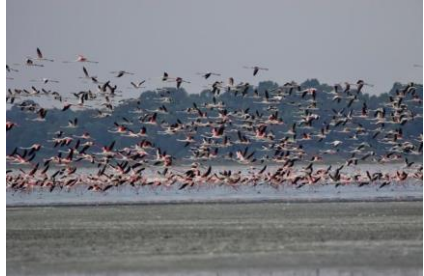
Greater Flamingo, Akrotiri Salt Lake, 16 th October.

Kouklia Dam 2 21-Oct LAC Kouklia Dam 1 28-Oct DJW Larnaca Sewage Works 2 17-Oct AG Larnaca Sewage Works 1 near breeding plumage 19-Oct SC/BC field trip/LAC