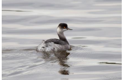
Black-necked Grebe, Kouklia Dam, 28 th October.

Larnaca Sewage Works 2 18, 19 & 20-Oct JS/SC/BC field trip