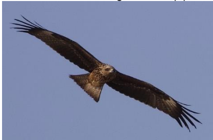
Black Kite, Akrotiri Gravel Pits, 22 nd October.

Agia Varvara 1 30-Oct DJW Akrotiri Gravel Pits 1 2 & 22-Oct CR/TRe Akrotiri Marsh (Phasouri Reed-beds) 1 13-Oct RoB Akrotiri peninsula 1 Raptor count 1-Oct ADT Akrotiri peninsula 4 Raptor count 4-Oct ADT Akrotiri Salt Lake 3 2-Oct CR Bishop's Pool 3 at roost early am 21-Oct VT Bishop's Pool 1 Juvenile 31-Oct JS/APL Mandria Beach 1 6-Oct LAC/DJW Marathounta 1 over Konia direction 13- Oct CR Phasouri Bee-hives 4 4-Oct LAC Phasouri Bee-hives 7 9-Oct LAC Phasouri Bee-hives 1 16 & 19-Oct FM/JS