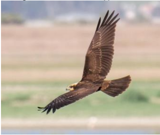
Western Marsh Harrier, Kouklia Dam, 13 th October.

102 reports received for this species for Oct. Largest counts: Akrotiri peninsula 17 4-Oct ADT Phasouri Bee-hives 50 11-Oct LAC