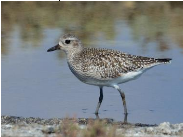
Grey Plover, Akrotiri Gravel Pits, Oct 2019.