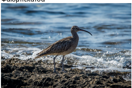
Whimbrel, Paphos Headland, 6<sup>th</sup> November.

Paphos Headland 1 6, 7, 10 & 17-Nov RAt/IM/CR