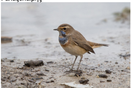
Bluethroat, Evretou Dam, 14<sup>th</sup> November.

BLUETHROAT Cyanecula svecica Γαλαζολαίμης