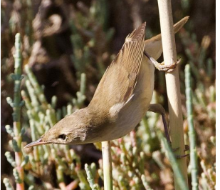
Eurasian Reed Warbler, Zakaki Marsh, 5<sup>th</sup> November.

Acrocephalus scirpaceus Καλαμομουγιανούδι