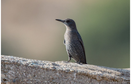
Blue Rock Thrush, Phinikas, 15<sup>th</sup> November.