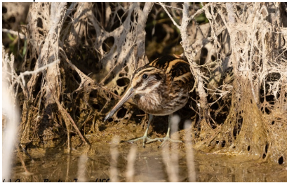
Jack Snipe, Zakaki Marsh, 8<sup>th</sup> November.

Agia Varvara 1 4, 10, 11 & 29-Nov NA Kouklia Dam 6 all flushed from northern canal inflow 13-Nov CR Oroklini Marsh 1 with the 2 common snipe 23-Nov LAC Phasouri Reed-beds 1 3 & 4-Nov CR/JS Zakaki Marsh 1 8-Nov JS