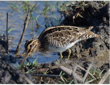
Common Snipe, November.

Largest counts: Agia Varvara, motorway bridge soakaways 17 27-Nov CR Akrotiri Marsh (Phasouri Reed-beds) 10+ 22-Nov TRe Lower Ezousas 10 21-Nov IKB Mia Milia Water Treatment Plant 10 17-Nov IKB Oroklini Marsh 20 Exact count not roundup 26-Nov JS/VT