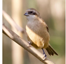
Eurasian Penduline Tit, Akrotiri Marsh, 12<sup>th</sup> November.