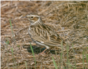
Woodlark, Paphos Headland, 5<sup>th</sup> November.