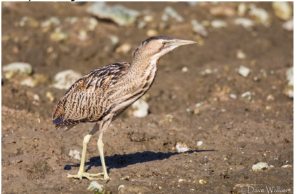
Eurasian Bittern, Agia Varvara, 19<sup>th</sup> December.

Agia Varvara 1 17, 18, 19, 20, 24, 25, 27 & 28-Nov NA/CR/LAC/DJW/IKB/RAt Agia Varvara 2 23-Nov DJW Akrotiri Marsh (Phasouri Reed-beds) 1 29-Nov TRe Lower Ezousas 1 25-Nov IKB Zakaki Marsh 1 18-Nov LAC