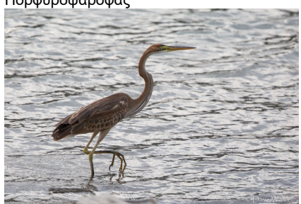
Purple Heron, Evretou Dam, 14<sup>th</sup> November.

Evretou Dam 1 14-Nov DJW Paphos Sewage Plant 1 juv 7 & 8-Nov CR/NA