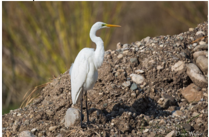
Great White Egret, Agia Varvara, 23<sup>rd</sup> Novemebr.

Largest counts: Asprokremmos Dam 3 26-Nov CR Fresh Water Lake North 3 14-Nov CR Kouklia Dam 5 13 & 14-Nov CR Mia Milia Water Treatment Plant 3 16-Nov JS/CC/MC Pool outside Mia Milia 4 17-Nov IKB