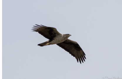
Bonelli's Eagle, Evretou Dam, 14<sup>th</sup> November.