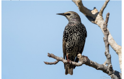
Common Starling, Paphos Headland, 28<sup>th</sup> November.