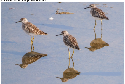
Wood Sandpiper, Mia Milia, 17<sup>th</sup> November.

Max count per location: Agia Varvara 1 6 & 11-Nov CR/IKB Akrotiri Marsh (Phasouri Reed-beds) 2 6-Nov LAC/VT/DJW Mia Milia Water Treatment Plant 15 17-Nov IKB Oroklini Marsh 3 26-Nov JS