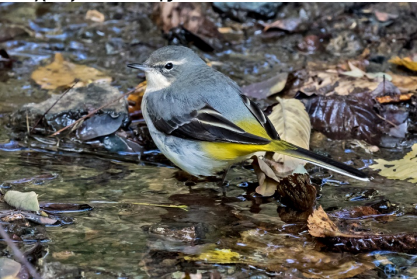
Grey Wagtail, Troodos, 5<sup>th</sup> November.

Max count per location: Agia Napa Sewage Works 1 2-Nov JS Agia Varvara 4 19-Nov DJW Amiantos Botanical Garden 1 8 & 19-Nov JS Aradippou slurry pits 1 15-Nov FGe Arodes 1 8-Nov CR Athalassa Dam 1 20 & 30-Nov SC/FGe Avakas Gorge 1 4, 11, 14, 16 & 17-Nov DJW/IKB/DAB/RAt Bishop's Pool 1 6-Nov LAC/DJW/VT CyKing Village Paphos 1 27-Nov SM Evretou Dam 1 14-Nov DJW Jumbo Drain Larnaca 2 24-Nov LAC Kamares (Tala) 1 20 & 28-Nov DJW Kamares Aqueduct, Larnaca Salt Lake 1 18-Nov JS Kannaviou Dam 1 14-Nov DJW Kouklia 2 11-Nov IKB Lower Ezousas 1 25-Nov IKB Souni 1 heard then seen in flight 29-Nov JN Troodos 1 5-Nov JE