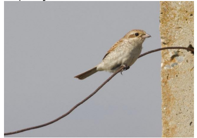
Red-backed Shrike, Lady's Mile, 7<sup>th</sup> November.