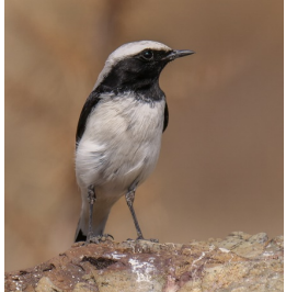
Finsch's Wheatear, Anarita Park, 13<sup>th</sup> November.

Max count per location: Agios Sozomenos 3 males 14-Nov JS Anarita Park 3 Three males in close interaction 2-Nov DHP Avdellero 2 1stW males 2-Nov FGe Evretou Dam 1 male 14-Nov DJW Kidasi 3 males 29 & 30-Nov CR/LAC/DJW