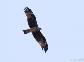
Black Kite, Bishop's Pool, 6<sup>th</sup> November.