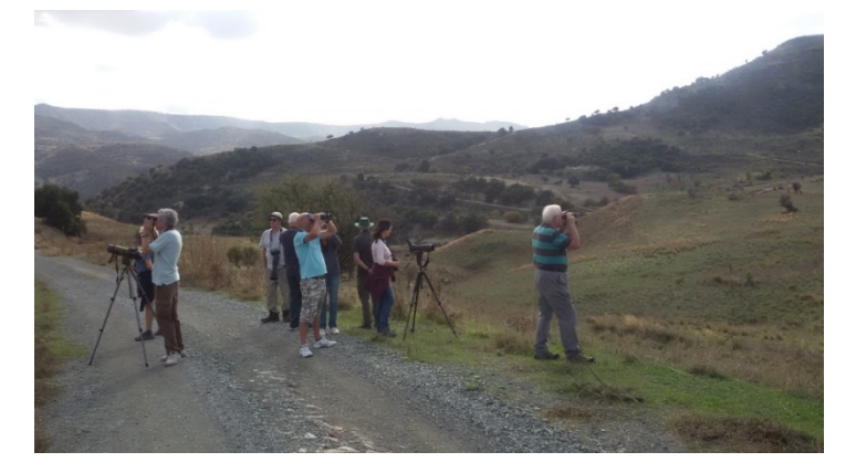
Looking for Finsch's Wheatear's at Kidasi

A total of 29 species were seen exactly the same as last year's trip.