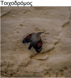
Wallcreeper, Avakas Gorge, 14<sup>th</sup> November.

Avakas Gorge 1 4, 9, 11, 14 & 17-Nov DJW/NA/IKB/RAt Avakas Gorge 2 16-Nov DAB Kensington Cliffs 1 22-Nov RAt