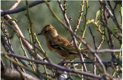
Brambling, Goudi, 8<sup>th</sup> November.