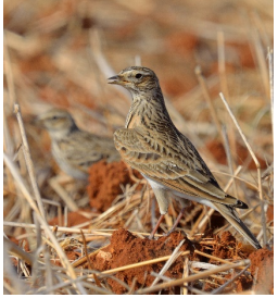
Eurasian Skylark, November 2019.

Largest counts: Kouklia Dam 26 14-Nov CR Larnaca Desalination Plant fields 40+ 18-Nov JS Mandria 50+ 8 & 19-Nov NA/DAB Paphos Sewage Plant 35 20-Nov CR