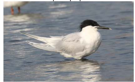
Sandwich Tern, Lady's Mile, 26<sup>th</sup> November.

Lady's Mile 2 12-Nov TRe Lady's Mile 1 13, 18 & 28-Nov ABW/JE/LAC/RAt Lady's Mile 4 one still breeding plumage 26-Nov TRe Oroklini Beach 1 30-Nov JS