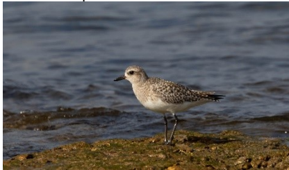
Grey Plover, Agia Trias, 18 th January. Photograph by Jane Stylianou

GREY PLOVER Pluvialis squatarola Στακτοπλουμιδι