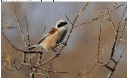
Eurasian Penduline Tit, Larnaca Salt Lake, 28 th January.

EURASIAN PENDULINE TIT Remiz pendulinus Υφάντρα