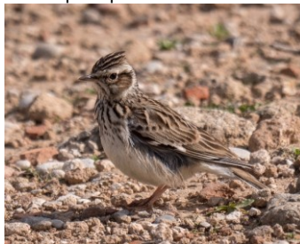
Woodlark, Paphos Headland, 27 th January.