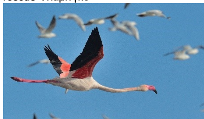
Greater Flamingo, Lady's Mile, January.

Mia Milia Water Treatment Plant 4 12-Jan CC/MC/LS/DK/MM