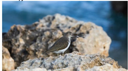
Common Sandpiper, Potamos Liopetriou, 5 th January.