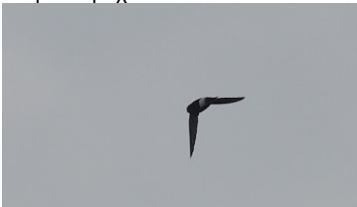
Little Swift, Akrotiri Marsh, 10 th January.

LITTLE SWIFT Apus affinis Μικροπτεροχειλίδο