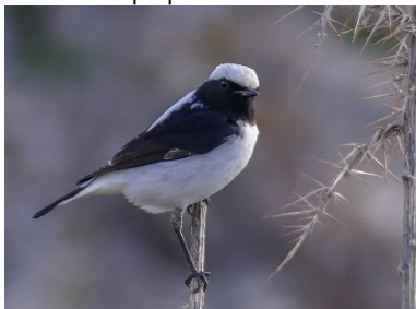
Finch's Wheatear, Anarita Park, 28 th January.

FINSCH'S WHEATEAR Oenanthe finschii Βουνόσκαλιφούρτα