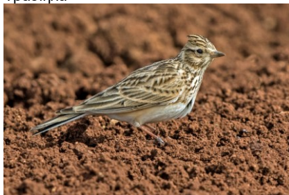
Eurasian Skylark, Mandria, 27 th January.

EURASIAN SKYLARK Alauda arvensis Τρασιήλα