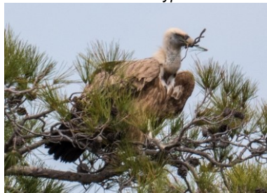
Griffon Vulture, Kensington Cliffs, 26 th January.

otus Αρκόθουπος Lakatameia 1 Over road near JUMBO toy shop at 17:30 18-Jan JS