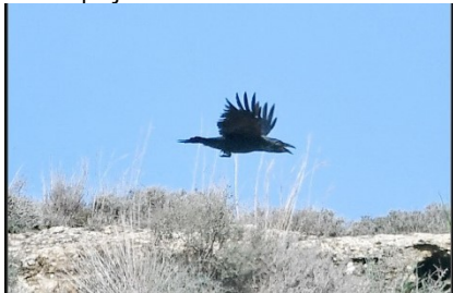
Common Raven, Agios Sozomenos, 5 th January.