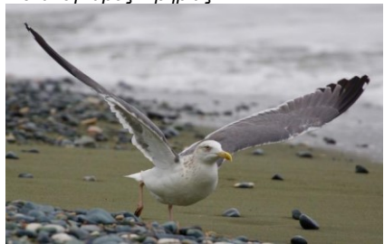
Heuglin's Gull, Lady's Mile, 7 th January.