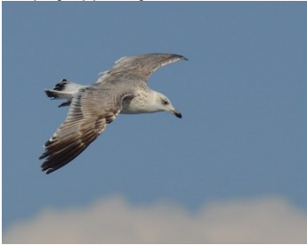
Armenian Gull, Lady's Mile, January.