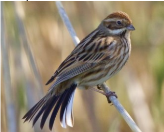
Reed Bunting, Zakaki Marsh, 18 th January.