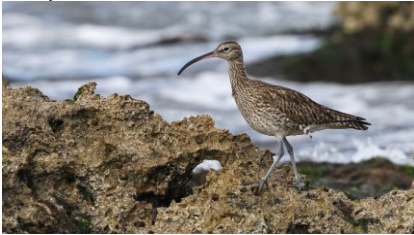
Whimbrel, Paphos Headland, 18 th January.

Paphos Headland 1 7, 12 & 18-Jan CR/WAS/KH