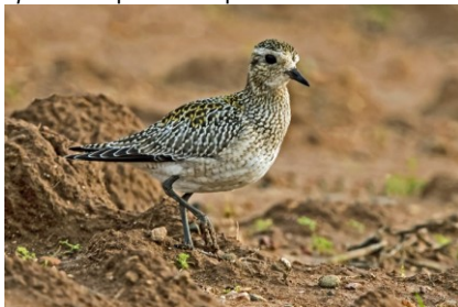
Eurasian Golden Plover, Mandria, 13 th January.

EURASIAN GOLDEN PLOVER Pluvialis apricaria Χρυσοπλουμιδι