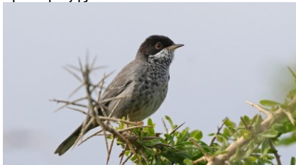
Cyprus Warbler, 22 nd January.

CYPRUS WARBLER Sylvia melanothorax Τρυπομάζης