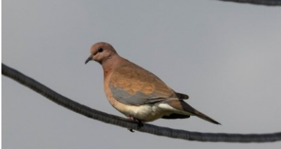
Laughing Dove, Larnaca Salt Lake, 12 th January.

LAUGHING DOVE Spilopelia senegalensis Φοινικοτρύγανο