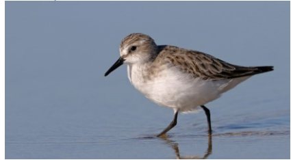
Little Stint, Akrotiri, 17 th January.