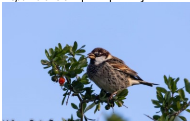
Spanish Sparrow, Agios Sozomenos, 10 th January.

SPANISH SPARROW Passer hispaniolensis Αρκόστρουθος