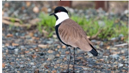
Spur-winged Lapwing, Oroklini Marsh, 5 th January.

SPUR-WINGED LAPWING Vanellus spinosus Πελλοκατερίνα