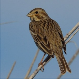
Corn Bunting, January.