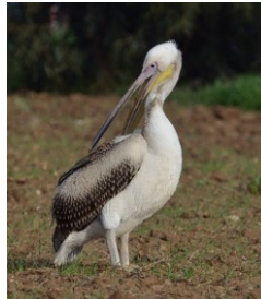
Great White Pelican, Akrotiri, January.

GREAT WHITE PELICAN Pelecanus onocrotalus Ροδοπτελεκάνος