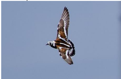
Ruddy Turnstone, Lady's Mile, 7 th May.

Akrotiri Salt Lake 1 5-May AG/SR Akrotiri Salt Lake 3 Zakaki run off area 11-May AG/SR Akrotiri Salt Lake 2 14-May CR Lady's Mile 1 7-May TRe Mandria 5 7-May VT Spiros Pool area 1 3 & 4-May AG/SR