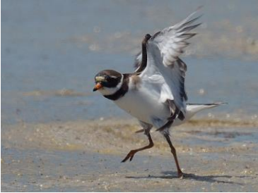
Common Ringed Plover, Lady's Mile, May 2019.