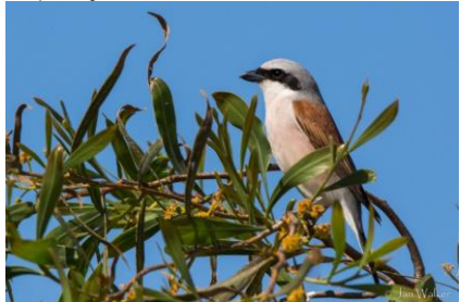
Red-backed Shrike, Arodes, 13 th May.

Largest counts: Androlίκου 14 13-May DJW Kapedes 5 11-May FGe Vretsia 7 7-May VT