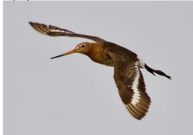
Black-tailed Godwit, Akrotiri Salt Lake, 23 rd May.

Akrotiri Salt Lake 1 Zakaki run off 2 & 6-May JS/VT