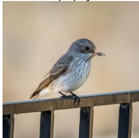
Spotted Flycatcher, Goudi, 9 th May.