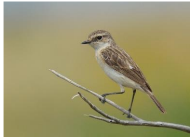
Eastern Siberian Stonechat, Paphos Headland, 1 st May.

Saxicola torquatus maurus Σιβηρική Παπαθικά