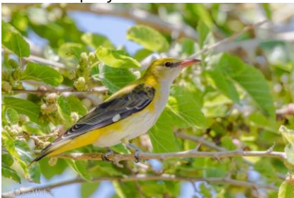
Eurasian Golden Oriole, Arodes, 13 th May.

Cape Drepanum 1 7-May AG/SR Paphos 2 2 juveniles 15-May DJW Germasogeia Dam 1 15-May ADT Kensington Cliffs 1 15 & 24-May AG/SR/JS