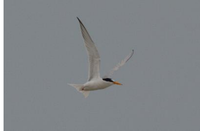
Little Tern, Akrotiri, May 2019.

Max count per location and interesting reports: