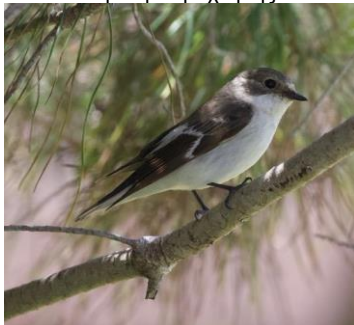
Collared Flycatcher, Akrotiri Gravel Pits, 7 th May.

Akrotiri Gravel Pits 1 6-May JE Neo Horio 2 one male 7-May AG/SR Timi Beach 1 5-May LAC