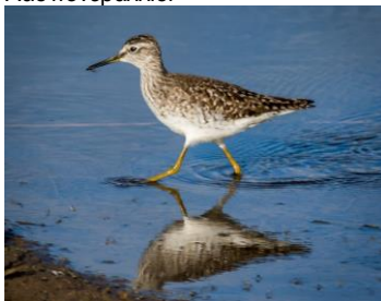
Wood Sandpiper, Evretou Dam, 3 rd May.