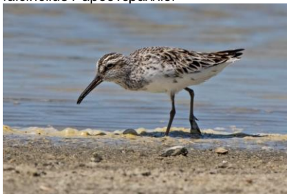
Broad-billed Sandpiper, 4 th May.

Largest counts: Akrotiri Salt Lake 70+ Zakaki run off area 10-May LAC Kouklia Dam 60 17-May AG/SR/MC/CC et al Paralimni Lake 25+ 12-May AG/SR