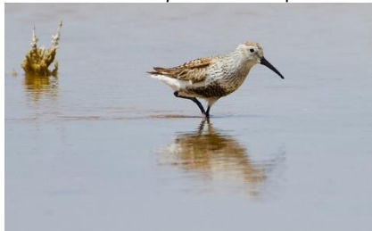
Dunlin, Akrotiri Salt Lake, 23 rd May.

Max count per location: Akrotiri Gravel Pits 6 Pool near old rabbit farm sheds 11-May AG/SR Akrotiri Salt Lake 5 Zakaki run off area 8- May TRe Karpasia 1 2 & 3-May PLH Lady's Mile 2 4-May LAC Lower Ezousas 1 7-May NA Spiros Pool area 4+ 4-May AG/SR