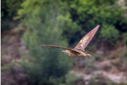
Eurasian Bittern, Evretou Dam, 9 th May.