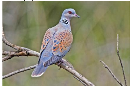
European Turtle Dove, Oroklini Marsh, 1 st May.

EUROPEAN TURTLE DOVE Streptopelia turtur Τρυγόνι