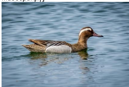
Garganey, Larnaca Sewage Works, 23 rd May.