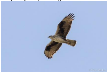
Bonelli's Eagle, Evretou Dam, 16 th May.