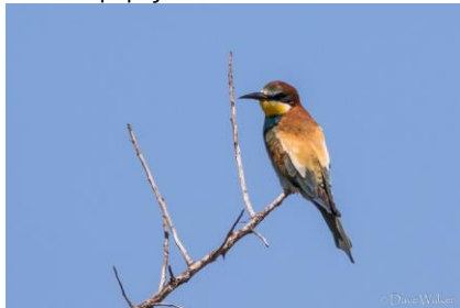
European Bee-eater, Cape Kormakitis, 7 th May.

110 reports of this species for May. Largest counts: