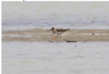
Terek Sandpiper, Akrotiri Salt Lake, 22 nd May.