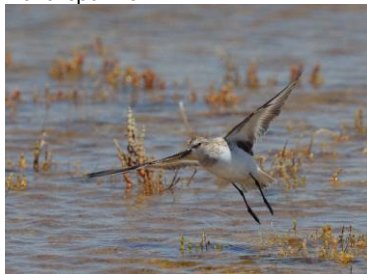
Little Stint, Lady's Mile, May 2019.

Akrotiri Salt Lake 1 Zakaki run off area 23-May TRe Lady's Mile 2 3-May TRe Lady's Mile 1 5 & 14-May AG/SR/TRe Spiros Pool area 1 3-May AG/SR