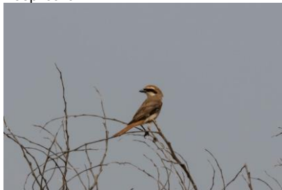
Red-tailed Shrike, Larnaca Sewage Works, 22 nd May.

Agios Filonas 8 4m, 4 fem 22-May CR Cape Andreas 10 4 fems 22-May CR Karpasia 10 2-May PLH Vretsia 7 7-May VT