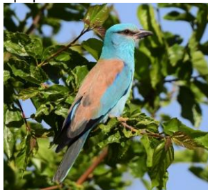
European Roller, Androlikou, 13 th May.