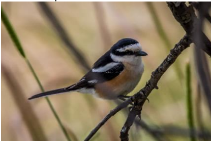
Masked Shrike, Filousa, 7 th May.

MASKED SHRIKE Lanius nubicus Δακκαννούρα