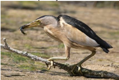
Common Little Bittern (male), Zakaki Marsh, 10 th May.

Agia Varvara 1 flushed from river bank 17-May CR Akrotiri Gravel Pits 1 Seen flying near church 1-May MPa Akrotiri Salt Lake 1 Zakaki run off area 5, 8 & 14-May AG/SR/TR Evretou Dam 1 9 & 11-May MCa/AG/SR/Ra/CR