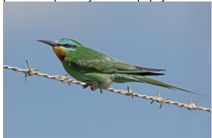
Blue-cheeked Bee-eater, Lady's Mile, 8 th May.

Asprokremmos Dam 1 10-May RAT Fasli 1 heard only 11-May AG/SR Lady's Mile 1 8-May JE/ABW/TRe