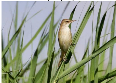
Great Reed Warbler, Akrotiri Salt Lake, 9 th May.