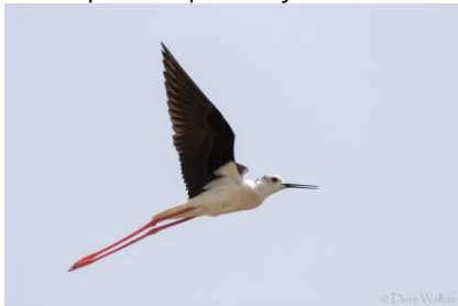
Black-winged Stilt, Akrotiri Gravel Pits, 29 th May.

BLACK-WINGED STILT Himantopus himantopus Καλαμοκαννάς