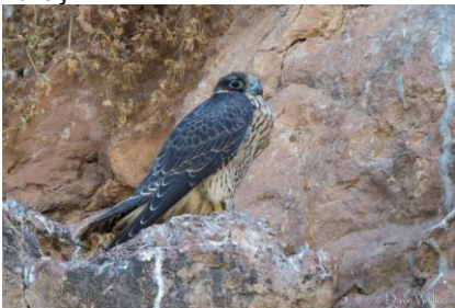
Peregrine Falcon, Paphos, 15 th May.

Fota Dam 1 sunset visit, hunting 22-May CR Kamares (Tala) 2 1, 5, 22, 27 & 29-May DJW Kamares (Tala) 1 20 & 31-May DJW Larnaca Sewage Works 1 Flew over 21-May JS Phasouri Reed-beds 1 hawking insects 4-May JN Zanađja 1 juvenile(s) heard calling 20-May JN