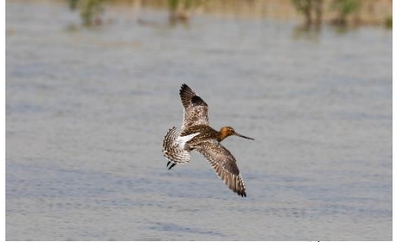
Bar-tailed Godwit, Akrotiri Salt Lake, 2 nd May.

Akrotiri Salt Lake 2 Zakaki run off area 6-May VT