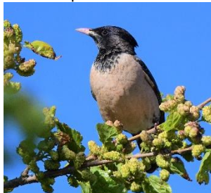
Rose-coloured Starling, Androlikou, 13 th May.

Agios Filonas 1 singing ad, perched near Oasis Rooms 22-May CR