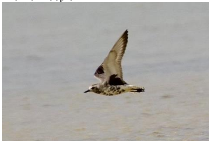
Grey Plover, Akrotiri Salt Lake, 23 rd May.

GREY PLOVER Pluvialis squatarola Στακτοπλουμίδι