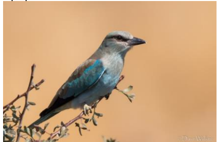
European Roller, Anarita Park, 29 th July.