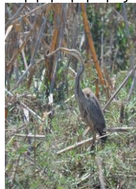
Purple Heron, Akrotiri Marsh, 1 st July.