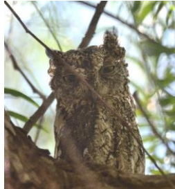
Scops Owl, Koili, 15 th July.

COMMON BARN OWL Tyto alba Αθρωποπούλλι Erimi 1 12-Jul ABW Kinousa 1 Sat on wires 2-Jun RAT Lower Xeros Potamos 1 under motorway bridge 23-Jun CR Politiko 1 juvenile standing in nest entrance 24-Jul FGe