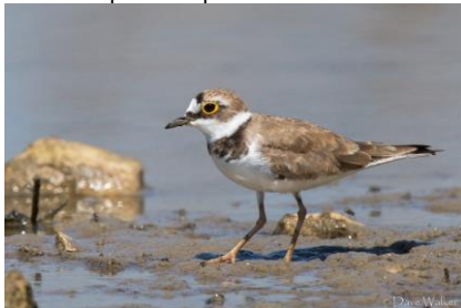
Little Ringed Plover, Evretou Dam, 20 th July.