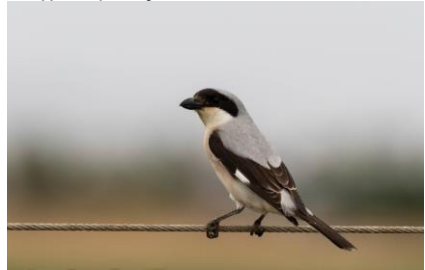
Lesser Grey Shrike, Pervolia, 4 th June.