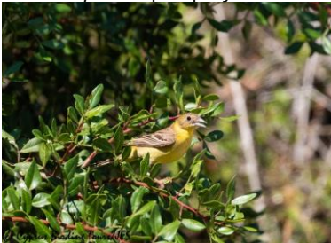
Black-headed Bunting, Smygies, 29 th June.