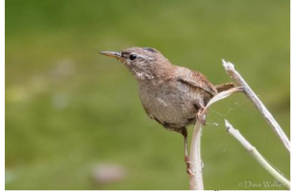
Northern Wren, Avakas Gorge, 14 th June.

NORTHERN WREN Troglodytes troglodytes Τρυποκάρυδο