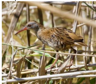
Western Water Rail, Zakaki Marsh, 15 th July.