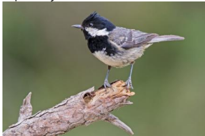
Coal Tit, Troodos, 4 th June.

Kannoures trail c35 29-Jun FGe Lagoudera c20 29-Jun FGe Machairas Forest c45 8-Jun FGe Mandra tou Kampiou East c30 including 2 family parties 6-Jun FGe