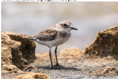
Greater Sandplover, Paphos Headland, 21 st July.

Paphos Headland 1 moulting ad. 26-Jun CR