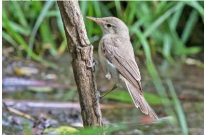
Eastern Olivaceous Warbler, Troodos, 28 th June.

Almyrolivado 7+ 5 heard only and two others seen 2-Jul JS