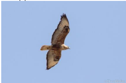
Long-legged Buzzard, Stroumbi, 11 th June.