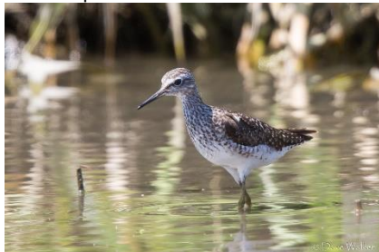
Wood Sandpiper, Evretou Dam, 20 th July.

Akrotiri Salt Lake 1 10-Jun & 1-Jul AG/TRe Asprokremmos Dam 5 14-Jul DJW Diarizos River Valley, Kouklia 1 damaged leg 14-Jul CR Evretou Dam 1 16-Jul CR Evretou Dam 2 31-Jul DJW Meneou Pool 2 30 & 31-Jul CR/JS Nata, Paphos 1 14-Jul DJW Oroklini Marsh 1 14-Jun & 25 & 30-Jul AnS/AG/JS/CR Polis Chrysochou Bay 22 in flight over sea 90% sure 16-Jul CR