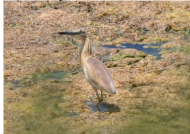
Squacco Heron, Oroklini Marsh, 10 th June.