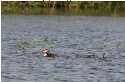
Great Crested Grebe family, Akhna Dam, 10 th June.

Akhna Dam 3+ Three ads with five small young 10 & 11-Jun JS/FGE