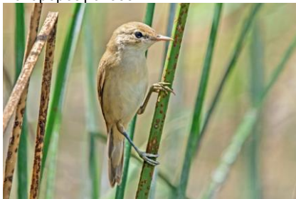
Eurasian Reed Warbler, Zakaki Marsh, 2 nd June.

Akrotiri Marsh 9 inc. 2 fledglings taking food 4-Jun ABW