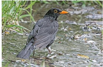
Eurasian Blackbird, Troodos, 28 th June.

EURASIAN BLACKBIRD Turdus merula ♂ Μαυρόπουλλος (♀ Μαυρότζικλα)