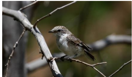
Masked Shrike juv, Livadi tou Pashia, 2 nd July.