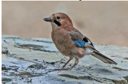
Eurasian Jay, Troodos, 11 th June.