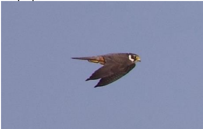
Eurasian Hobby, Akrotiri Salt Lake, 24 th June.