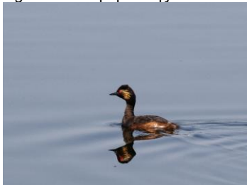
Black-necked Grebe, Kouklia Dam, 8 th June.

Kouris Dam 1 pair - area seen on 14 Jun now submerged but new nest with four eggs seen elsewhere. Adult on nest. 29-Jun ADT