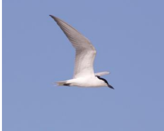
Common Gull-billed Tern, Akrotiri Salt Lake, 2 nd July.

Oroklini Marsh 9 Incl at least four juvs 25-Jul JS Spiros Beach 1 Fishing offshore 24-Jun & 5-Jul JS Spiros Pool 4 25-Jun & 6-Jul JS