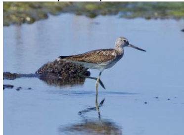
Common Greenshank, Akrotiri Gravel Pits, 24 th June.

COMMON GREENSHANK Tringa nebularia Πρασινονεραλλίδι