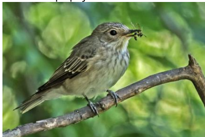
Spotted Flycatcher, Troodos, 30 th July.