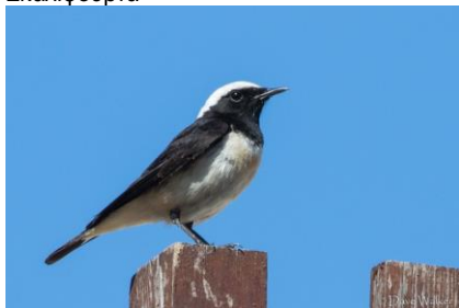
Cyprus Wheatear, Tala, 7 th June.

110 reports received for this species for June & July. Largest counts and interesting reports: