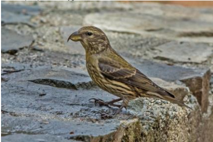
Red Crossbill, Troodos, 12 th June.

Almirolivado Picnic area 1 heard 18-Jul CR