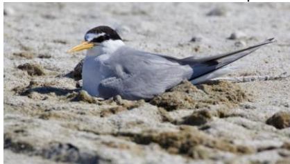
Little Tern, Akrotiri Salt Lake, 24 th June.

Akrotiri Salt Lake 1 Zakaki run off area 24- Jun TRe Spiros Beach 1 Immature bird 3-Jun JS