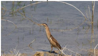
Common Little Bittern, Achna Dam, 14 th May.