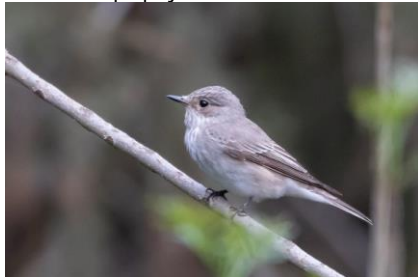
Spotted Flycatcher, Kamares, Tala, 3 rd May.