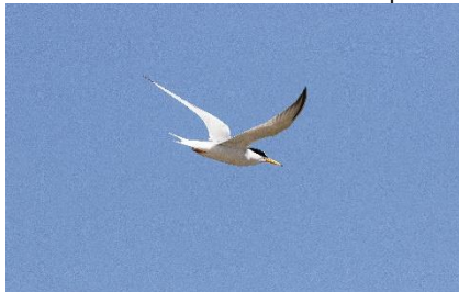
Little Tern, Achna Dam, 10 th May.