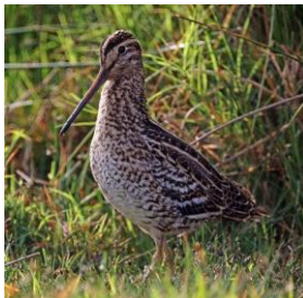
Great Snipe, Akrotiri Marsh, 4 th May.

Akrotiri Marsh (Phasouri Reed-beds) 1 4-May TRe/AG