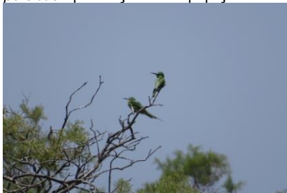
Blue-cheeked Bee-eater, Akrotiri Gravel Pits, 14 th May.