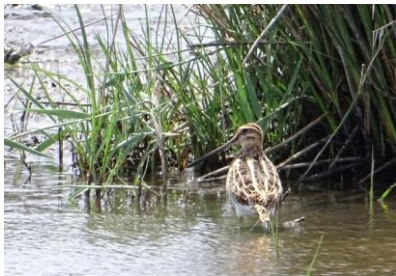
Common Snipe, Akrotiri Marsh, 6 th May.

Achna Dam 1 8-May GS/FGe Achna Dam 2 10-May JS Akrotiri Marsh (Phasouri Reed-beds) 1 6 & 7-May AL Akrotiri Marsh (Phasouri Reed-beds) 2 9 & 11-May AL/CR Evretou Dam 1 14-May DJW Mavrokolymbos Dam 1 16-May DJW Polis camp site 1 14-May AG