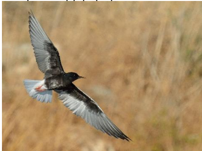
White-winged Tern, Agia Varvara, 13 th May.