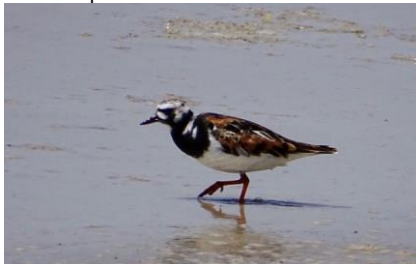
Ruddy Turnstone, Akrotiri Salt Lake, 28 th May.

Akrotiri Salt Lake 1 ad 11 & 15-May CR Akrotiri Salt Lake 2 28 & 31-May AL/TRE