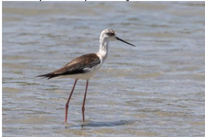
Black-winged Stilt, Evretou Dam, 14 th May.