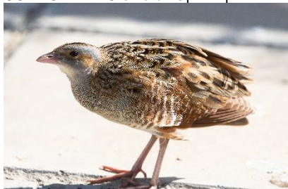
Corncrake, Meneou, 2 nd May.

Meneou Beach 1 Sitting by side of road but flew off on approach 2-May JS