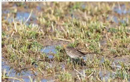
Red-throated Pipit, Pervolia, 11 th May.

RED-THROATED PIPIT Anthus cervinus Κοτσινογαλούδι