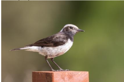
Cyprus Wheatear, Kamares, Tala, 21 st May.