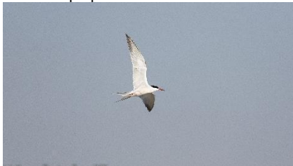
Common Tern, Larnaca Sewage Works, 15 th May.