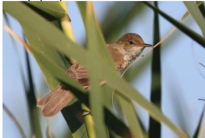
Eurasian Reed Warbler, Akrotiri Marsh, 10 th May.