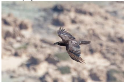
Common Raven, Akamas, 12 th May.

Akamas 4 2 adults feeding 2 juveniles in nest on cliff ledge. First seen 2 adults Baths of Aphrodite area and again along the coast road towards Fontana Amorosa, until nest location found 11-May DJW