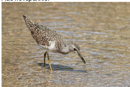
Wood Sandpiper, Mavrokolymbos Dam, 16 th May.

WOOD SANDPIPER Tringa glareola Λάσπονεραλλίδι