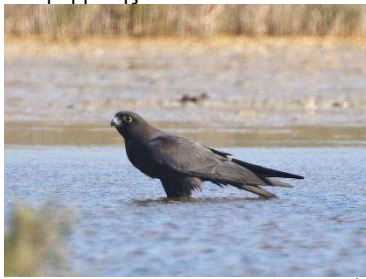
Eleonora's Falcon, Akrotiri Salt Lake, 4 th May.