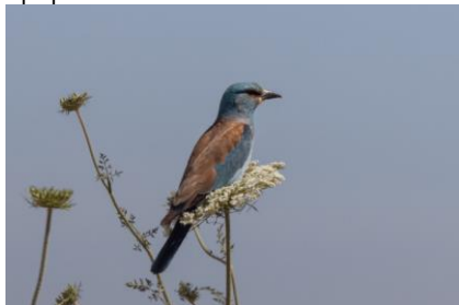
European Roller, Androlikou, 7 th May.