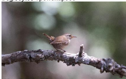
Northern Wren, Caledonia Trail 26 th May.