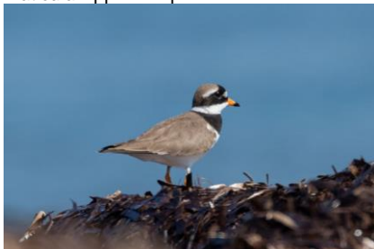
Common Ringed Plover, Paphos Headland, 13 th May.