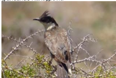
Great Spotted Cuckoo, Akrotiri Gravel Pits, 14 th May.

Singles recorded from suitable habitat all month. Reports of two or more: