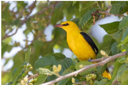
Eurasian Golden Oriole, Androlίκου, 7 th May.