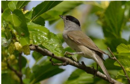
Eurasian Blackcap, Kathikas, 9 th May.