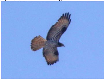
European Honey Buzzard, Akrotiri Marsh, 19 th May.

EUROPEAN HONEY BUZZARD Pernis apivorus Μελισσοσίχλινο