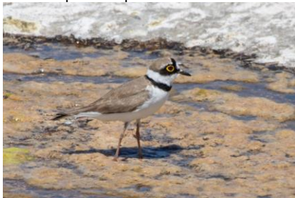
Little Ringed Plover, Nata, 15 th May.

Akrotiri Gravel Pits 1 13-May AL Akrotiri Marsh (Phasouri Reed-beds) 1 17, 23 & 24-May AL/AG Lady's Mile 5 2-May AL Nata Xeros Crossing 1 15-May DJW Paralimni Lake 2 2-May AG Paralimni Lake 6 15-May FGe Paralimni Lake 1 19-May AG