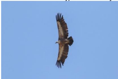
Griffon Vulture, Diarizos Valley, 20 th May.

Dora 2 25-May DJW Kensington Cliffs 4 23 & 25-May AL/JS Kensington Cliffs 2 30-May AL Roudias Bridge, Xeros Potamos, Paphos 10 20-May DJW Sotira goat farm 1 juv 26-May ADT Troodos 6+ Maximum seen together was 6 birds, possibly 1 or 2 more in the area 15-May AG Xeros Potamos, Paphos 5 25-May MH