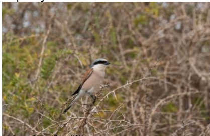
Red-backed Shrike, Cape Greco, 4 th May.