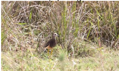
White-tailed Lapwing, Achna Dam, 8 th May.