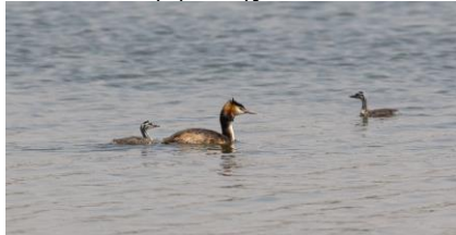
Great Crested Grebe, Achna Dam, 28 th May.

Achna Dam 2 8-May FGe/SC/MC/CC/MH Achna Dam 1 14-May PBr Achna Dam 2 two ads and two chicks 21 & 28-May JS Asprokremmos Dam 1 28-May DJW