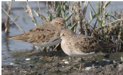
Temminck's Stint, Akrotiri Marsh, 4 th May.