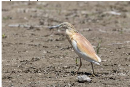
Squacco Heron, Evretou Dam, 14 th May.