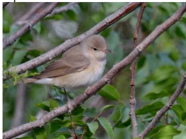
Garden Warbler, Baths of Aphrodite, 15 th May.

Baths of Aphrodite 1 15-May ABW Spiros Pool 1 11-May JS Meneou Beach 1 Heard singing 2, 3 & 4- May JS Agios Dimitrios Park, Nicosia 2 26-May TK