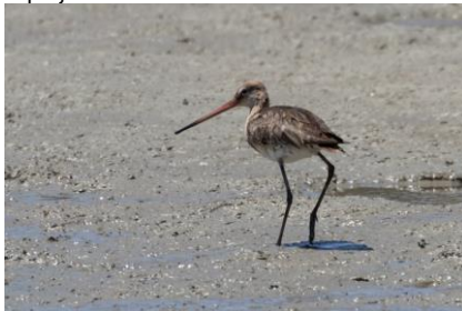
Black-tailed Godwit, Evretou Dam, 14 th May.

Achna Dam 1 8-May FGe/SC Akrotiri Marsh (Phasouri Reed-beds) 1 4- May TRE Evretou Dam 1 14-May DJW