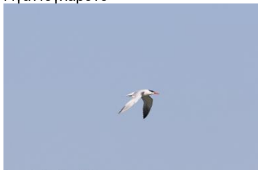
Caspian Tern, Larnaca Sewage Works, 23 rd May.

Larnaca Sewage Works 1 Flew in and stayed over area for ten mins 09:25 - 09:35. Photographed 23-May JS