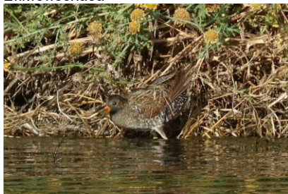
Spotted Crake, Agia Varvara, 11 th May.

Achna Dam 1 8-May FGe Agia Varvara 1 11-May TF Zakaki Marsh 1 9 & 14-May AL