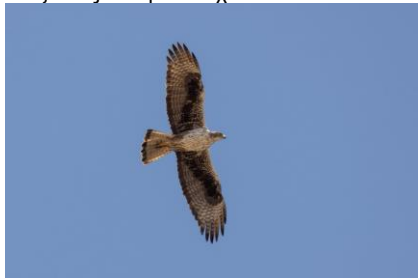
Bonelli's Eagle, Androlikou, 7 th May.