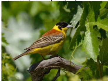
Black-headed Bunting, May 2021. Photograph by Andy Waller

BLACK-HEADED BUNTING Emberiza melanocephala Τηρίλιγγος