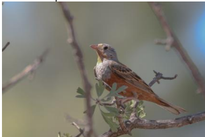
Cretzschmar's Bunting, Vretsia, 20 th May.

CRETZSCHMAR'S BUNTING Emberiza caesia Σιταροπούλλι