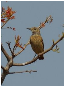
Rufous-tailed Rock Thrush, female, Paphos Headland, 4 th April.

Anafotia 1 female 16-Apr MC/MaC Cape Greco 1 Male 6, 8 & 15-Apr JS/SC Paphos headland 1 fem 4-Apr ABW