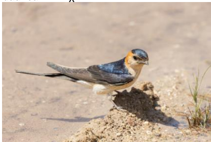
Red-rumped Swallow, Androlikou, 29 th April.