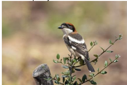
Woodchat Shrike, Androlikou, 29 th April.