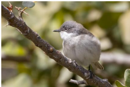
Lesser Whitethroat, Baths of Aphrodite, 6 th April.

Largest counts: Akrotiri Gravel Pits 30+ 4-Apr AG Cape Greco 40+ 7-Apr AG Smygies 12 6-Apr DJW