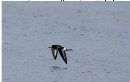
Eurasian Oystercatcher, Spiros Beach, 11 th April.

Lady's Mile 1 17-Apr AG Spiros Beach 1 Flew in off sea about 11:30 and then along beach, settling every few yards. Then flew onto Spiros Pool and fed for about ten minutes before returning to beach and then flying E as disturbed by people were walking on beach 11-Apr JS