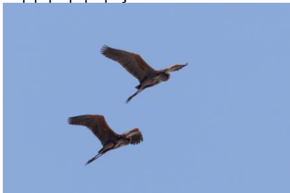
Purple Heron, Paphos Headland, 12 th April.