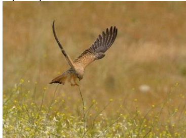
Lesser Kestrel, 18 th April.