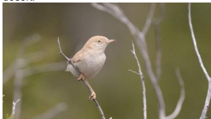
African Desert Warbler, Akrotiri 19 th April.

Akrotiri Fishing shelter area 1 First for Cyprus. Missing tail 19-Apr TH/SC/AG/GS/JS (First record for Cyprus if accepted. Rare Bird received)