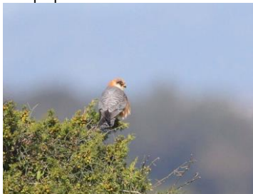
Red-footed Falcon, Lady's Mile, 9 th April.

Agia Napa Sewage Works 1 male 28-Apr SC Akrotiri Marsh (Phasouri Reed-beds) 1 Female 10-Apr AL Akrotiri Marsh (Phasouri Reed-beds) 1 Male 11-Apr AL Akrotiri Marsh 2 18-Apr AG Kivisili 1 Male on wires 24-Apr JS Lady's Mile 1 9-Apr TRe