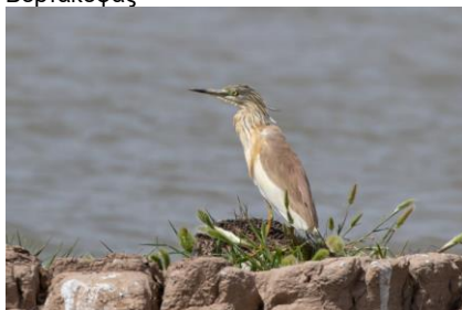
Squacco Heron, Asprokremmos Dam, 17 th April.