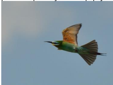
Blue-cheeked Bee-eater, Meneou Pool, 13 th April.