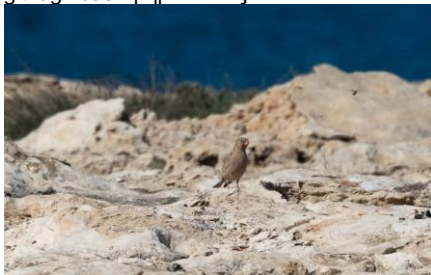
Trumpeter Finch, Petounta Point, 24 th April.

Petounta Point 1 On seaward edge of plateau. Flew E. Not relocated 24-Apr JS