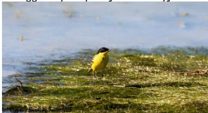
Black-headed Wagtail, Petounta Point, 24 th April.