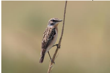
Whinchat, Androlikou, 24 th April.

Agia Varvara 1 15 & 19-Apr CR Akamas 1 21-Apr DJW Akrotiri Marsh (Phasouri Reed-beds) 1 10, 12 & 16-Apr AL Anarita Park 1 m 12-Apr CR Androlikou 2 24-Apr DJW Cape Greco 12 7-Apr AG Cape Greco 1 male 8-Apr SC Kathikas 1 24-Apr DJW Lady's Mile 1 male 25-Apr KyK Latchi 2 6-Apr DJW Mandria 1 m 11-Apr CR Marathounta lower 1 m 15-Apr CR