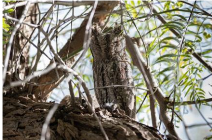
Cyprus Scops Owl, Episkopi (Paphos), 17 th April.