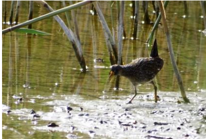
Spotted Crake, Zakaki Marsh, 18 th April.