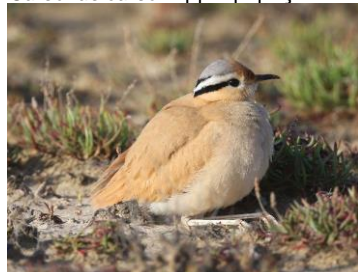
Cream-coloured Courser, Akrotiri Gravel Pits, 9 th April.