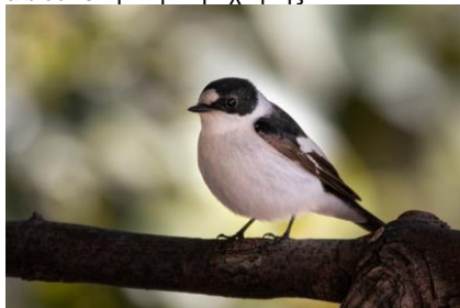
Collared Flycatcher, Tala, 4 th April.