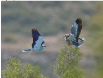
European Roller, 25 th April.