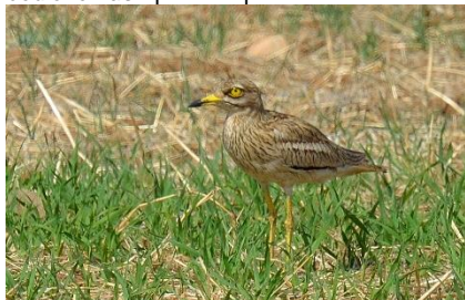
Eurasian Thick-knee, Paphos Sewage Works, 25 th April.

Agia Napa Sewage Works 1 23-Apr JS Agia Varvara 1 5-Apr DJW Dekeleia 2 4-Apr MH Dekeleia 1 11-Apr MH Geri 3 3-Apr FGe Kiti to Petounta Road 3 One in flight and two other in field - probably pair 30-Apr JS Kivisili Fields c8 20-Apr SC Kivisili Fields 2 24 & 30-Apr SC/JS Mandria 29 2-Apr CR Mandria 1 7 & 11-Apr CR Paphos Headland 1 12-Apr DJW Paphos sewage works 1 25-Apr ABW