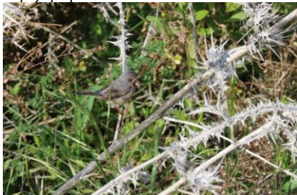
Subalpine Warbler, Anarita Park, 4 th April.

Agia Varvara 3 2m, f 3-Apr CR Agia Varvara 1 m 4-Apr CR Akrotiri Gravel Pits 1 4-Apr AG Akrotiri Gravel Pits 2 5-Apr TRe Asprokremmos Dam 1 m 2-Apr CR Baths of Aphrodite 1 6-Apr DJW Pissouri 1 Only briefly seen 5-Apr GJ Paphos headland 1 4 & 5-Apr ABW/CR Smygies 1 10-Apr GJ