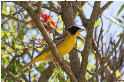
Black-headed Bunting, Kathikas, 24 th April.

Agia Napa Sewage Works 2 Both singing and on territory 23-Apr JS Akamas Peninsula 5 25-Apr MH Androlikou 1 20-Apr GS Androlikou 2 24 & 29-Apr DJW Cape Greco 1 23 & 27-Apr JS Kathikas 4 24-Apr DJW Kathikas 3 25-Apr MC/CC/MaC/MH Kathikas 8 7 male 1 female 29-Apr DJW Prastio Kellakiou, Kyparissia Trail 2 25- Apr ADT Smygies 1 29-Apr DJW