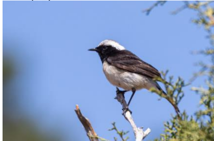
Cyprus Wheatear, Akamas, 21 st April.

140 reports of this species received for April. Largest counts: Akamas 25 5 pairs noted 21-Apr DJW Cape Greco 15 11 males and two pairs on known territories 2-Apr JS Kionia 7 29-Apr MH Panagia Tou Sinti Monastery 6 17-Apr DJW Souni 7 1 pair and others all males 2-Apr JN Vougies 7 8-Apr FGe