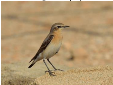
Northern Wheatear, 4 th April.