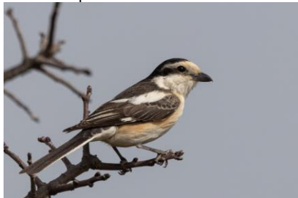
Masked Shrike, Latchi, 6 th April.