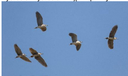
Black-crowned Night Heron, Pervolia, 14 th April.