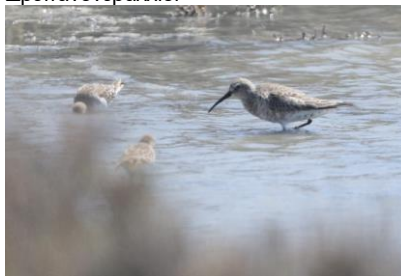
Curlew Sandpiper, Lady's Mile, 9 th April.

First reports and max count per location: Akrotiri Salt Lake 3 Zakaki run off area 30-Apr AG Lady's Mile 1 9-Apr TRE Lady's Mile 17+ 17-Apr AG Meneou Pool 1 16-Apr JS Paralimni Lake 6 28-Apr AG/AC