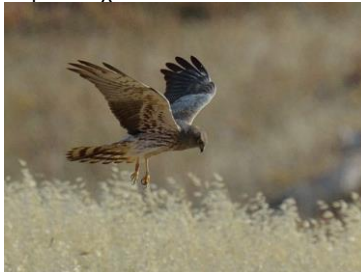
Montagu's Harrier, Anarita Park, 20 th April.

Akrotiri Gravel Pits 1 Female 18 & 19-Apr AG/AL Akrotiri Salt Lake 1 20-Apr TRe Alaminos 2 A female over fields near coast and a male over fields inland 18-Apr JS Anarita Park 2 male & female adults 18- Apr ABW Anarita Park 1 20, 24 & 25-Apr ABW/MC/CC/MaC/MH Cape Greco 1 female 23-Apr JS Cape Greco 2 7 & 27-Apr AG/JS Cape Greco 3 females. two heading N along coast and one over pines later in day 16-Apr JS Deryneia 1 22-Apr PBr Drouseia - Androlίκου 3 1m and 2f 19-Apr GS Kivisili 2 Males 17-Apr JS Kivisili 1 20, 22 & 25-Apr JS/SC Kivisili Fields c8 various ages including adults of both sexes 24-Apr SC Lady's Mile 1 male 25-Apr KyK Mandria 1 fem 11-Apr CR Paramali 1 male 16-Apr GS Pervolia fields 1 26-Apr JS