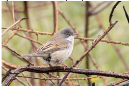
Common Whitethroat, Anarita Park, 5 th April.