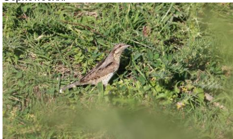
Eurasian Wryneck, Anarita Park, 13 th April.

Akrotiri Gravel Pits 1 4, 5 & 18-Apr AG/TRe Anarita Park 1 5 & 12-Apr DJW/CR Androlikou - Neo Chorio 1 13-Apr CR Cape Greco 2 12-Apr JS Cape Greco 1 13-Apr AG Latsi, Paphos 1 6-Apr DJW Paralimni Lake 1 28-Apr AG/AC Troodos 1 singing very actively 29-Apr GS