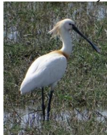
Eurasian Spoonbill, Akrotiri Marsh, 1 st April.