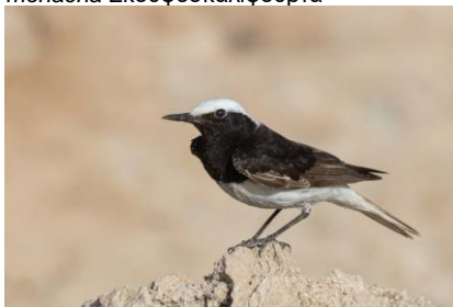
Hooded Wheatear, Cape Drepanum, 26 th April.

Akrotiri fish farm coast 1 female 21-Apr TH Avakas Gorge entrance 1 male. Photos posted on BC FB group 27-Apr PhP Cape Drepanum 1 25, 26 & 28-Apr CR/MH/CC/MC/MaC/DJW