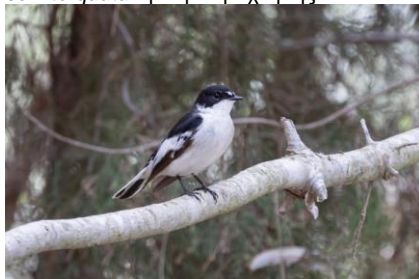
Semi-collared Flycatcher, Tala, 18 th April.

Kamares (Tala) 1 18-Apr DJW Paralimni 1 1 & 18-Apr TP