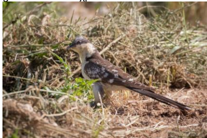
Great Spotted Cuckoo, Kathikas, 21 st April.

GREAT SPOTTED CUCKOO Clamator glandarius Καλοχρονιά