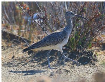
Whimbrel, Lady's Mile, 9 th April.

Akrotiri Marsh (Phasouri Reed-beds) 2 On scrubland at back of marsh towards Ariel farm 30-Apr AL Akrotiri Salt Lake 1 Zakaki run off area 20-Apr TRE Lady's Mile 1 9-Apr TRE Larnaca Airport Coast 1 Briefly on rocks then flew west 30-Apr JS