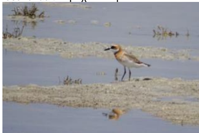
Greater Sandplover, Lady's Mile, 16 th April.

Akrotiri Shipwreck Coast 1 17-Apr SC Lady's Mile 2 16-Apr AL/TRE Mandria 1 scythicus, nearly in breeding plum 20-Apr CR