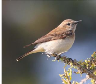
Black-eared Wheatear, Akrotiri 9 th April.

Largest counts: Agia Varvara 4 2 black-thr males, 1 pale-thr, 1 dark-thr fem 4-Apr CR Akrotiri Gravel Pits 6 5-Apr TRe/AL Cape Greco 8 One female, one male light throat and six males dark throated 16-Apr JS